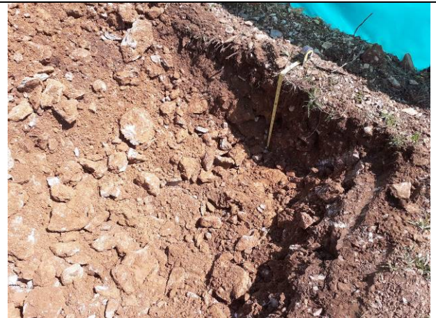
24.06.20 – TP8