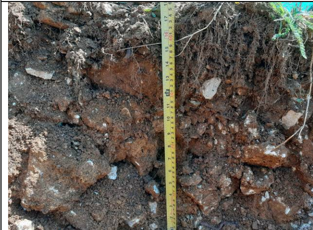
24.06.20 – TP8