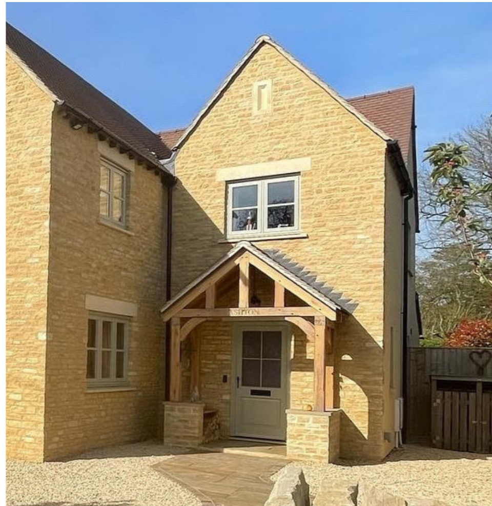
Fig. 4 - Precedent example of Grange Hill Cream