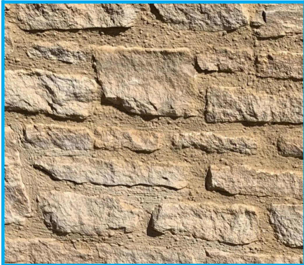
Fig. 6 - Detailed photo of the Grange Hill Cream sample panel built on site