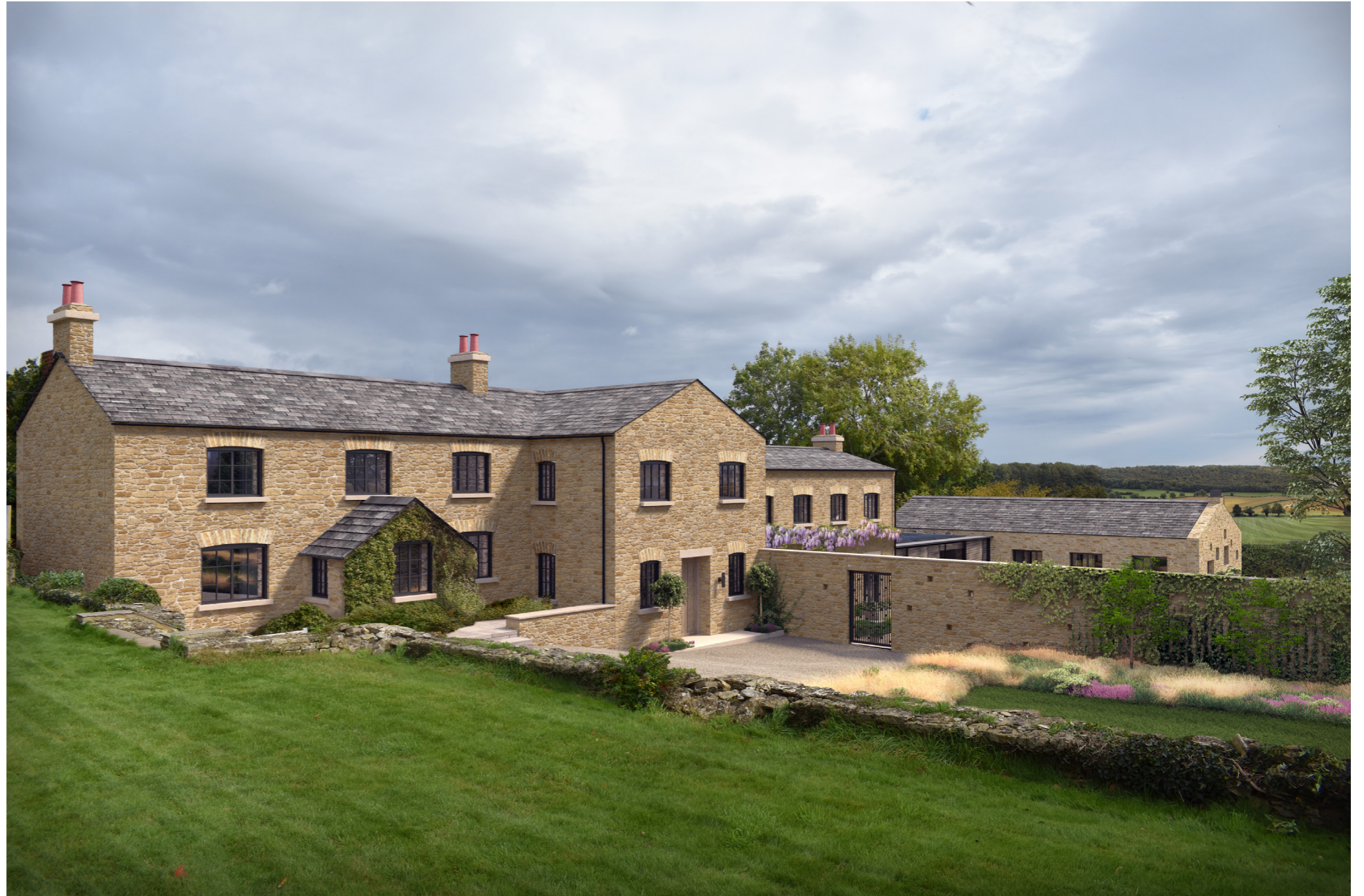
CGI of the proposed building using the Grange Hill Cream stone

This document provides photos of the stone sample panel built on site along with examples of completed buildings using the proposed stone.