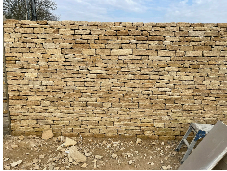
Fig. 2 - Grange Hill Cream Dry Wall at Cotswold Natural Stone quarry