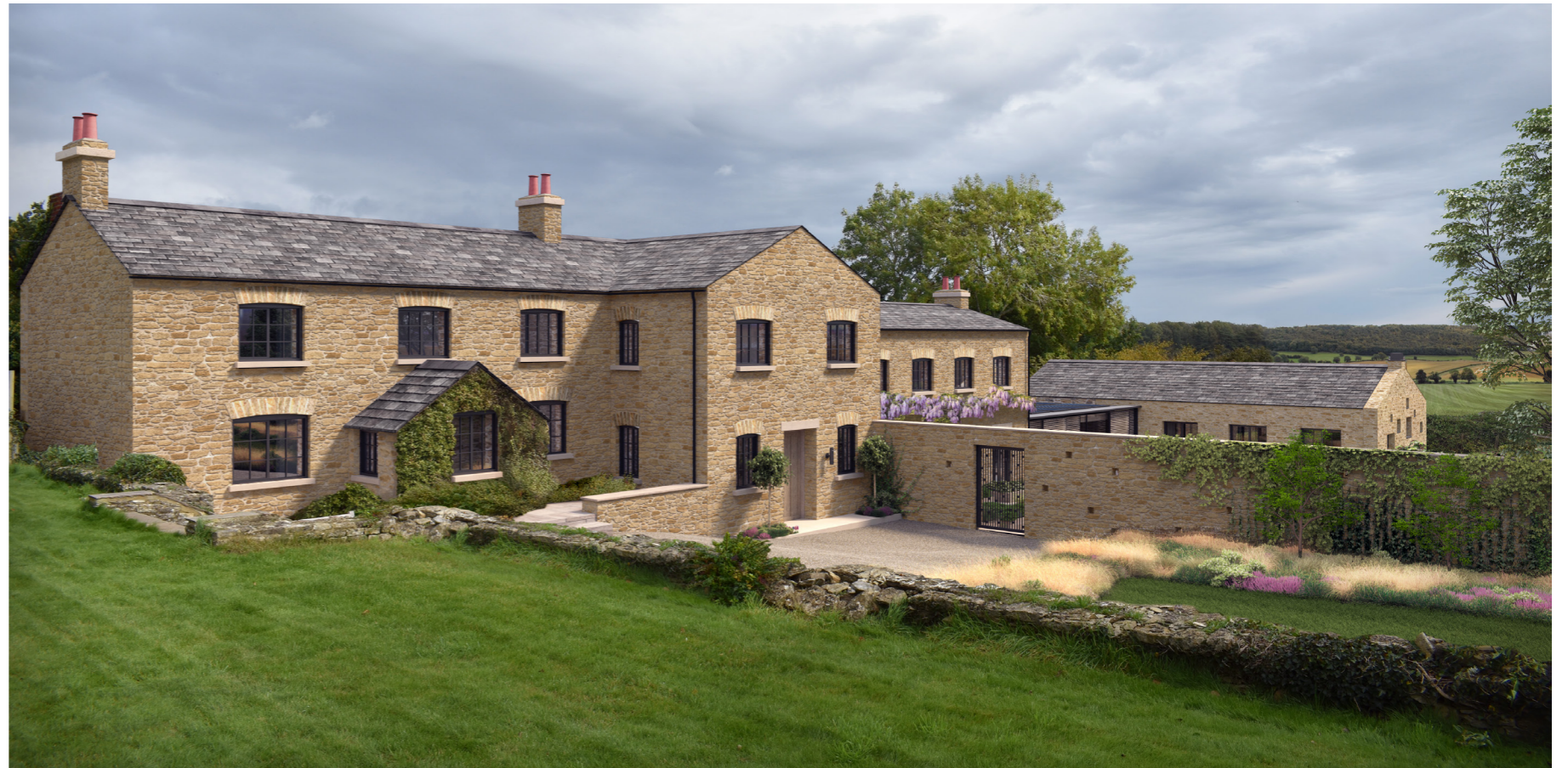
Fig. 7 - CGI of the proposed building using the Grange Hill Cream stone