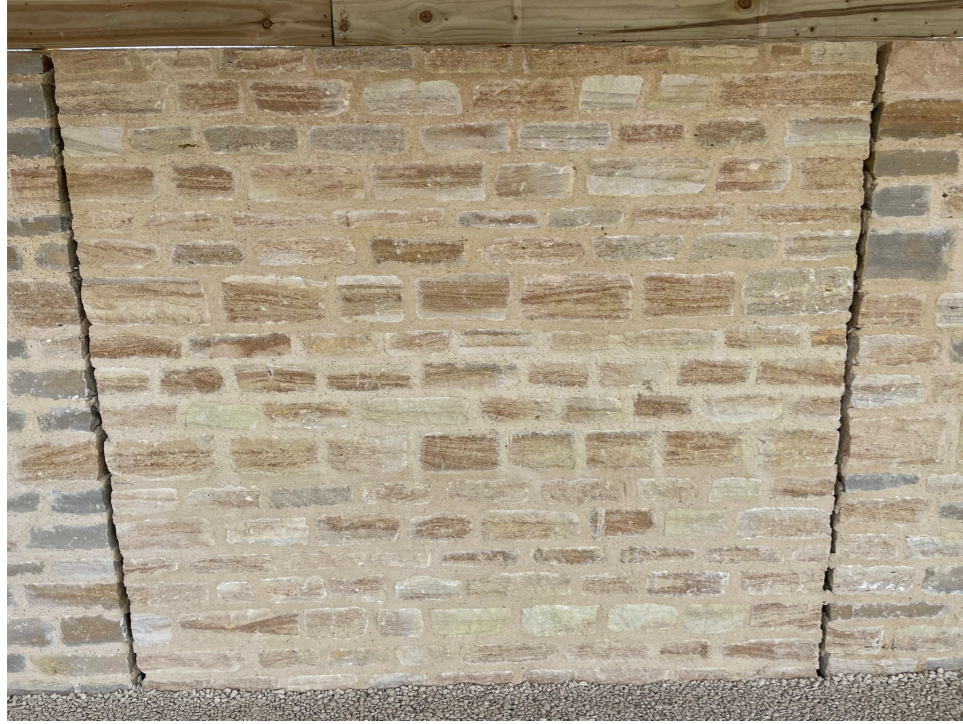
Fig. 1 - Grange Hill Cream sample panel at Cotswold Natural Stone quarry