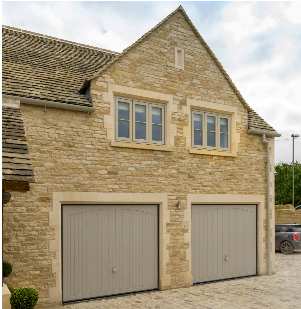
Fig. 3 - Precedent example of Grange Hill Cream