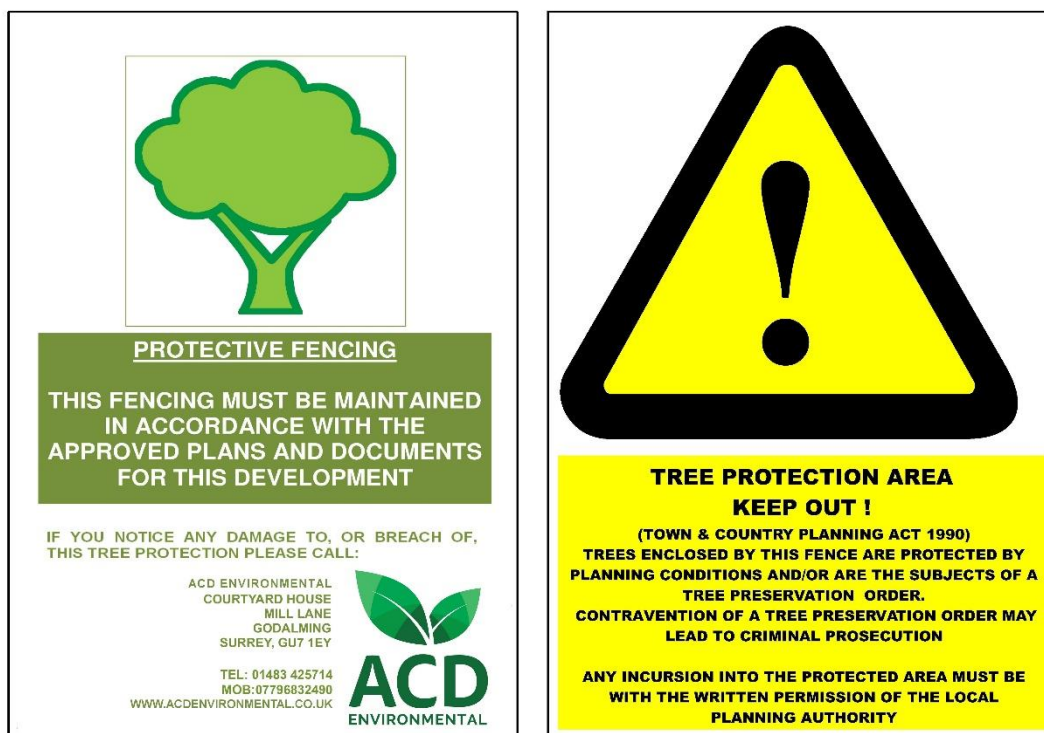
Tree protection sign (download from) http://www.acdenvironmental.co.uk

9.8. All weather notices should be erected on the barriers (for example see figure below).