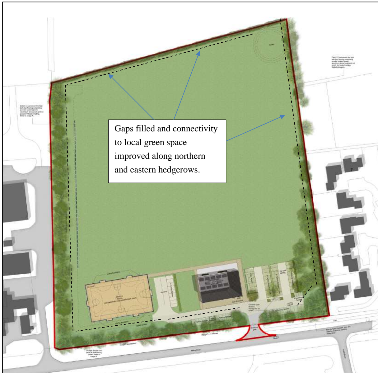
Figure 3. Wildlife/Habitat Protection Scheme showing indicative 1 m root protection zone for retained hedgerow and trees (black dashed line) and areas where additional hedgerow and tree planting will be undertaken (marked with labels). (A larger version is available in LAS 205 Landscape Management Plan)