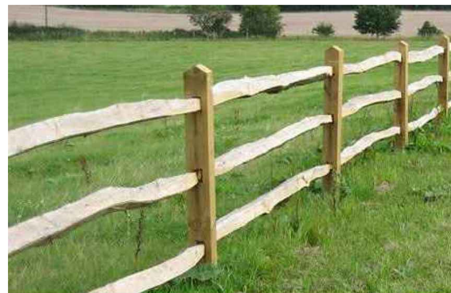
TYPICAL MORTICED TIMBER POST AND RAIL FENCE

----- DENOTES EXTENT OF PROPOSED 2.4M HIGH WELD MESH/PALADIN SECURITY FENCE