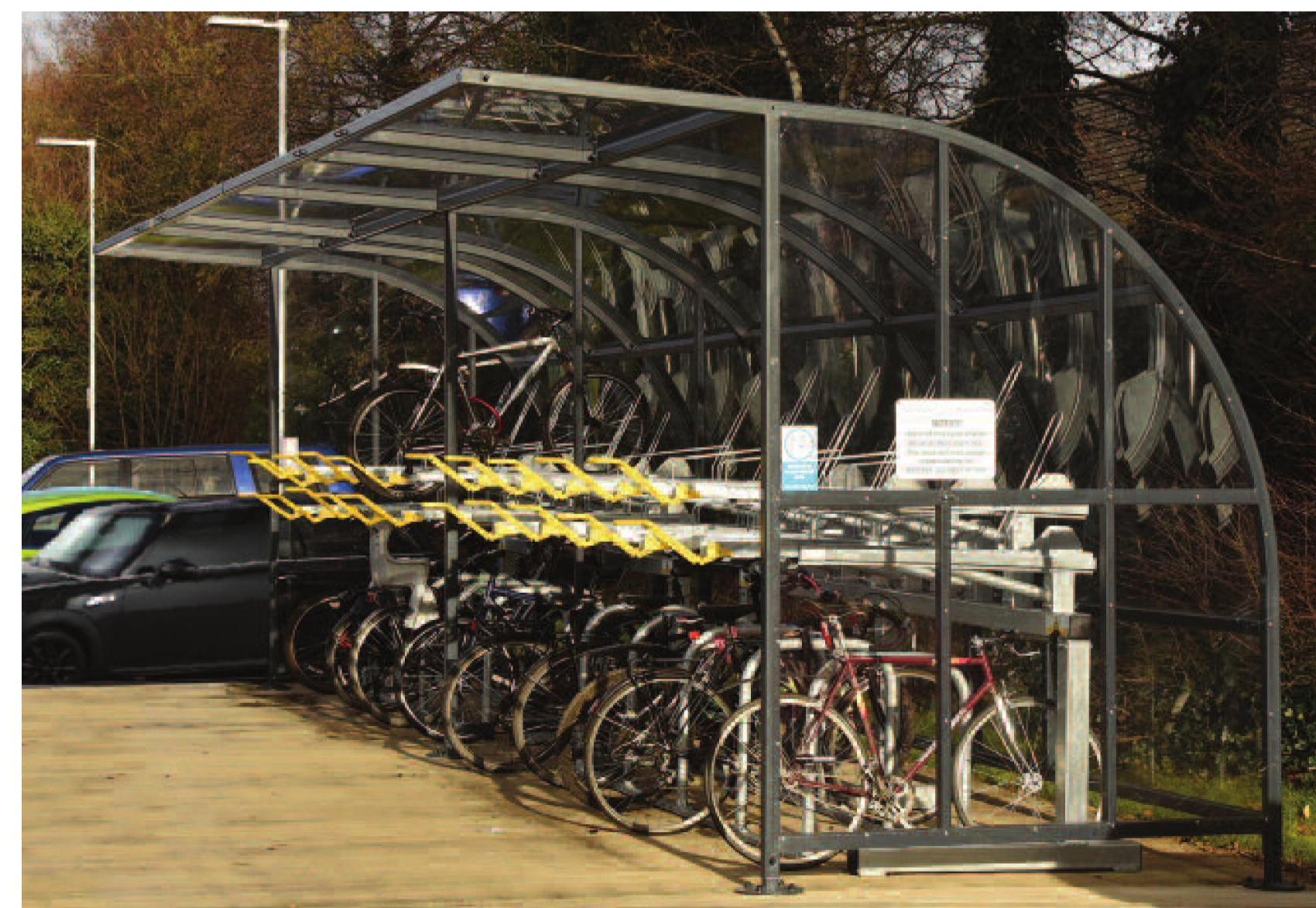
TYPICAL CYCLE SHELTER IMAGE