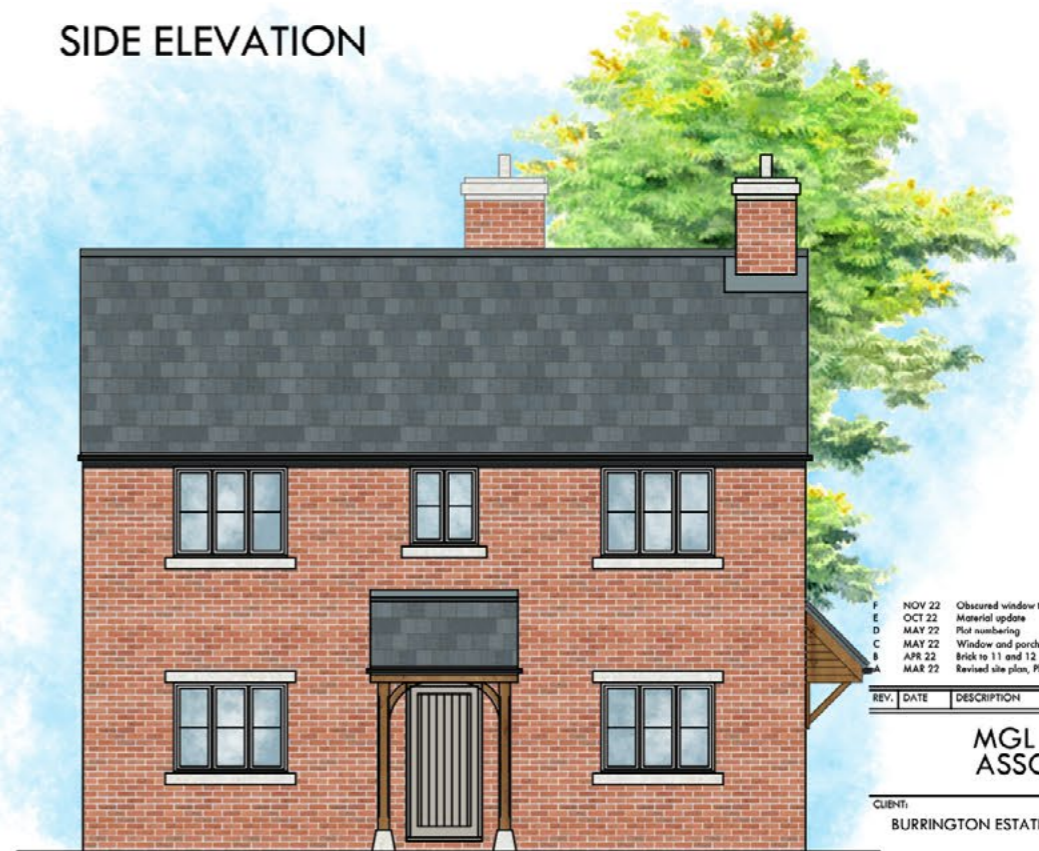
PLOT 31 SIDE ELEVATION