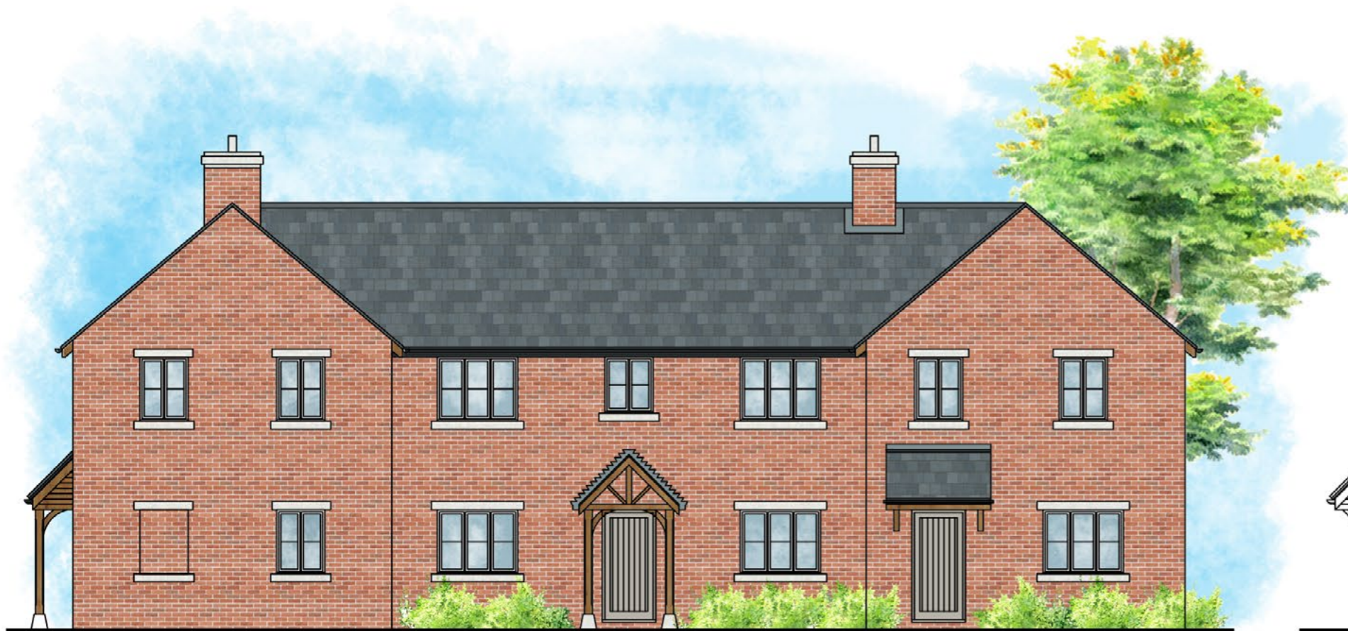
PLOT 31 FRONT ELEVATION