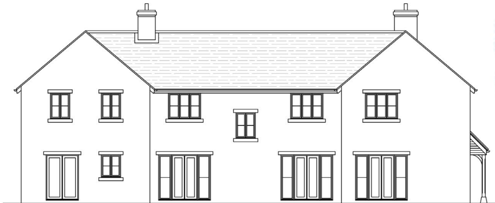
PLOT 33 REAR ELEVATION