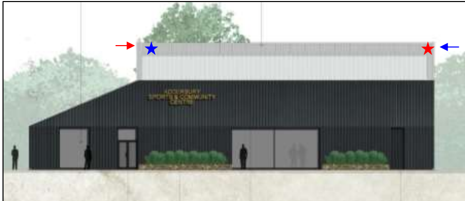
Figure 4b. Location of bat tubes and swift boxes on the south elevation of the proposed community centre building (blue stars=bat tubes, red stars=swift boxes, blue arrow=bat tube on adjacent corner, red arrow=swift box on adjacent corner)