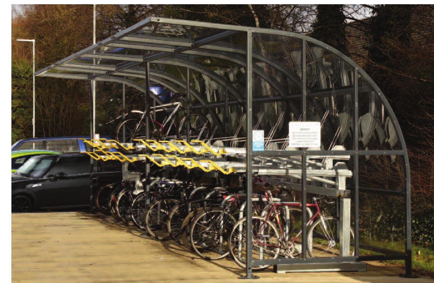
TYPICAL CYCLE SHELTER IMAGE