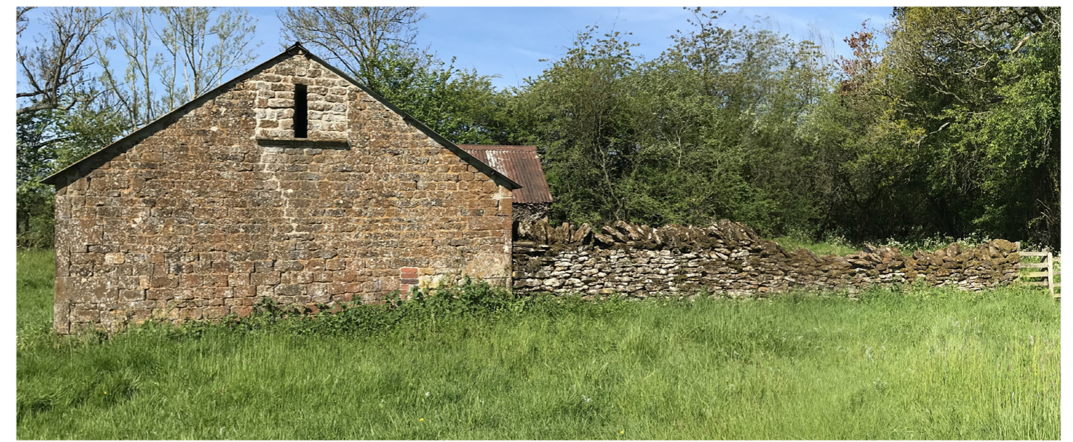
Existing barn with wall before it was dismantled.