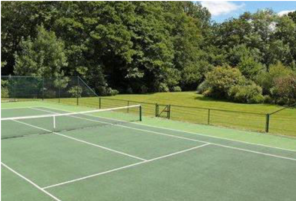
Two metre high open mesh fencing at each end reducing to 0.9 metres high along the sides.