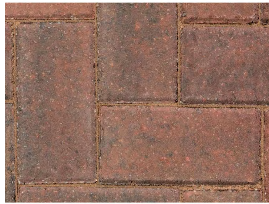
02 BLOCK PAVING TO PATHS 017 brindle