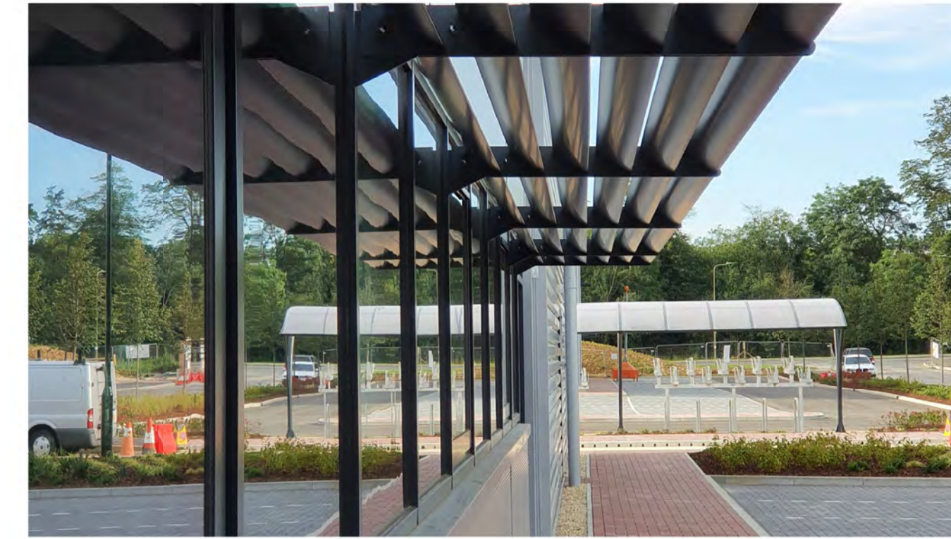
12 BRISE SOLIEL 017 RAL7016