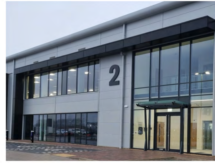
05 TRIMOTERM FACADE AND CURTIAN WALLING 017 building facade example