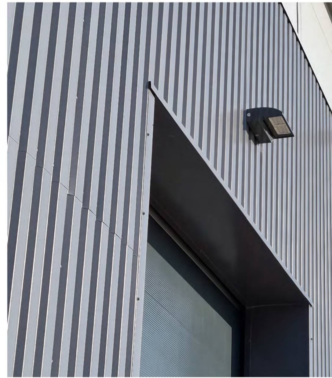
09 VERTICAL METAL CLADDING 017 ZEUS