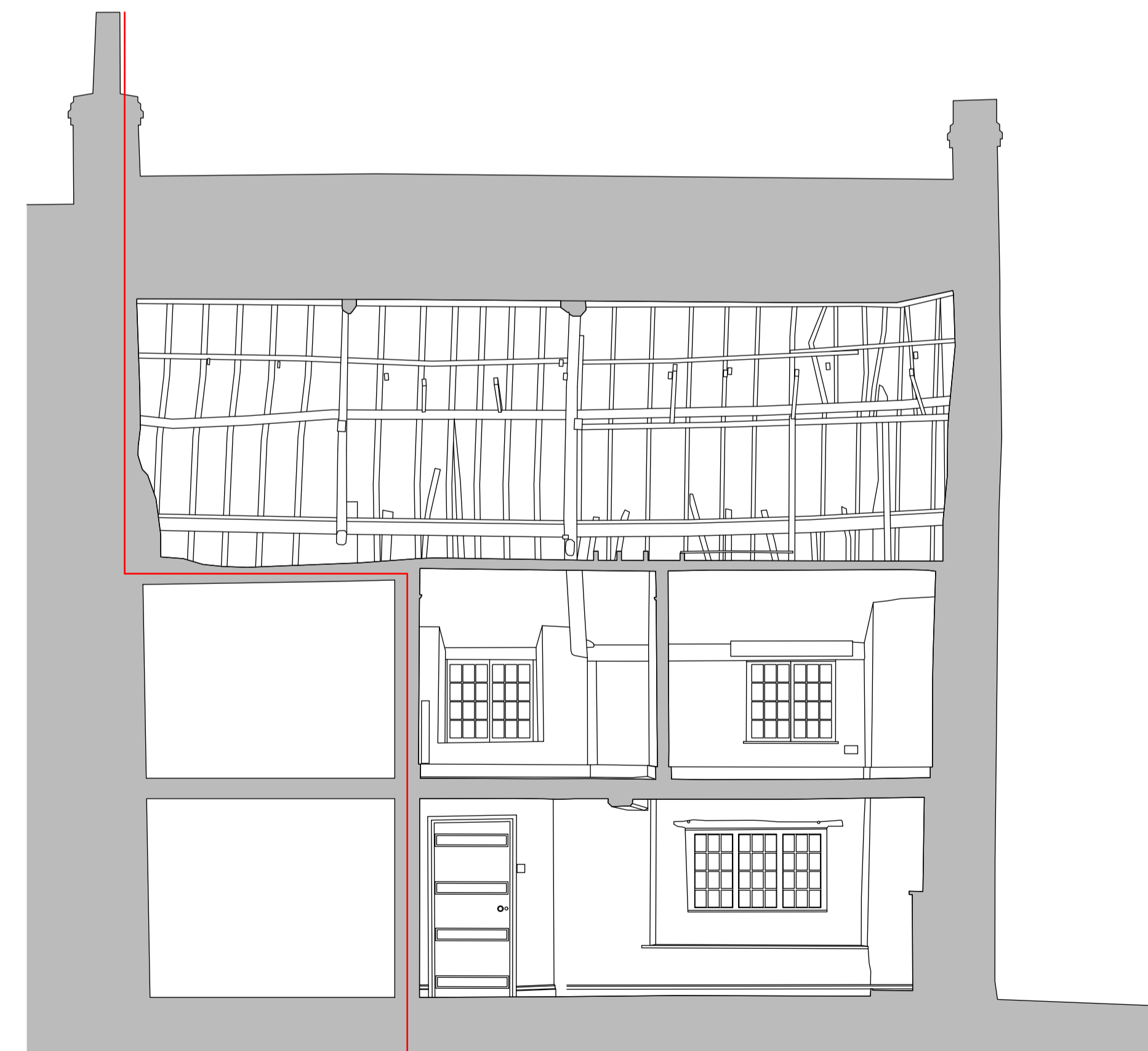
Existing Section B-B Scale 1:50