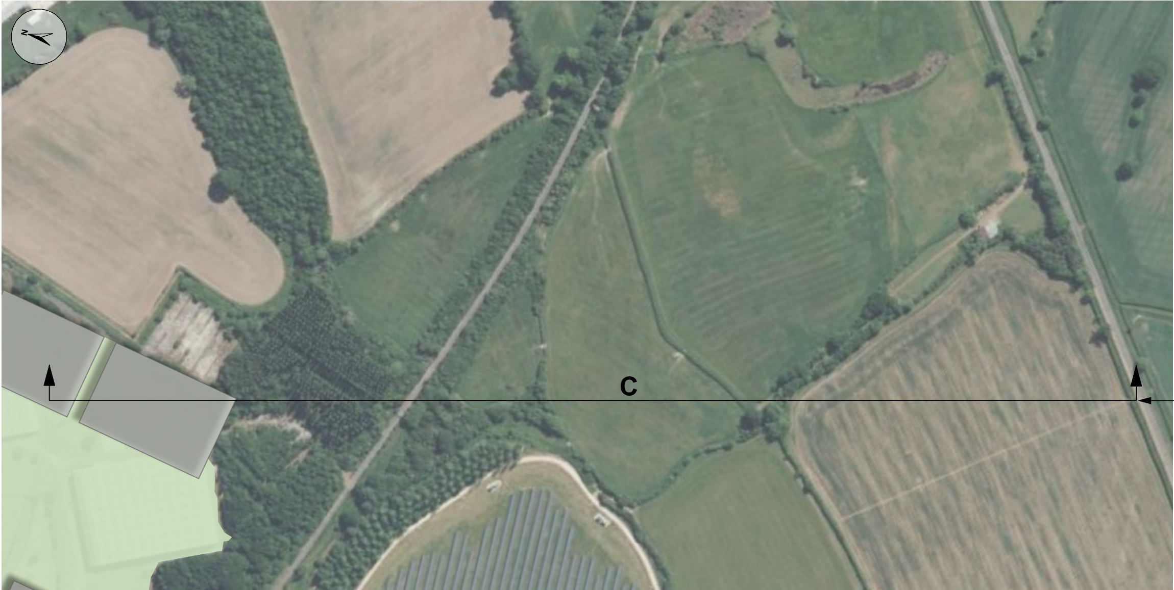
Section View 'C' Identification Plan