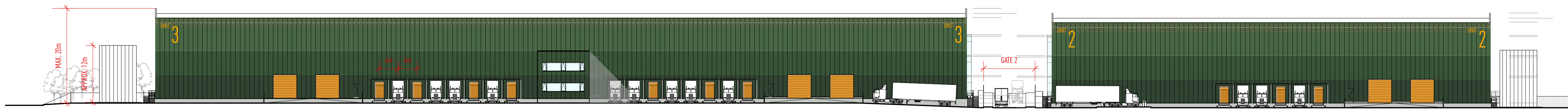
INDICATIVE PROPOSED SOUTH ELEVATION_ 1:500