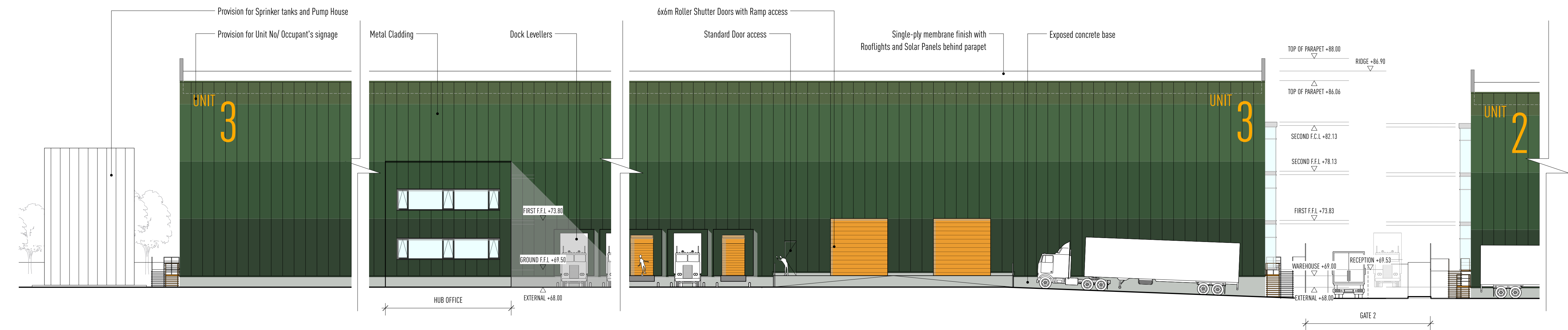
INDICATIVE PROPOSED UNIT3 SOUTH ELEVATION_ 1:200