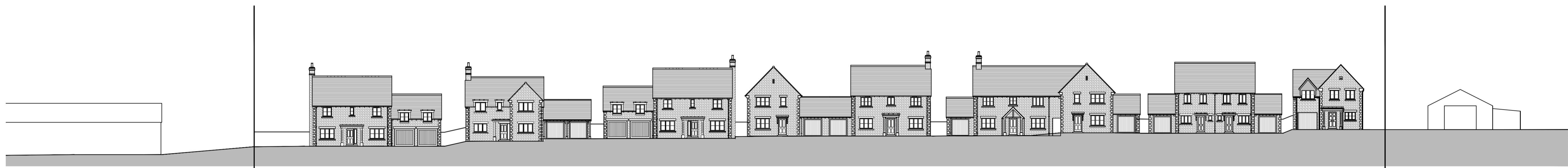
Street Scene from on site road