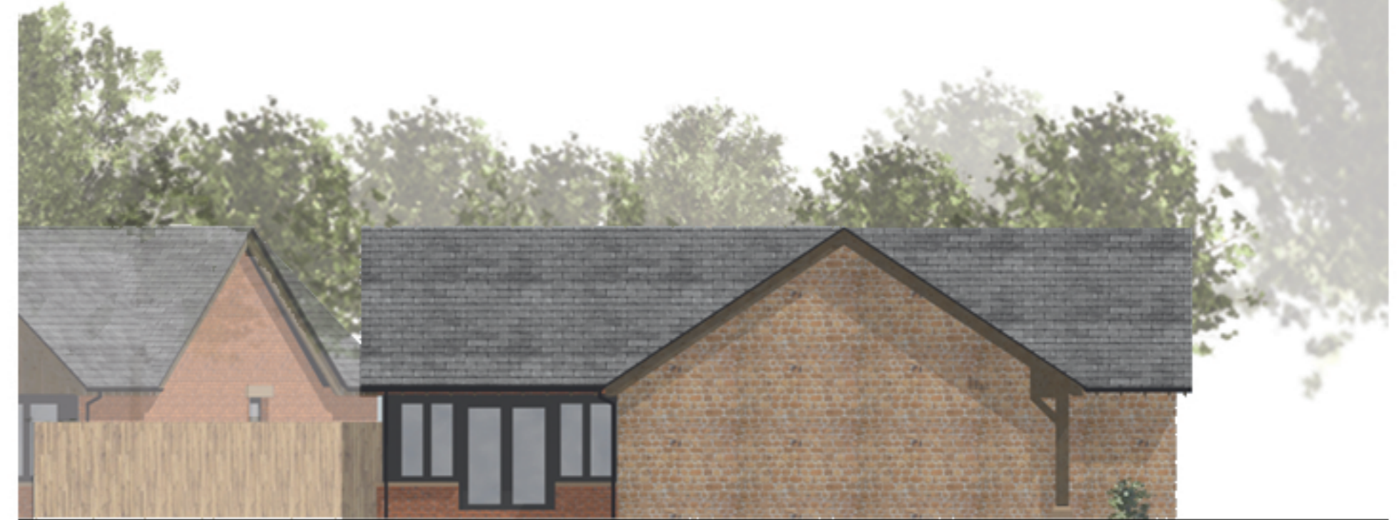
SIDE (SOUTH WEST)