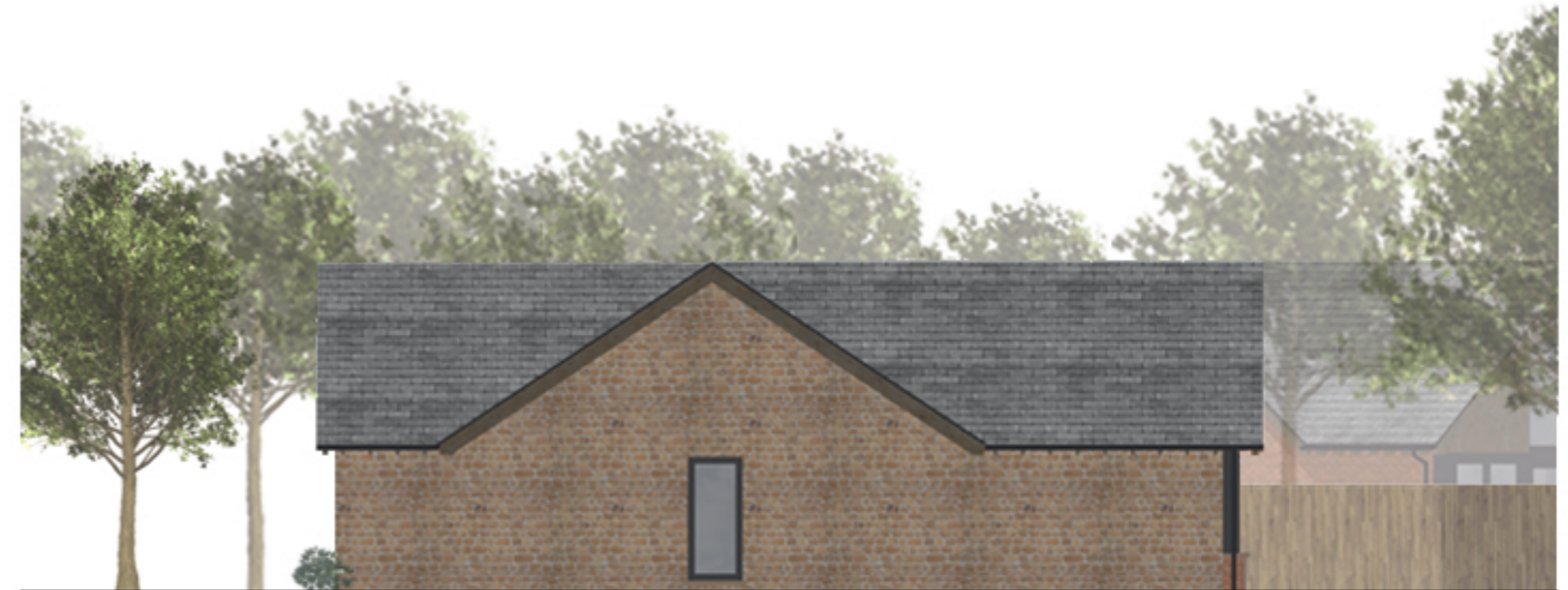
SIDE (NORTH EAST)

D_2022.02.14_BB_Elevations and site layout updated. C_2021.11.30_BG_Paper size changed to add context. B_2021.11.25_BG_Edges removed, shadows added & fade increased. A_2021.11.24_BG_Roof texture changed.