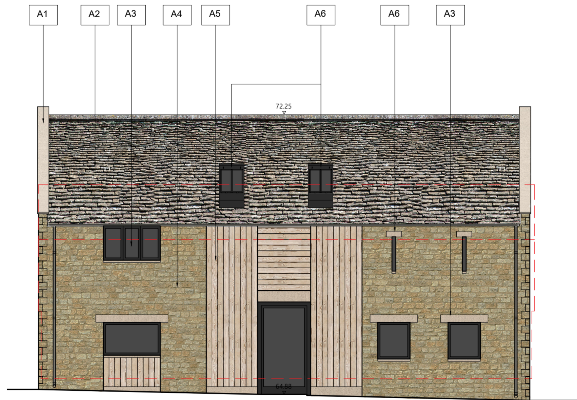
1.0 South Elevation