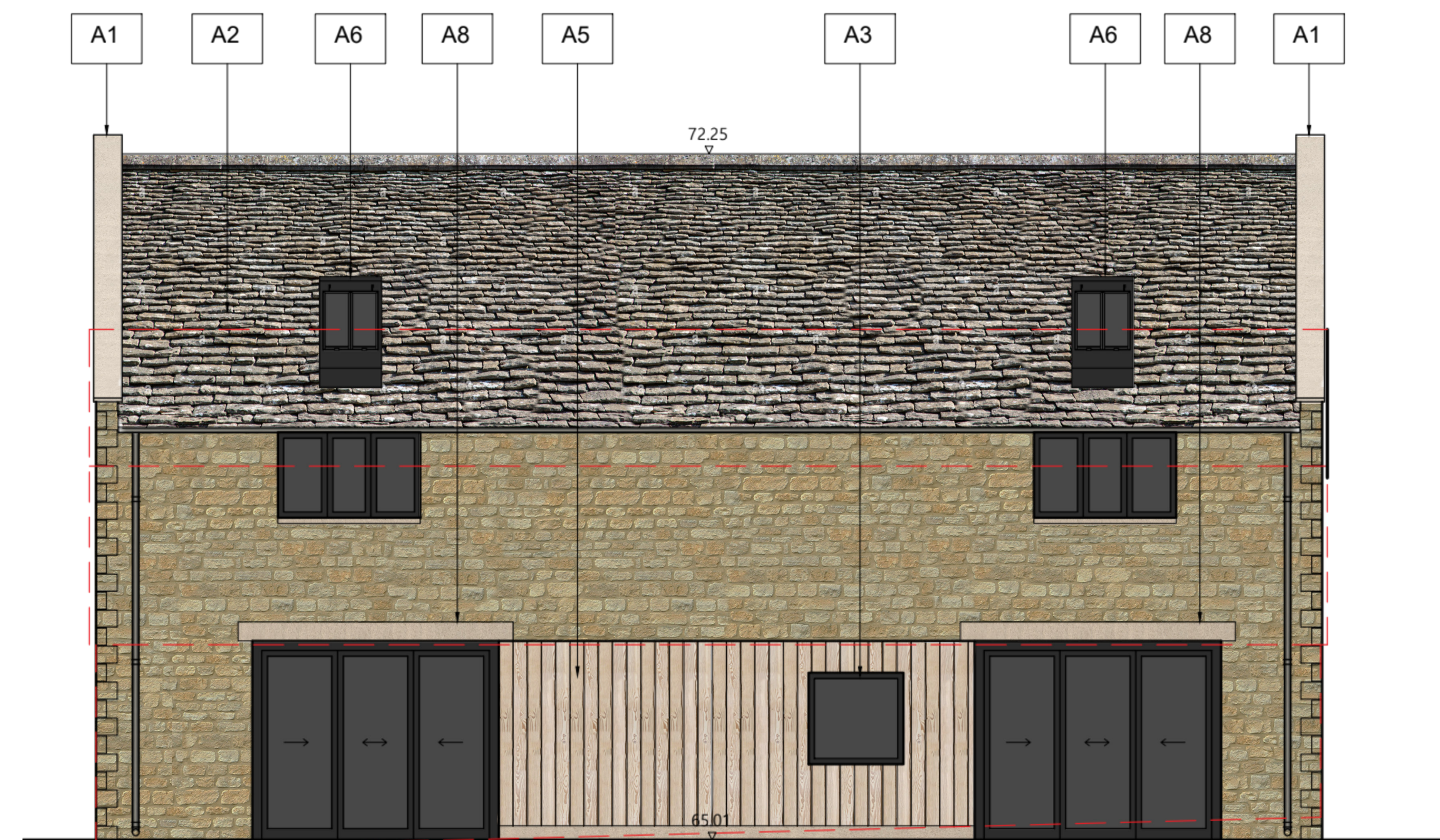
2.0 North Elevation