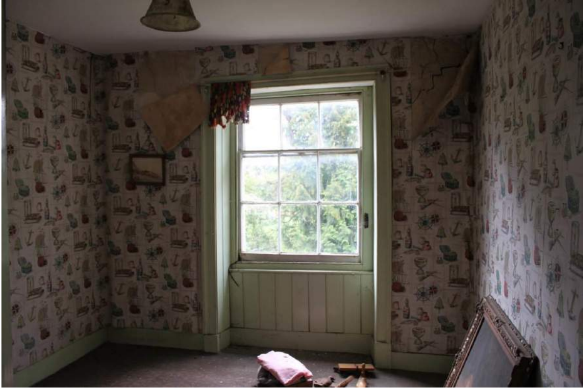
Plate 52: F4, looking south