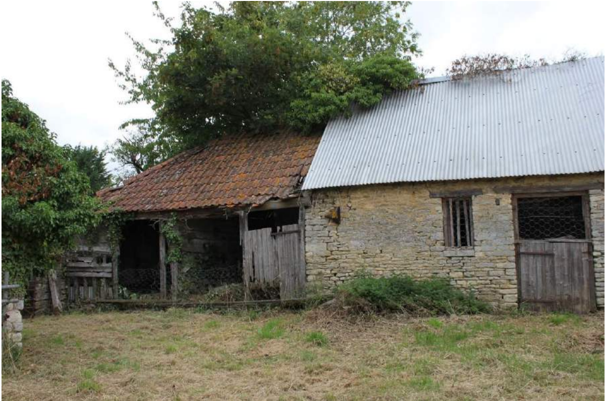
Plate 77: Outbuildings B1 (left) and B (right)