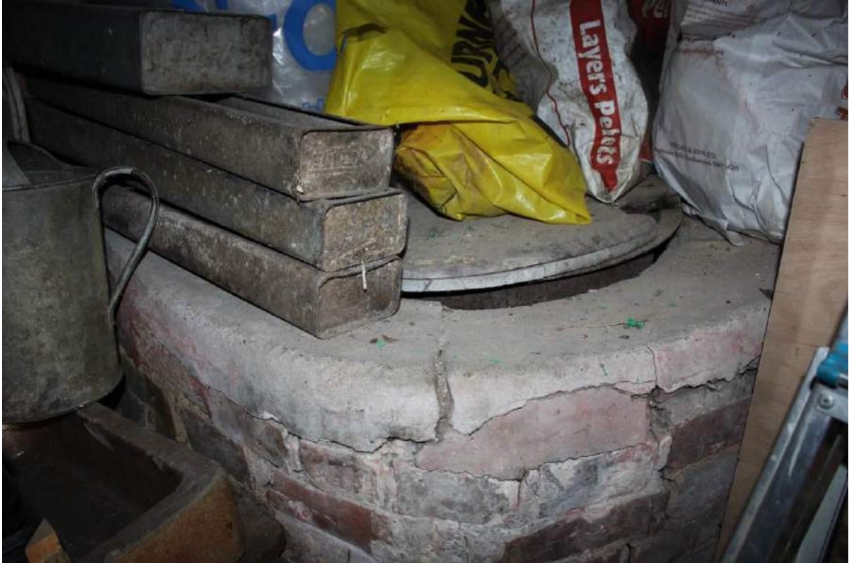
Plate 38: Detail of copper in north-west corner of G8, with vessel and lid apparent