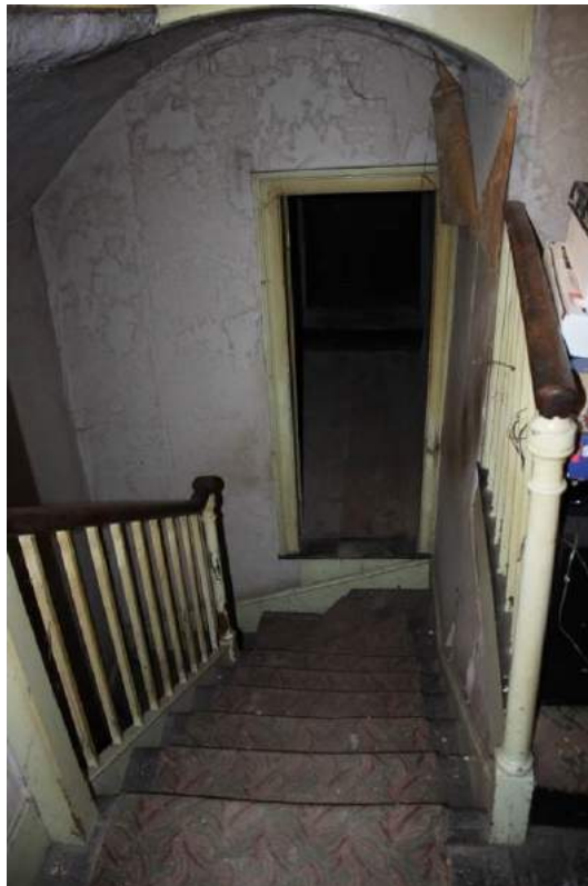
Plate 61: Looking east down upper flight of stairs towards doorway into Block 2 off staircase