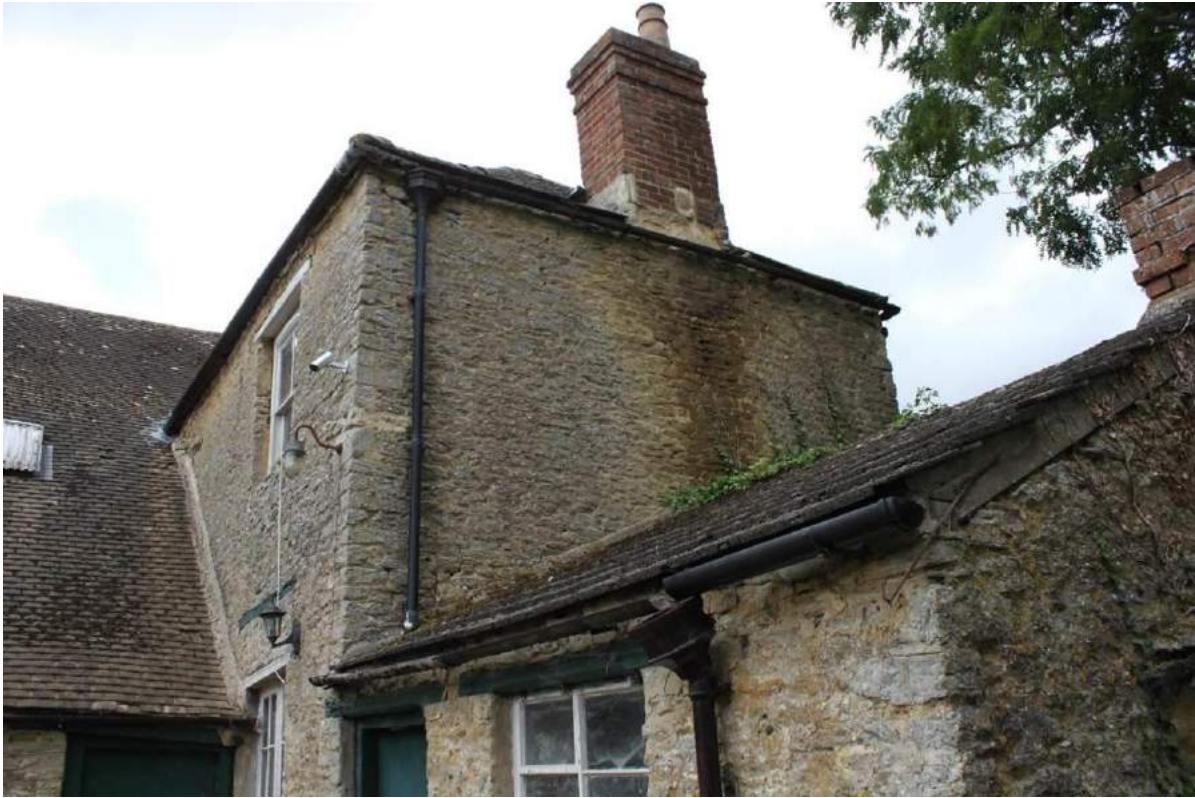
Plate 7: Rear (north) elevation of rear wing of Block 1, with single-storey Block 3 attached to right, and outshut seen to left