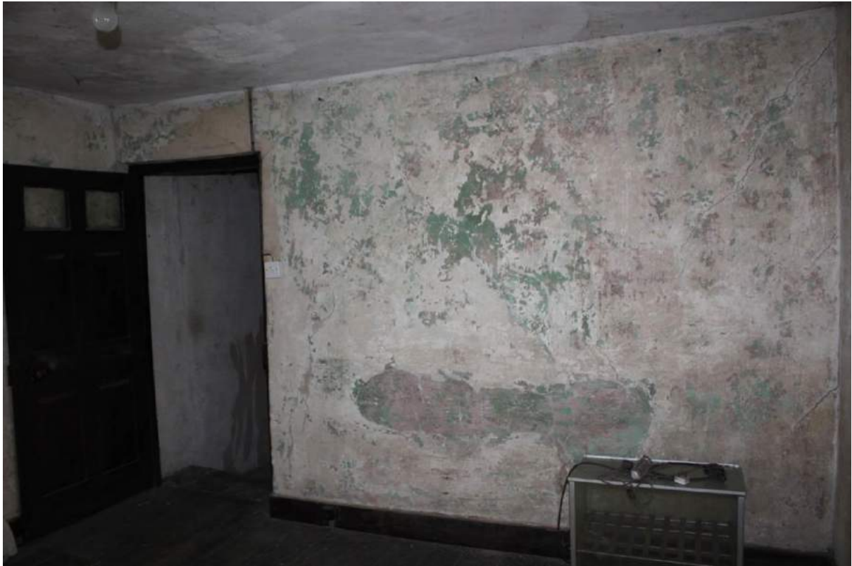
Plate 64: F7, looking west