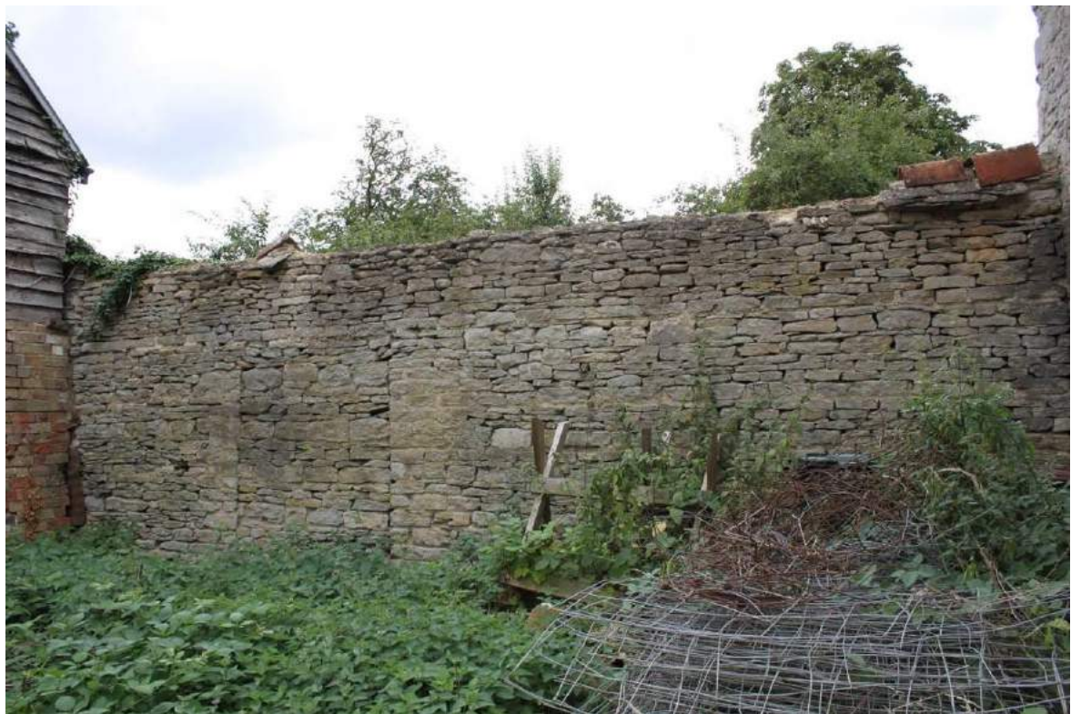
Plate 93: North face of southern boundary wall extending between Block 2 of the farmhouse and Outbuilding A; note blocked door opening