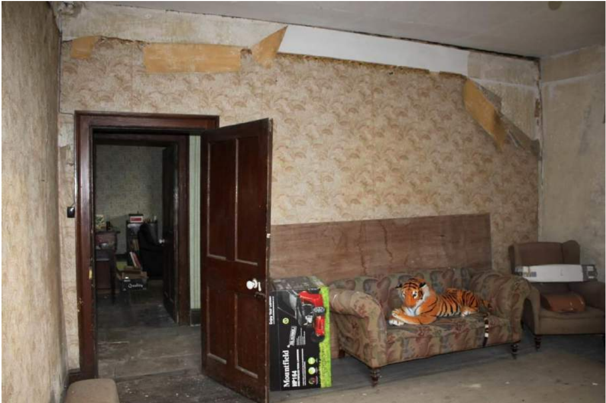
Plate 26: G3, looking east