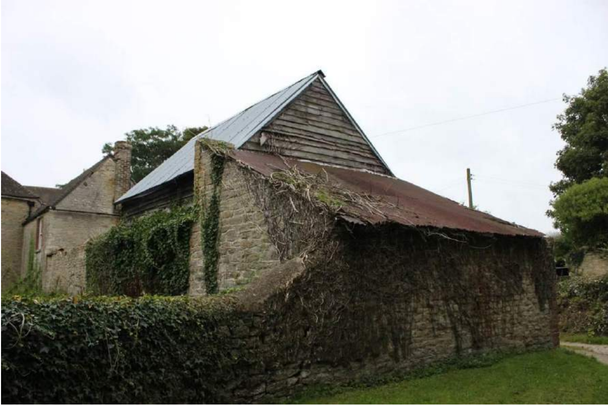
Plate 72: Outbuilding A1, east elevation