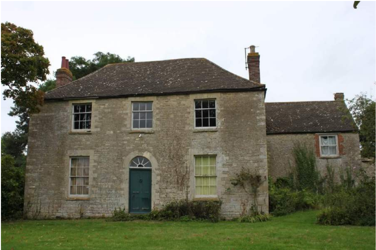
Plate 1: Stratfield Farmhouse: front (south) elevation of Block 1