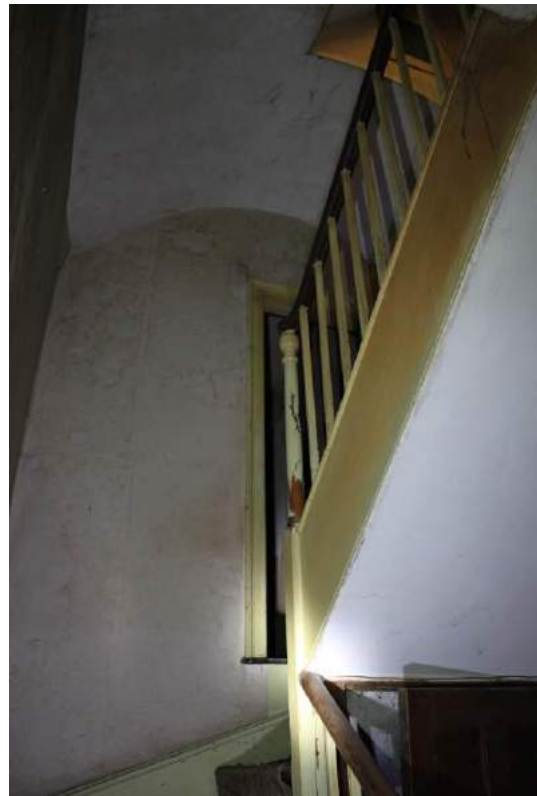
Plate 21: Staircase