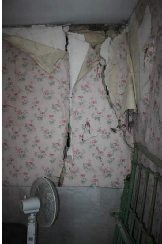
Plate 60: Detail of cracks in masonry of south wall of F2