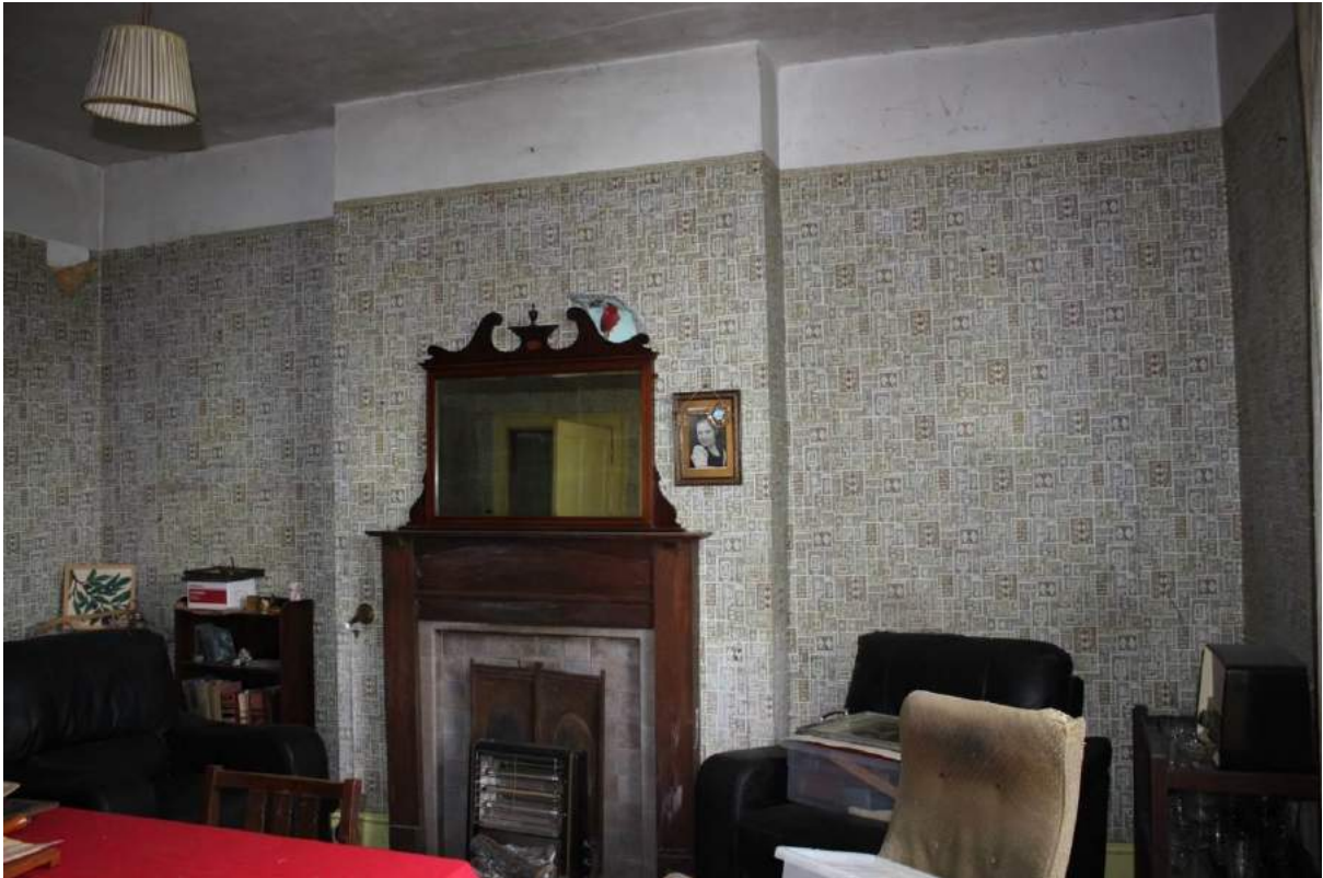
Plate 25: G2, looking east