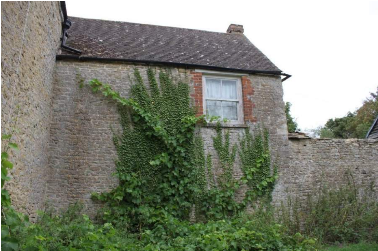
Plate 19: South elevation of Block 2