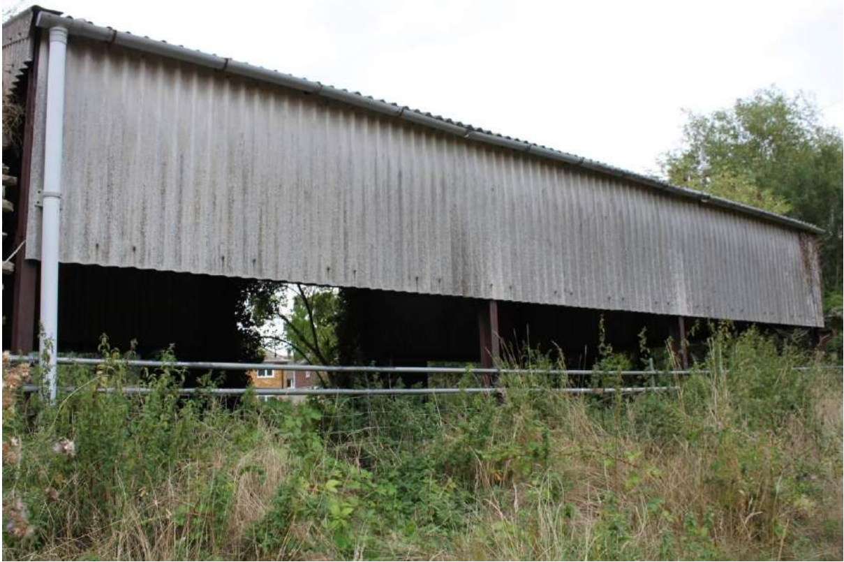
Plate 80: Outbuilding C