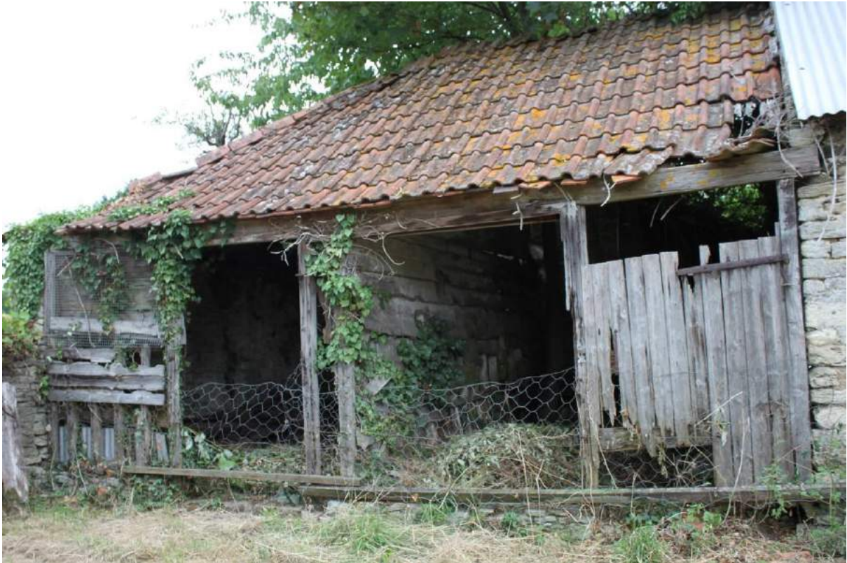
Plate 78: Outbuilding B1, south elevation