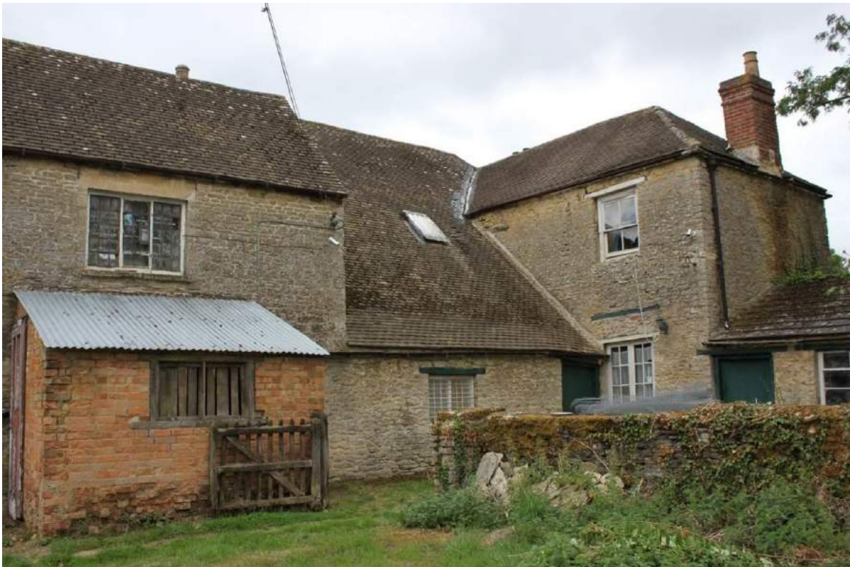
Plate 12: Rear (north) elevation of farmhouse, with Blocks 2 & 4 to left; outshut to Block 1 in centre; rear wing; and Block 3 to right