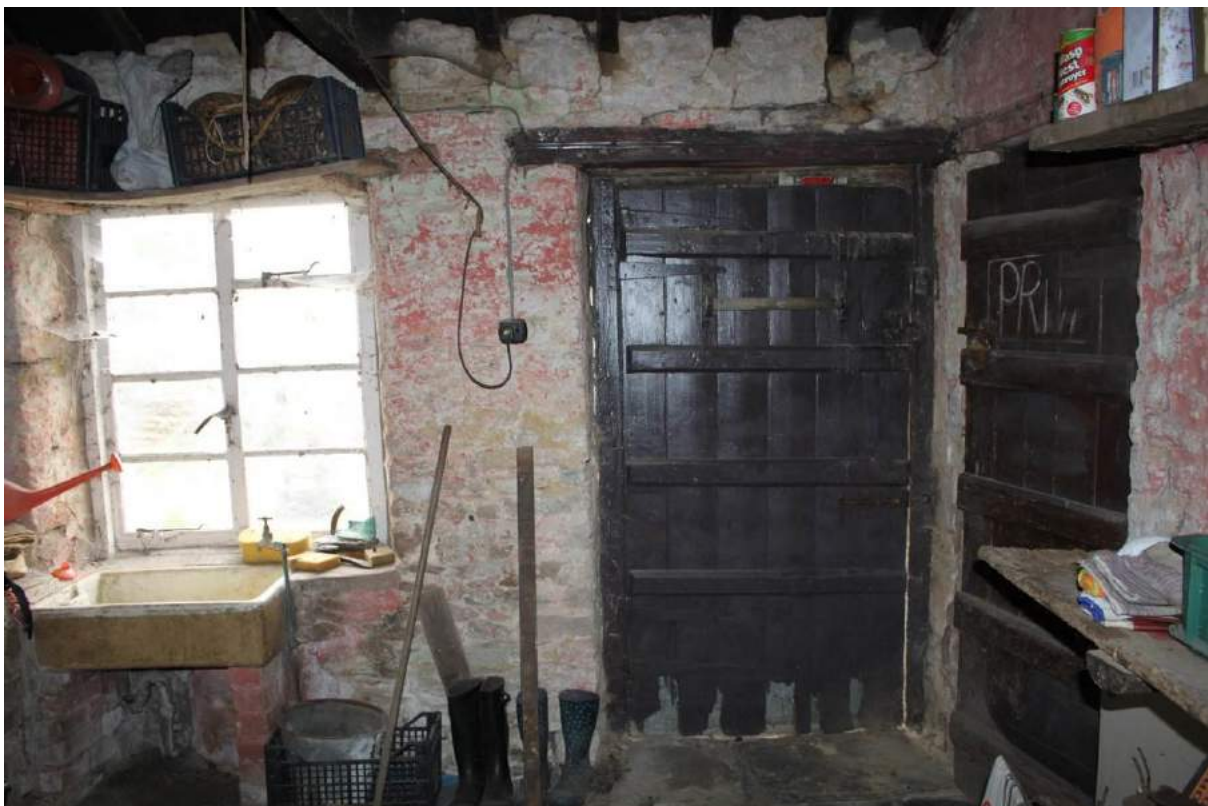
Plate 33: G8, looking east