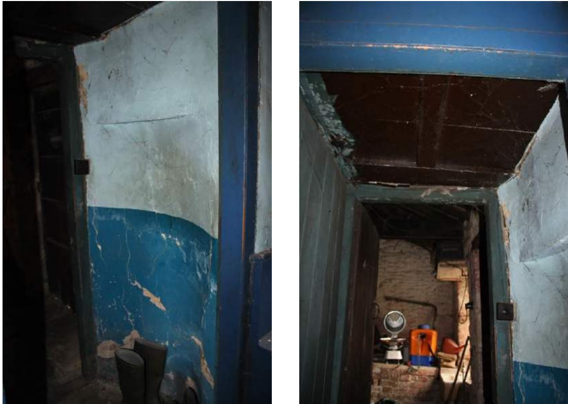
Plate 32: Looking north through opening into G8 in Block 3