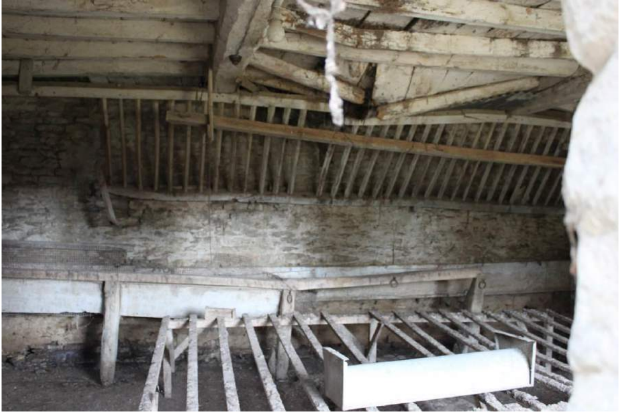
Plate 76: Interior of Outbuilding B, with troughs and mangers against north wall