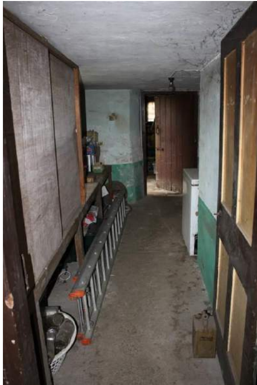
Plate 39: Looking east into G5