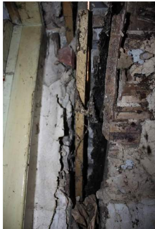
Plate 47: Vertical crack between rear wing (left) and outshut (right)