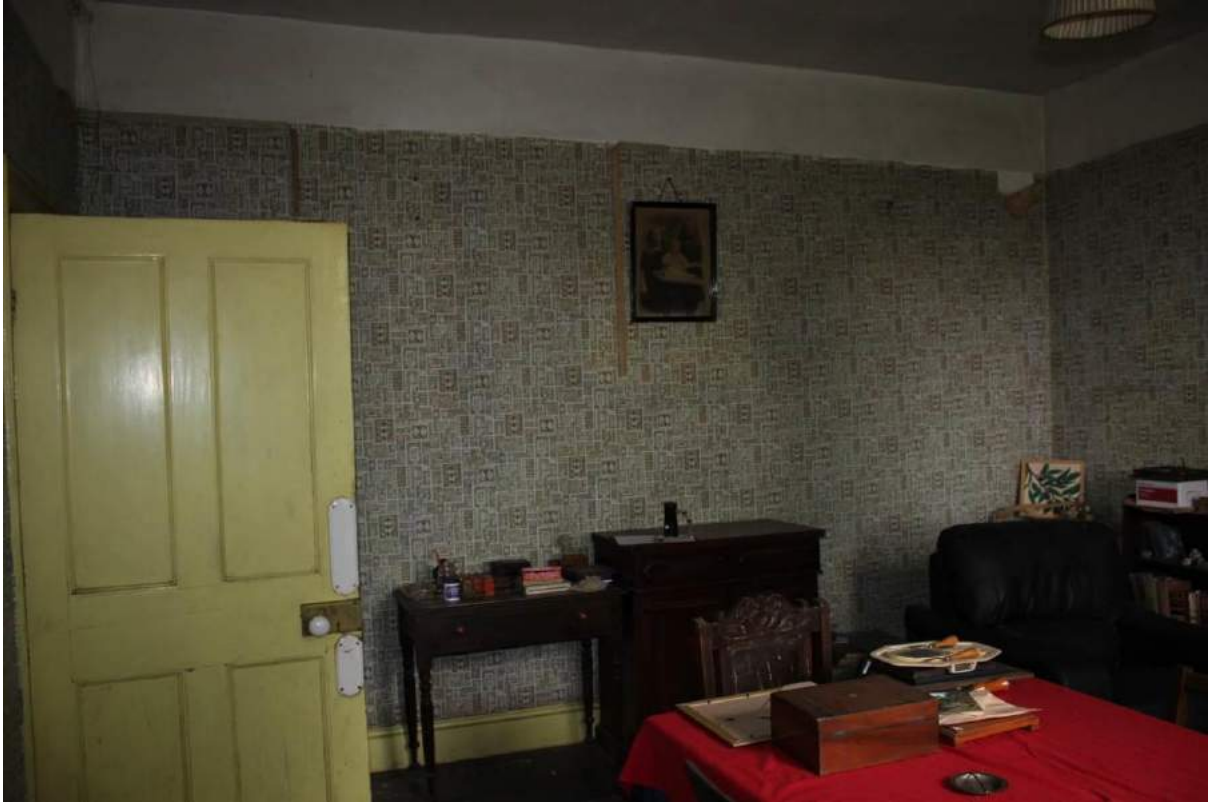
Plate 24: G2, looking north