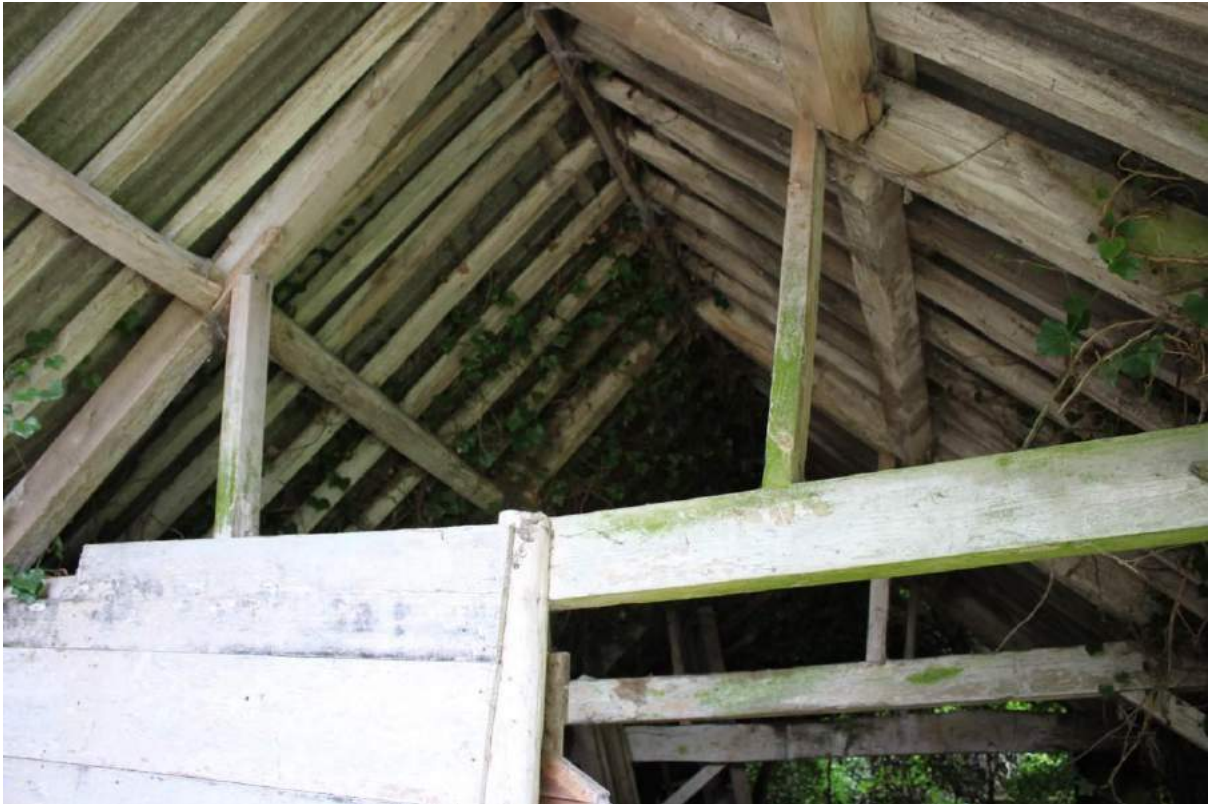
Plate 90: Detail of roof structure of Outbuilding F