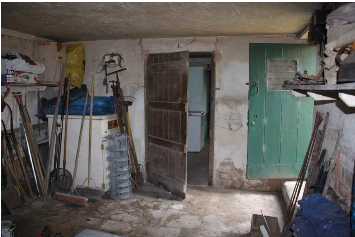
Plate 41: G6, looking south; note vented panel in external door to right and shelves to walls