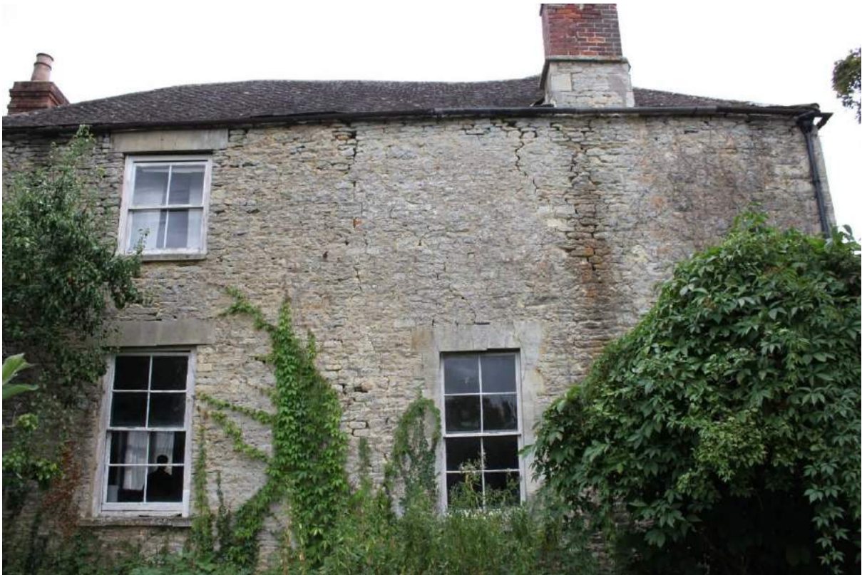
Plate 5: West return elevation