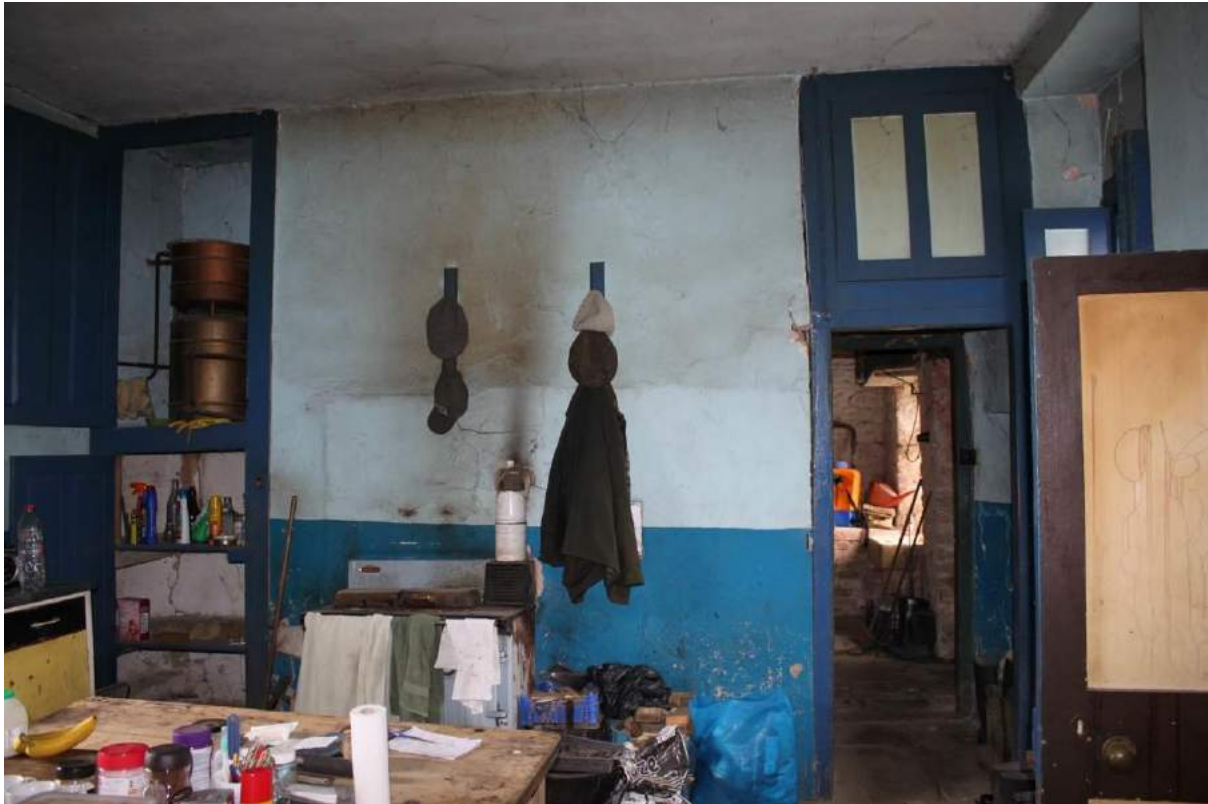
Plate 30: G7, looking north, with access into Block 3 (laundry/bake-house) beyond