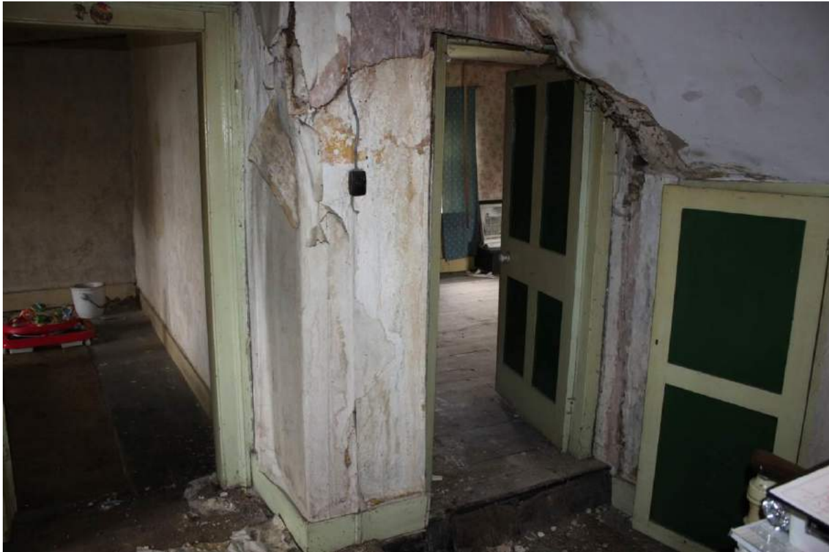
Plate 46: F1, looking west towards F3 and F2; note line of outshut roof with vertical crack beneath, left of the cupboard door