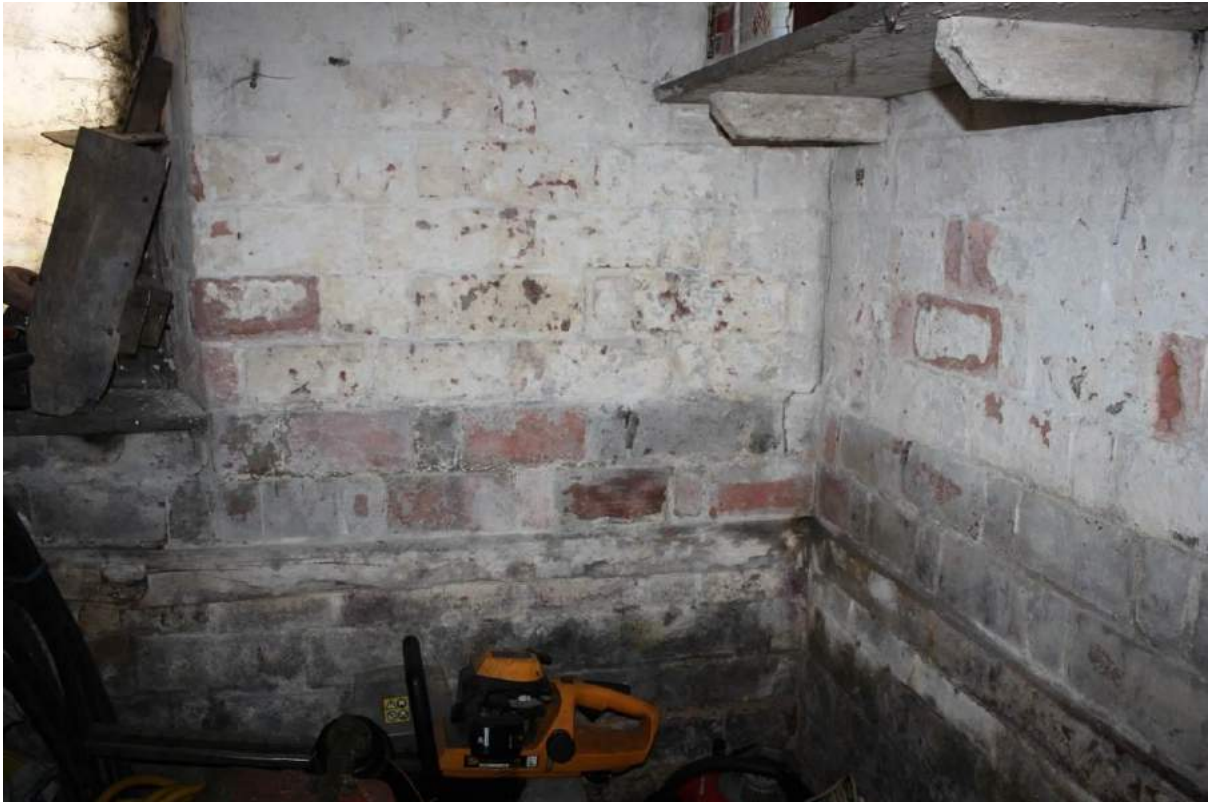
Plate 43: Detail of Rat Trap Bond brickwork in G6