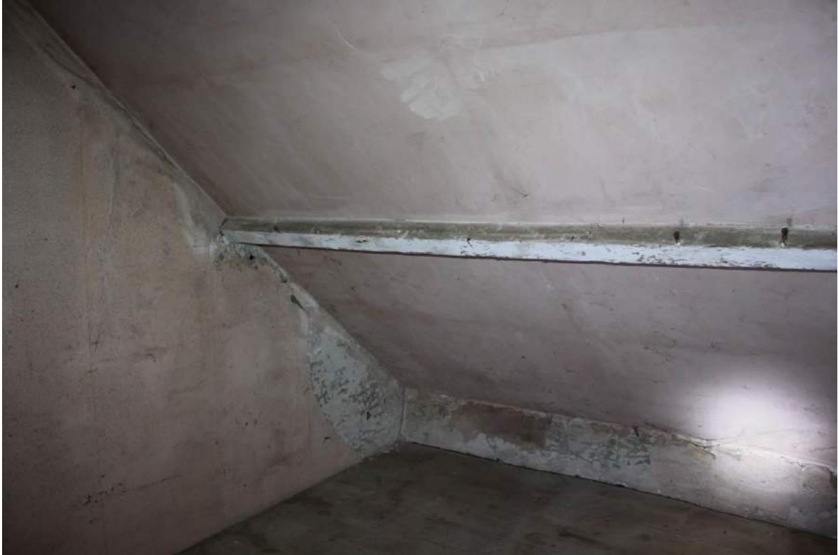
Plate 62: F6, looking north beneath catslide roof of outshut