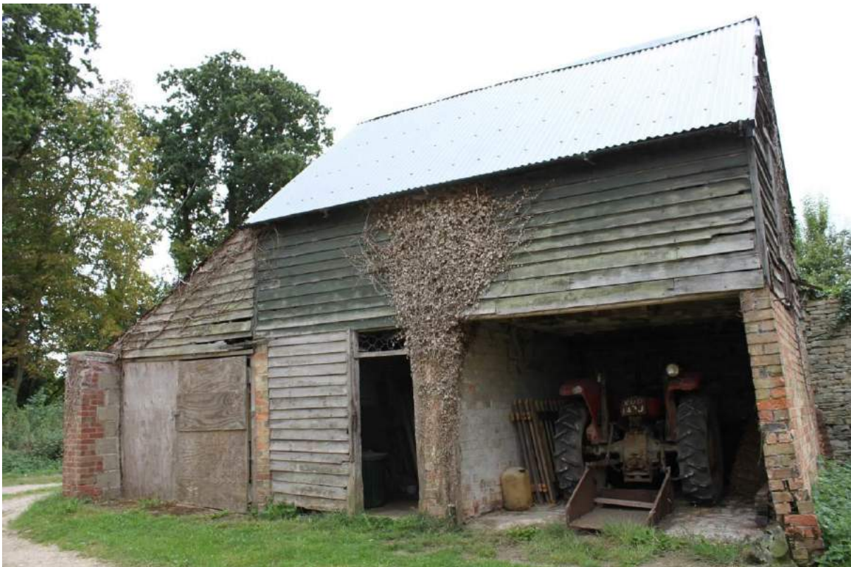
Plate 69: Outbuilding A: north elevation, with A1 to left