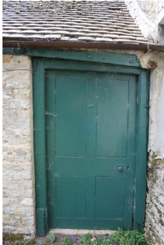
Plate 14: Rear entrance to Block 1 in outshut