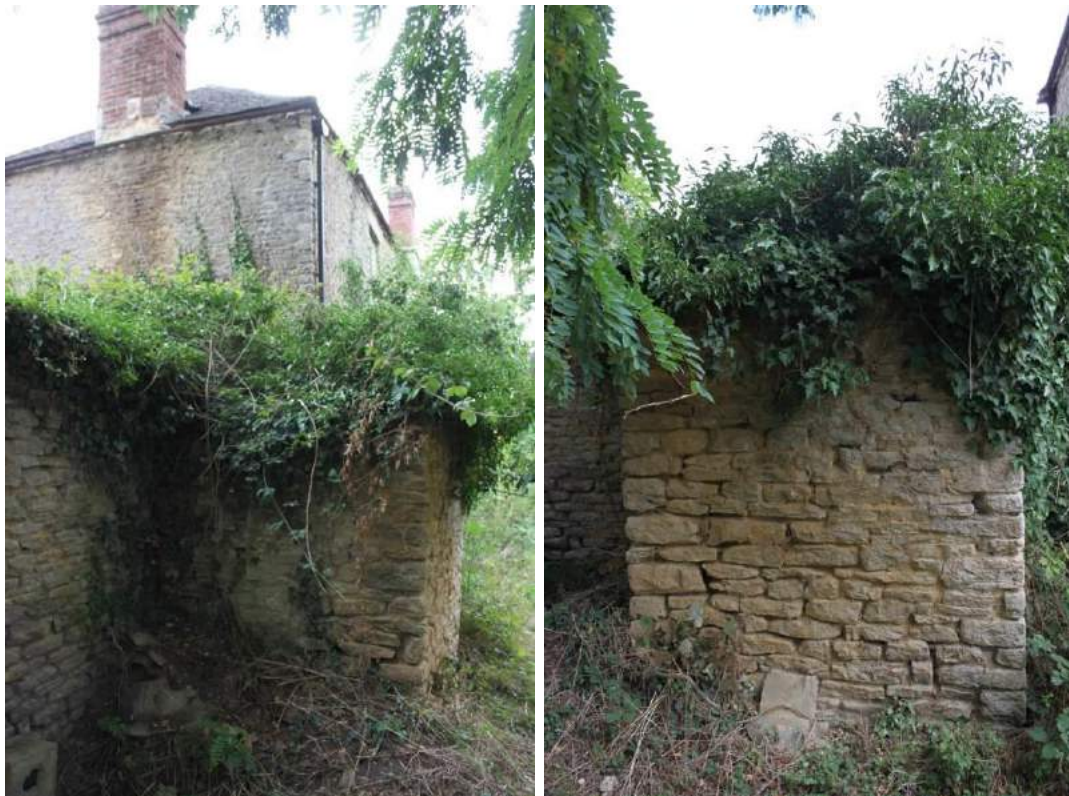
Plate 10: Bread oven structure