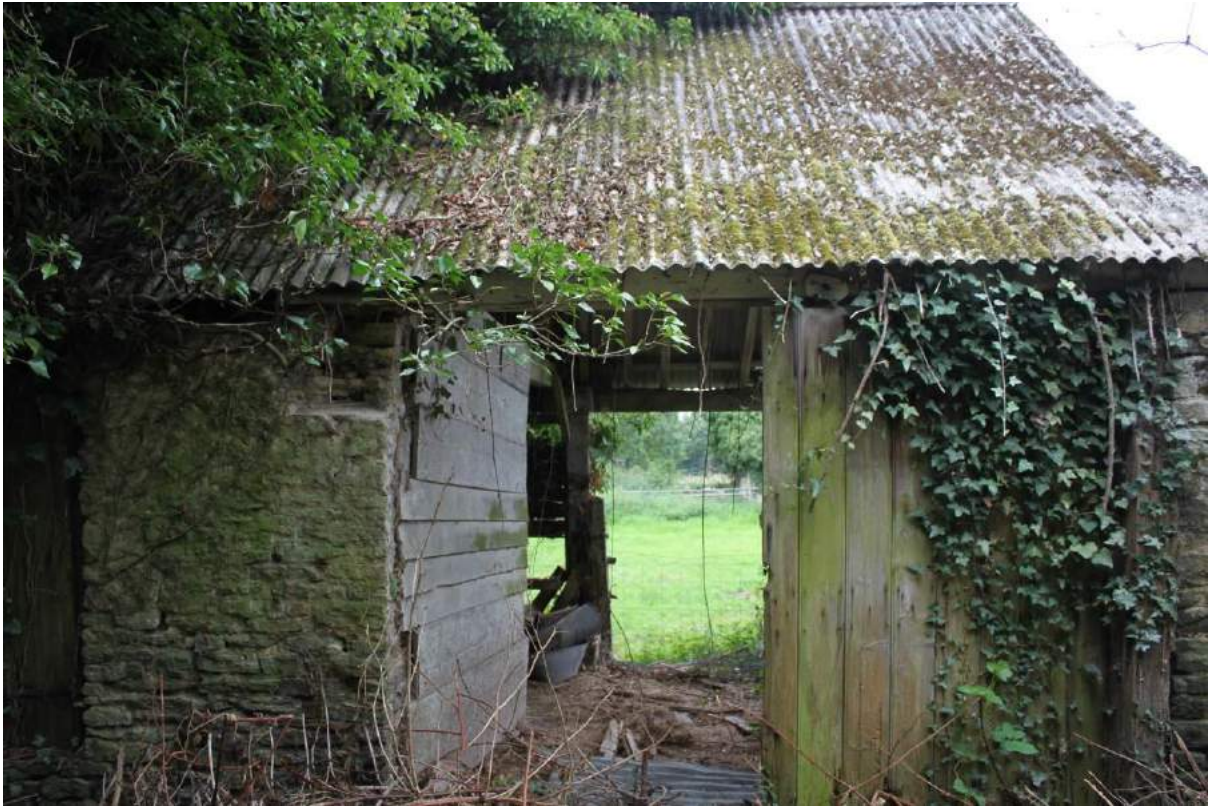
Plate 88: Outbuilding F, east elevation at northern end, looking west