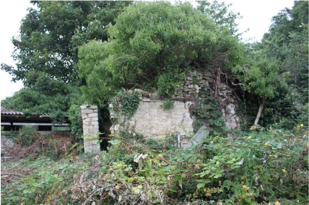
Plate 89: Southern end of Outbuilding F