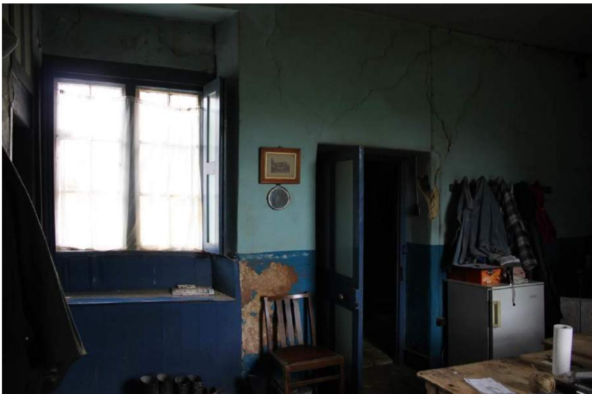
Plate 29: G7 (kitchen), looking east