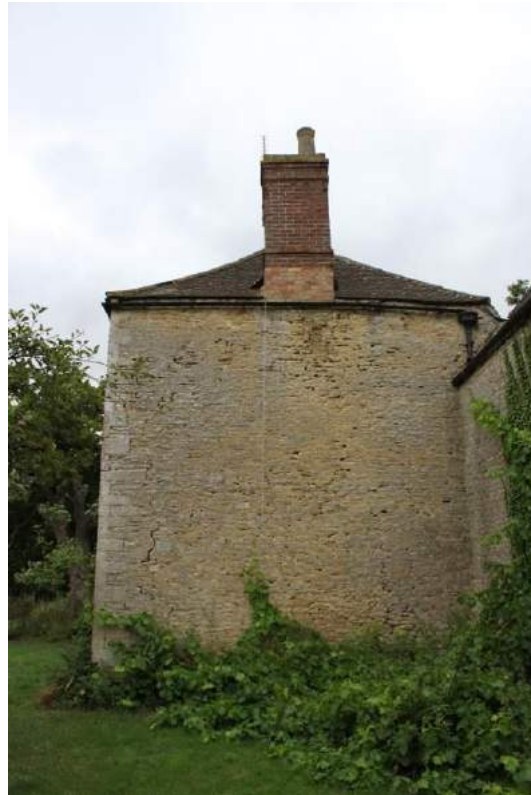
Plate 3: East return elevation