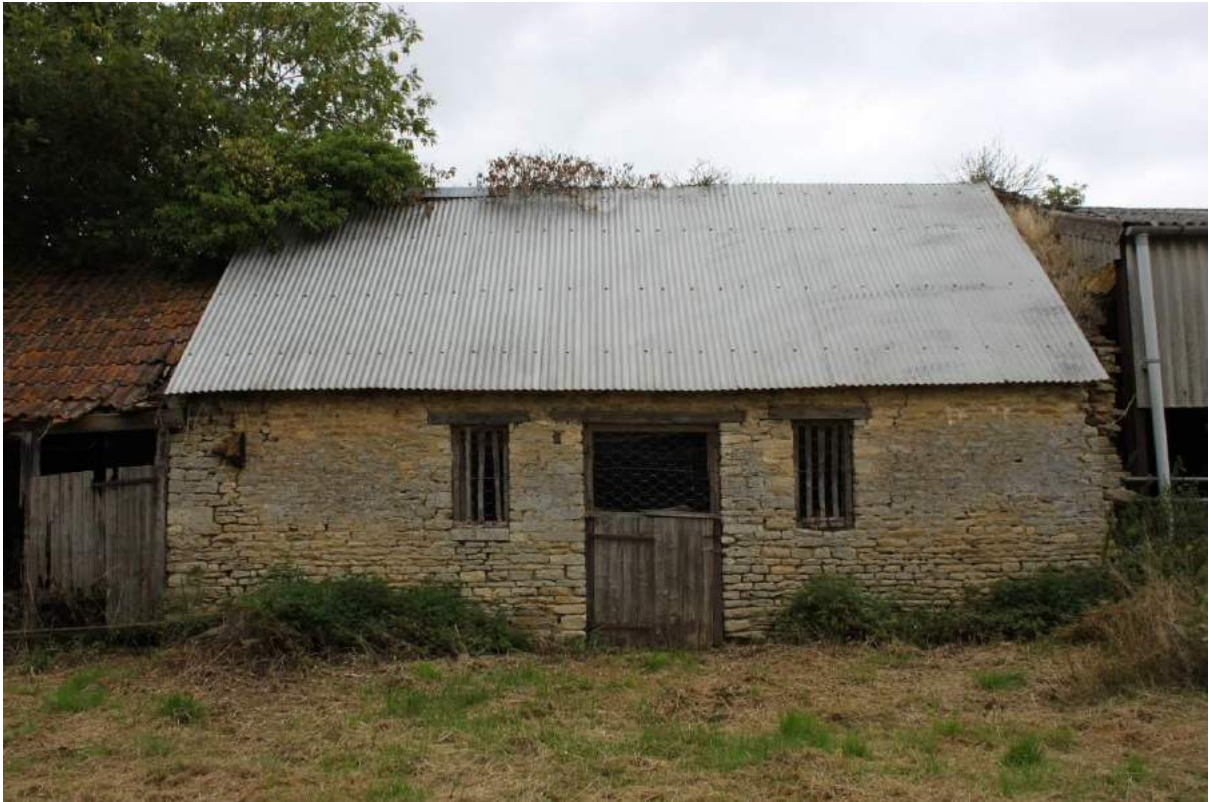
Plate 75: Outbuilding B, south elevation