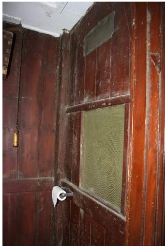
Plate 67: WC with wooden cistern in F7 (left) and partition between WC and bathroom (right)