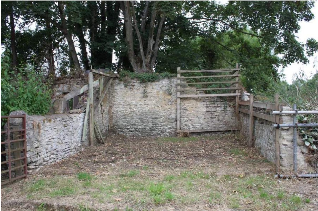
Plate 83: Outbuilding E (central section)