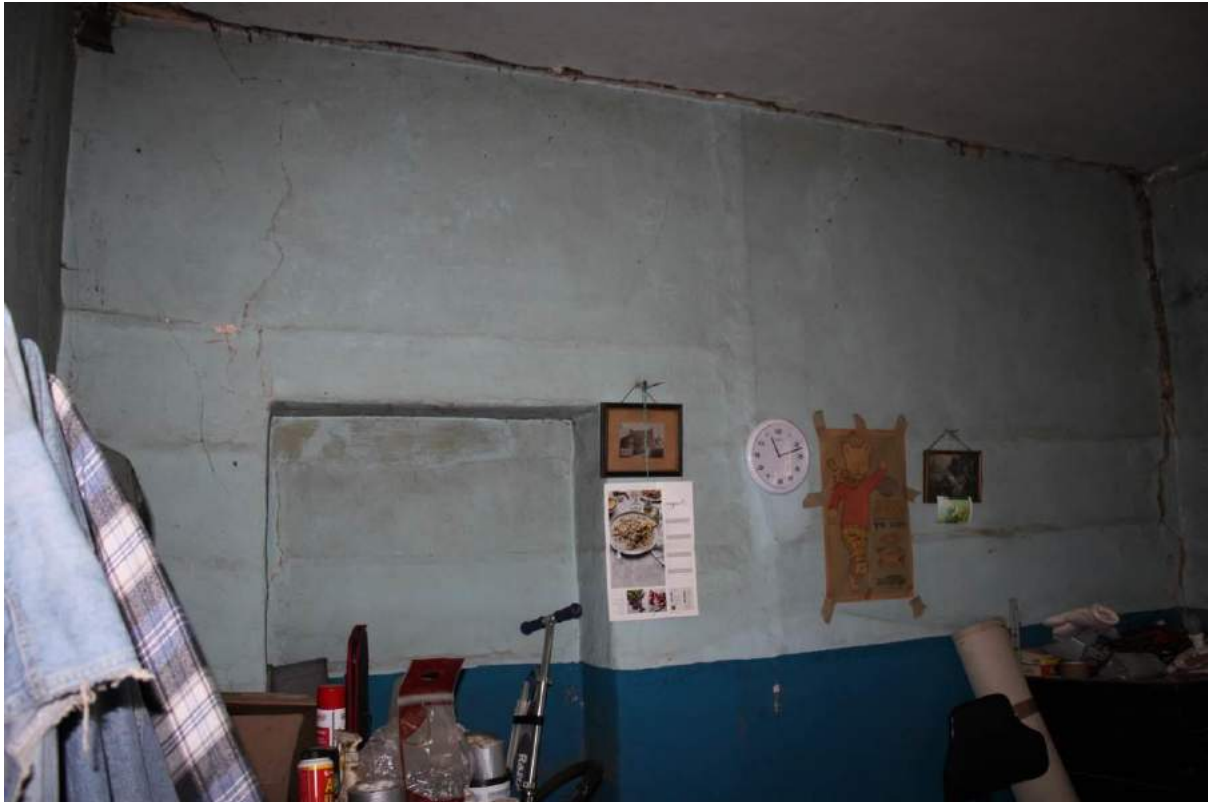
Plate 31: G7, looking south, with blocked doorway into G3