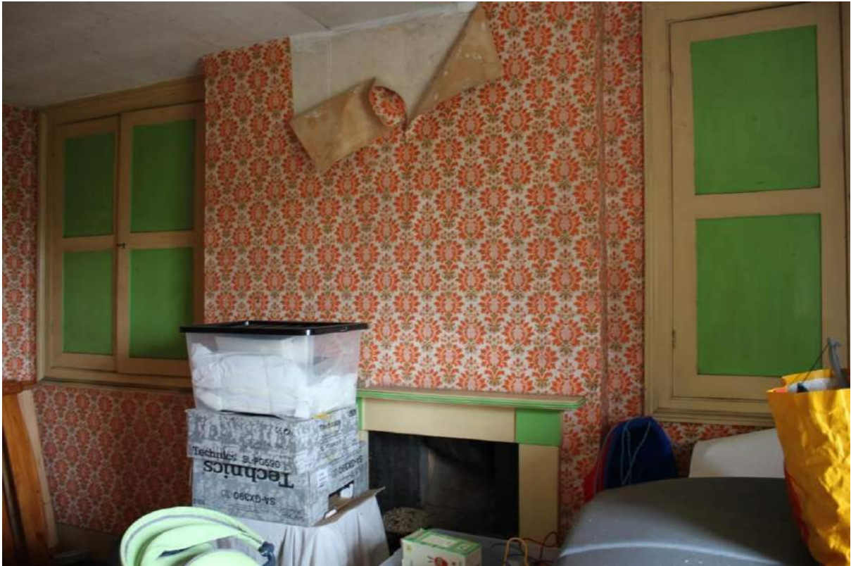
Plate 56: F5, looking east