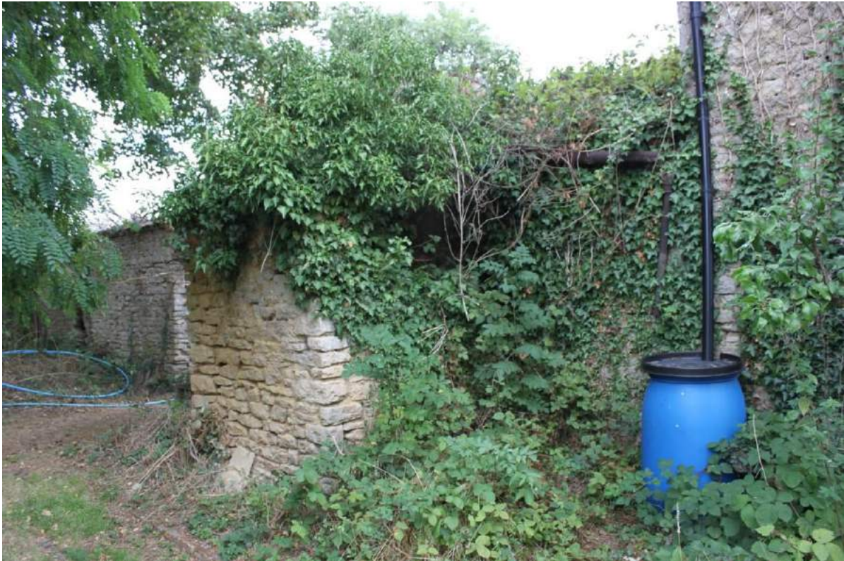
Plate 9: Western enclosure wall to the farmyard, with projecting bread oven structure against west wall of Block 3