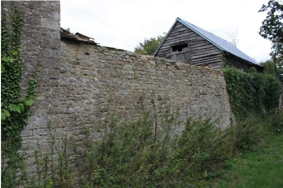
Plate 92: South face of southern boundary wall extending between Block 2 of the farmhouse and Outbuilding A