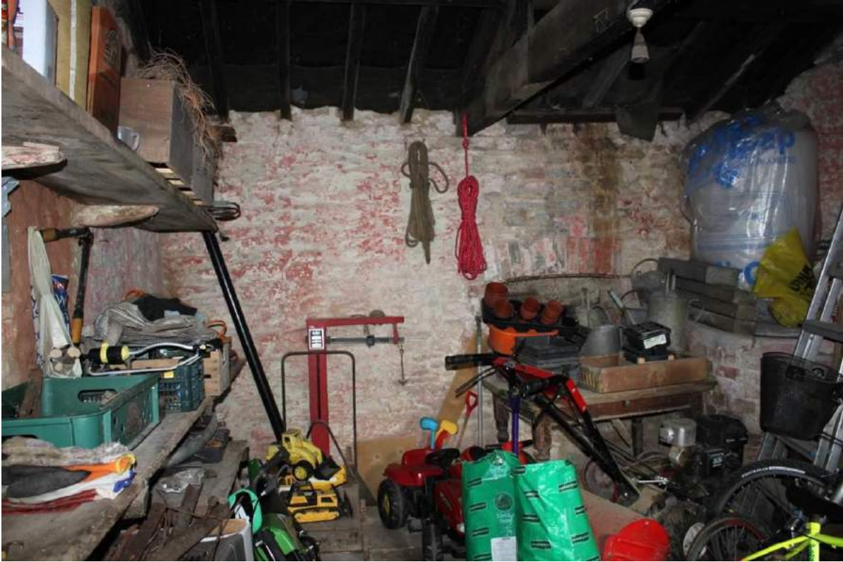
Plate 34: G8, looking west; segmental arch to right is over opening for bread oven, with copper to right