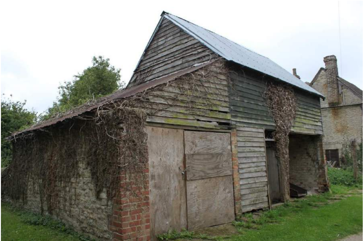
Plate 71: Outbuildings A and A1