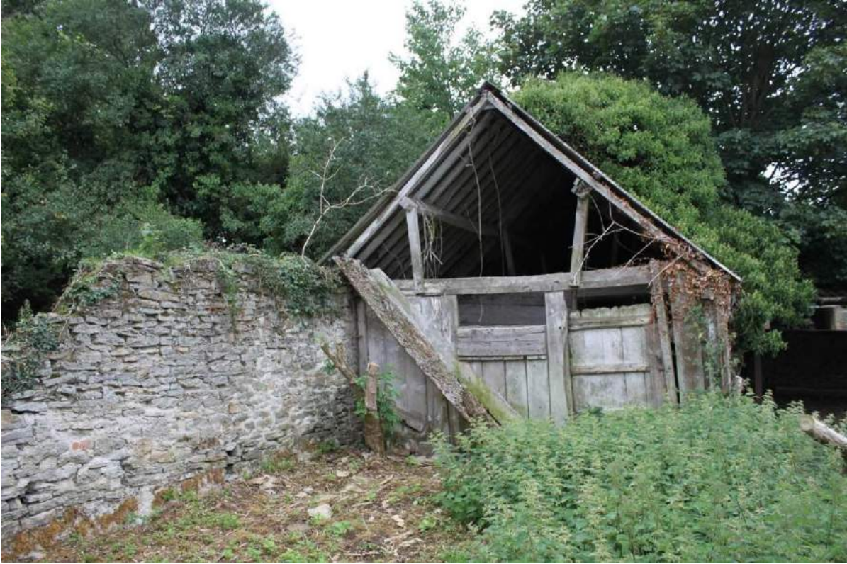
Plate 86: Outbuilding F, showing northern gable end of southern range and, in the foreground, the ruined northern range