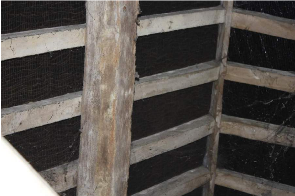
Plate 54: Detail of roof structure above F4 in Block 1