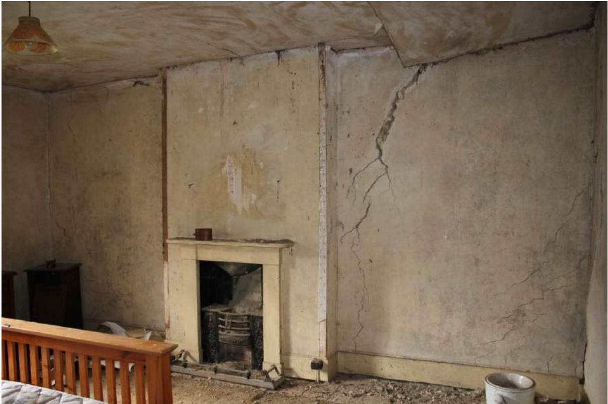
Plate 50: F3, looking west