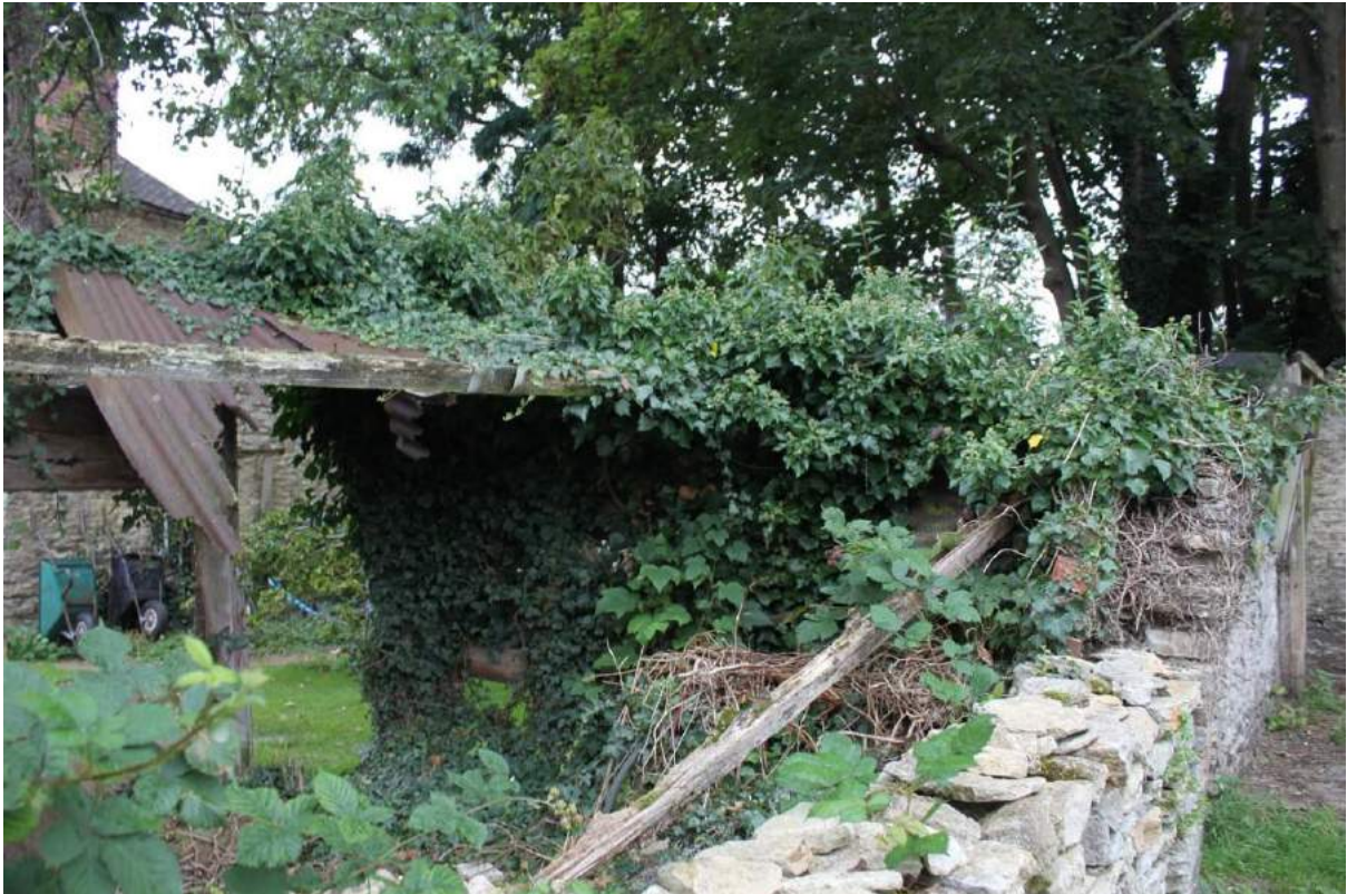
Plate 91: Outbuilding G