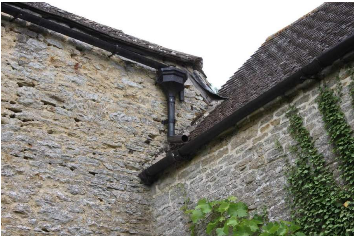
Plate 4: Junction of east elevation of Block 1 and south-west corner of Block 2, with upper section of outshut roofline shown between the two