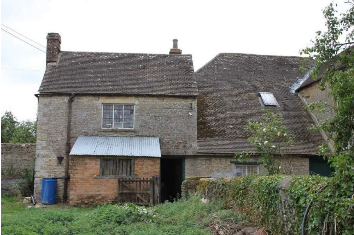
Plate 15: North elevation of Block 2, with lean-to Block 4 attached