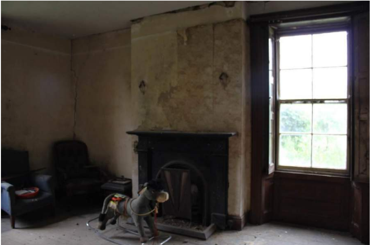
Plate 27: G3, looking west