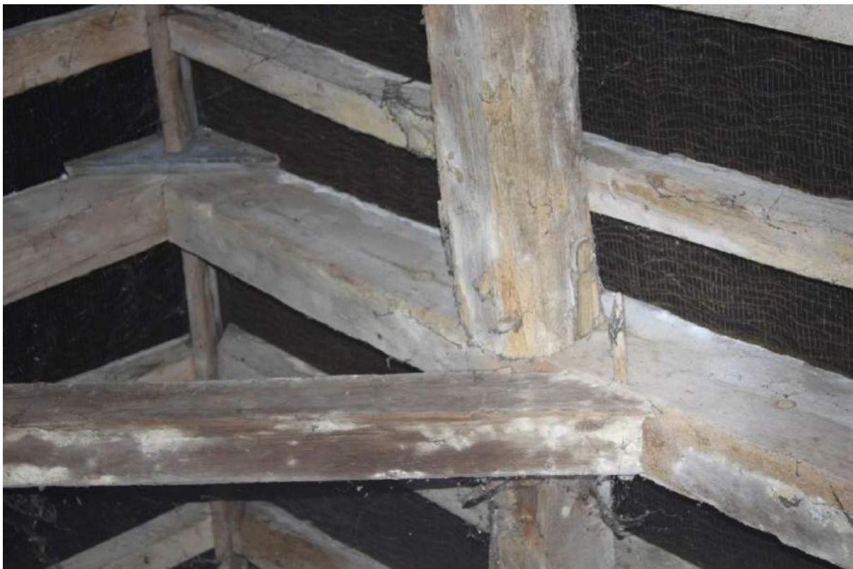
Plate 53: Detail of roof structure above F4 in Block 1