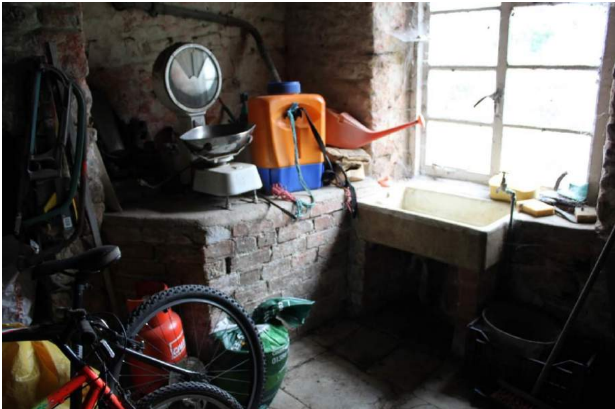
Plate 37: Copper in north-east corner of G8