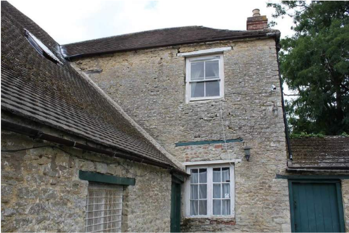
Plate 11: East elevation of rear wing to Block 1