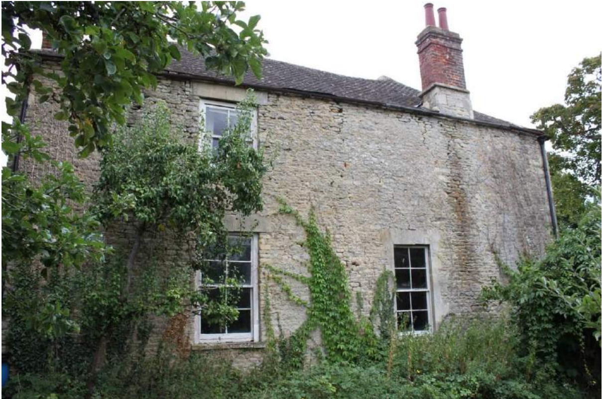
Plate 6: West return elevation