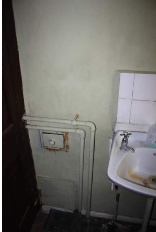
Plate 66: Lead tank in bathroom in F7 (left) and register in chimneybreast (right)