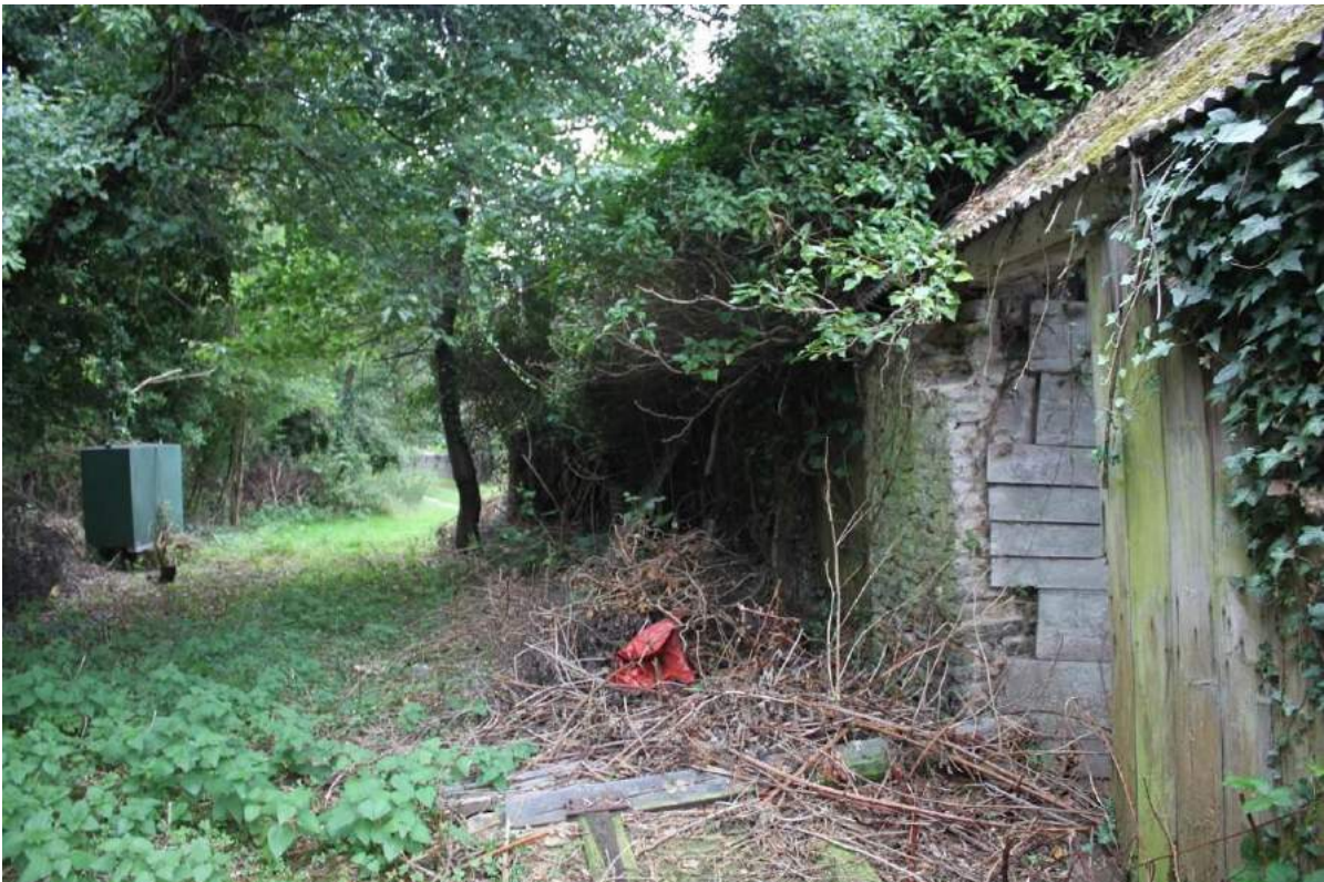
Plate 87: Outbuilding F, east elevation, looking south