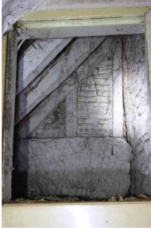
Plate 48: View east through access door above stairwell (shown on Plate 45) into roof space within outshut