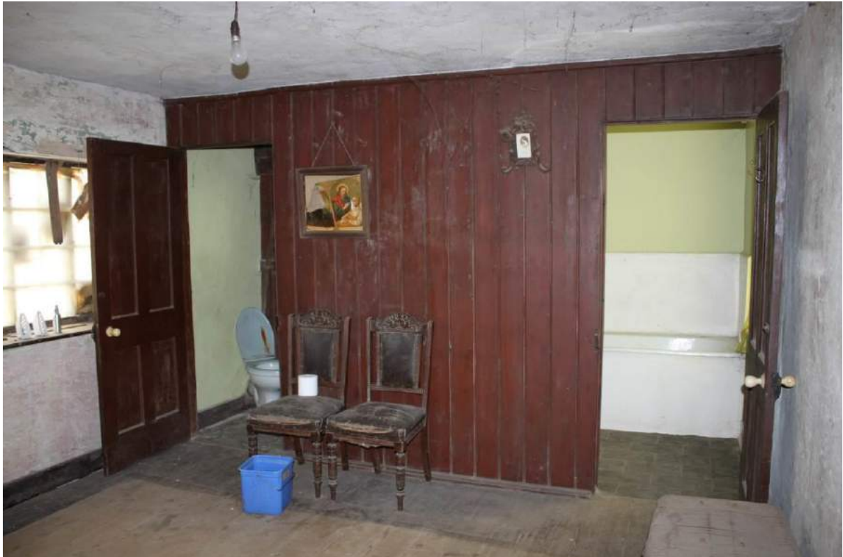
Plate 65: F7, looking east towards timber partition for bathroom and WC