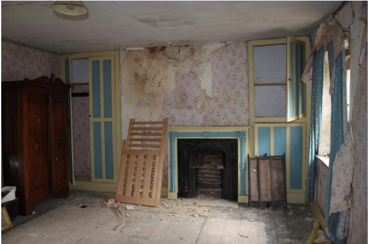
Plate 59: F2, looking north