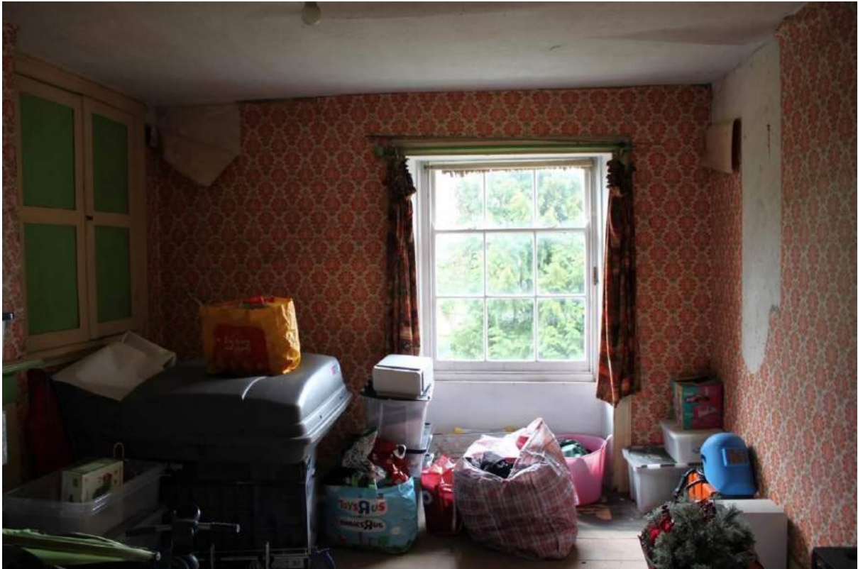
Plate 55: F5, looking south