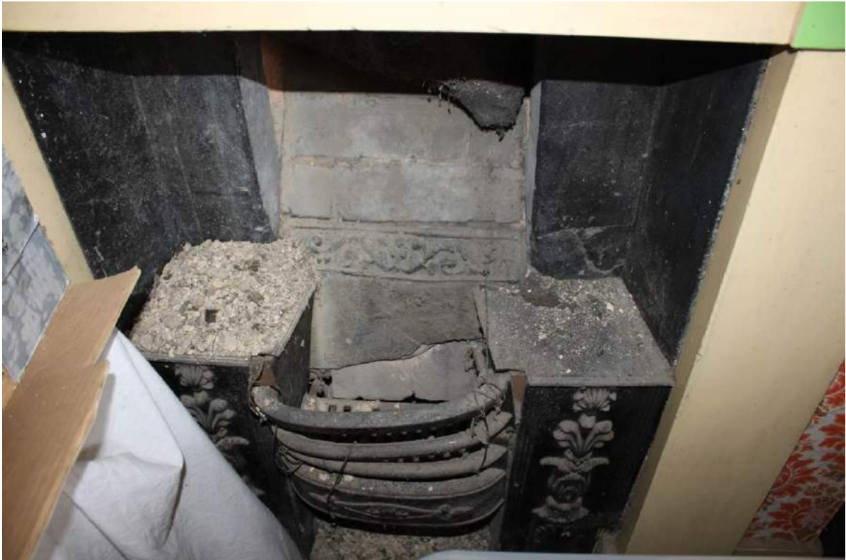
Plate 57: F5, detail of fireplace grate