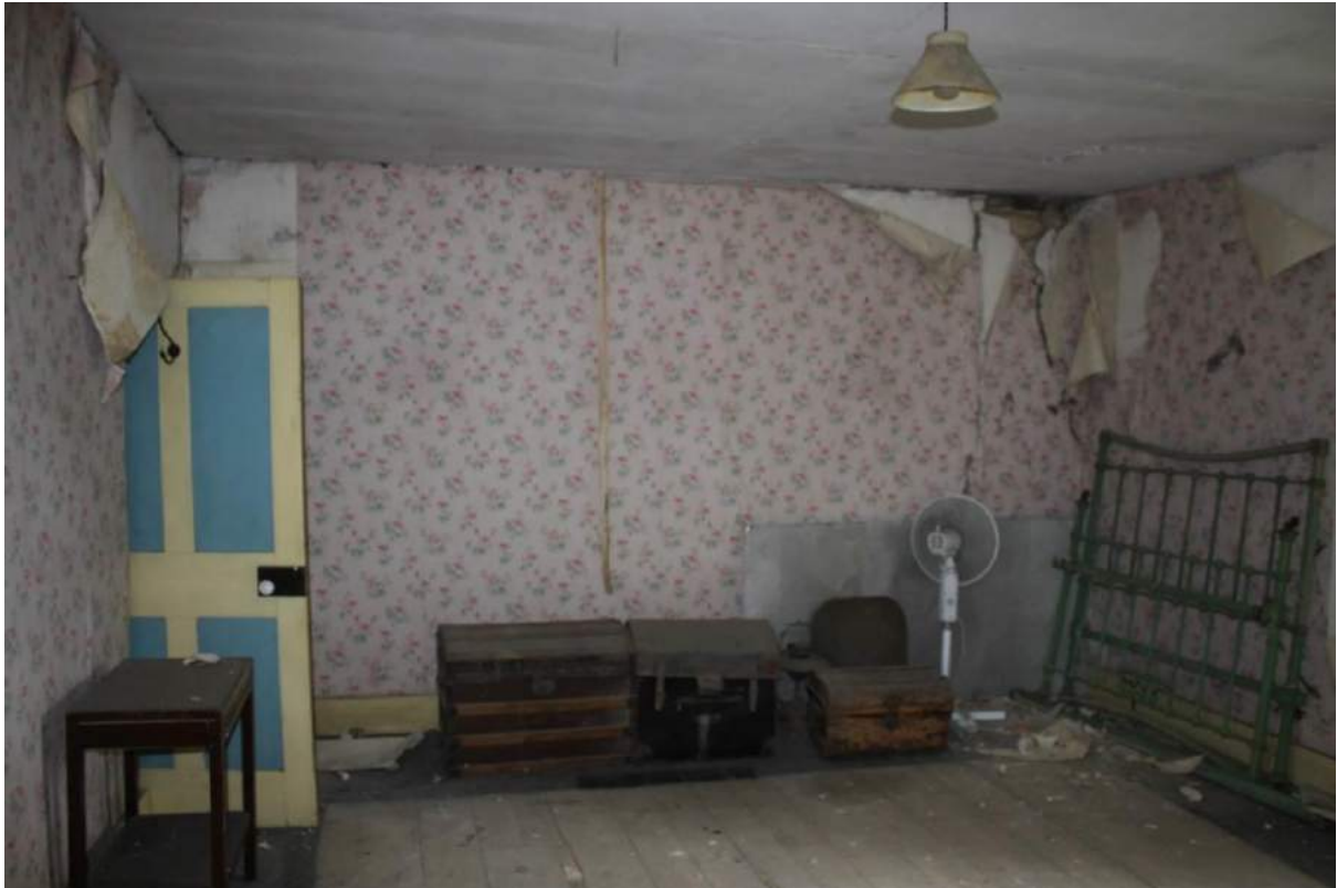
Plate 58: F2, looking south