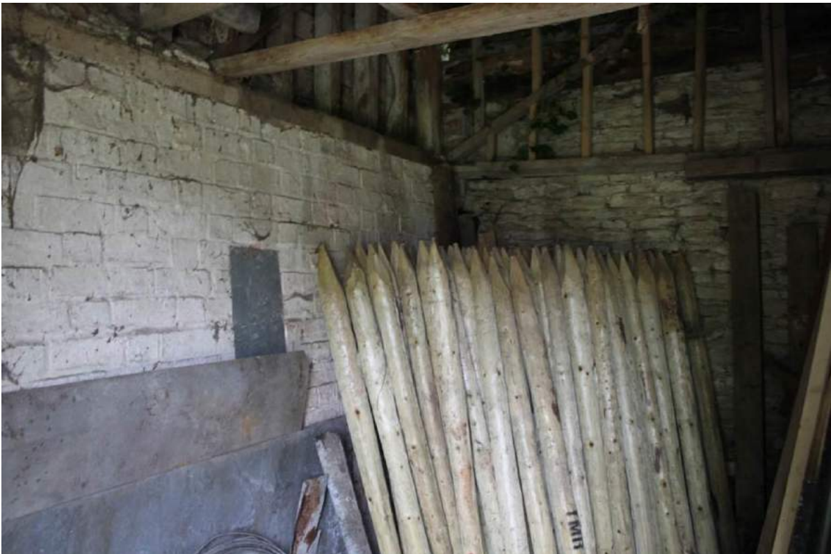
Plate 73: Interior of Outbuilding A, brick wall dividing internal bays and stone boundary wall to rear