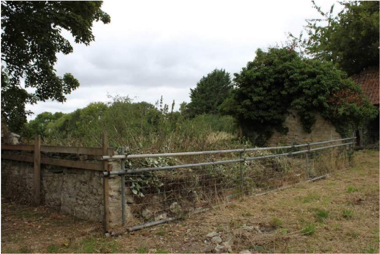
Plate 84: Outbuilding E, northern section