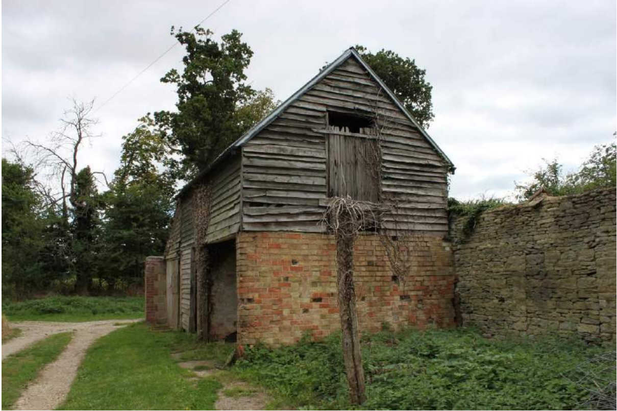
Plate 70: Outbuilding A, west gable end