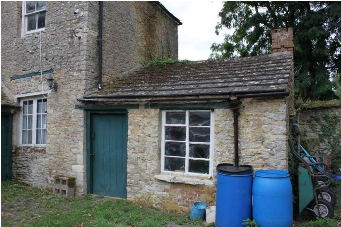
Plate 8: East elevation of Block 3 (laundry/bake-house)