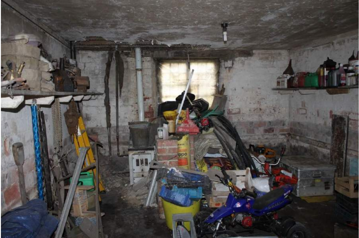
Plate 42: G6, looking north