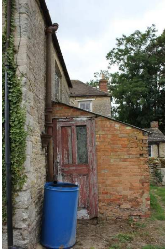
Plate 18: Block 4