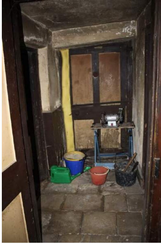
Plate 22: G4, rear lobby looking towards rear door