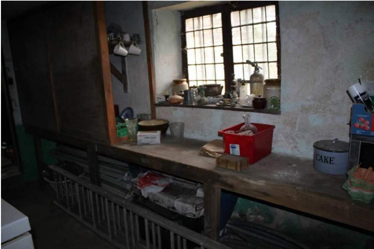
Plate 40: North wall of G5, with bench