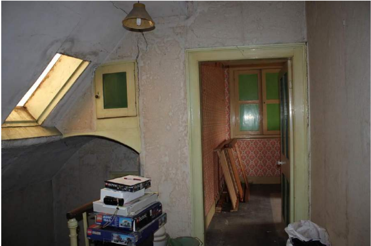
Plate 45: F1 (landing), looking east towards bedroom F5