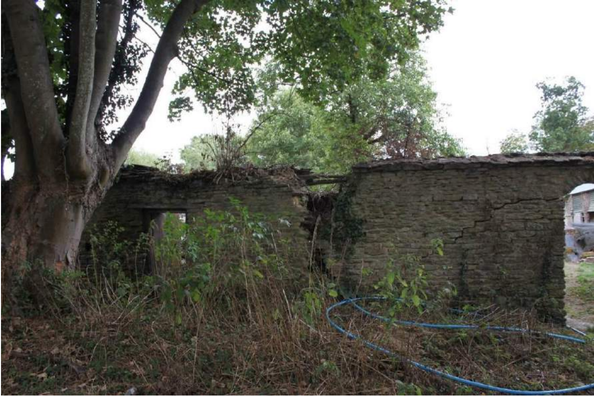
Plate 94: West face of western boundary wall