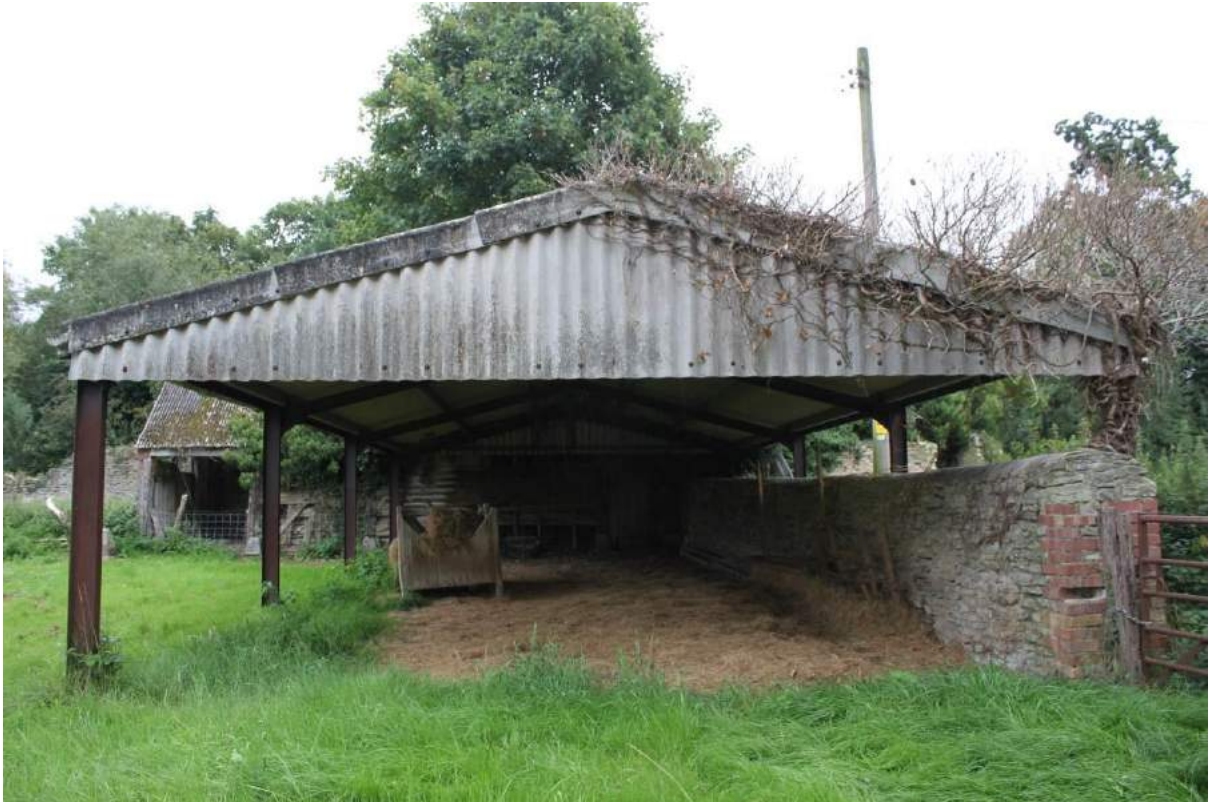
Plate 81: Outbuilding D, with historic boundary wall