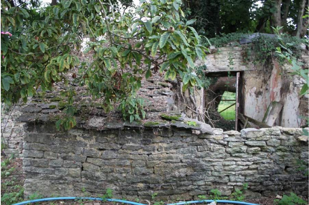
Plate 82: Outbuilding E (southern end, looking west)