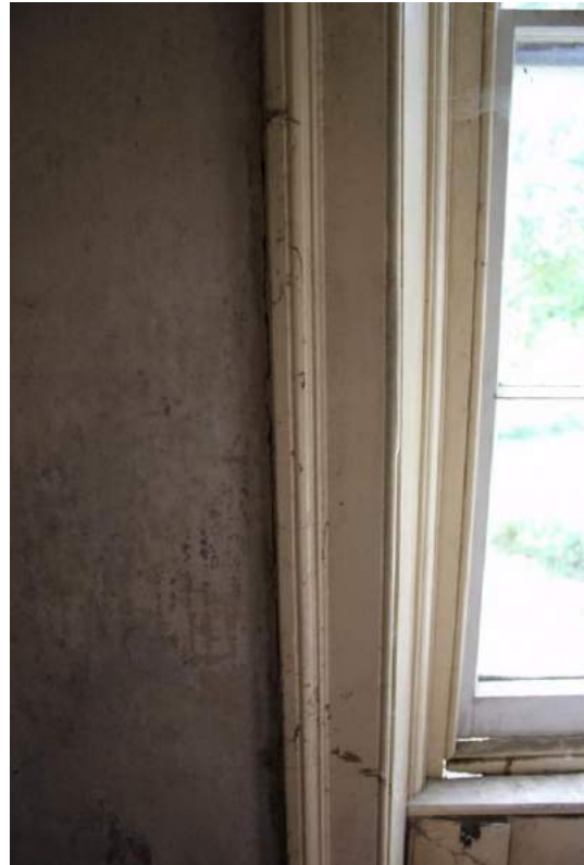
Plate 51: F3, detail of window opening