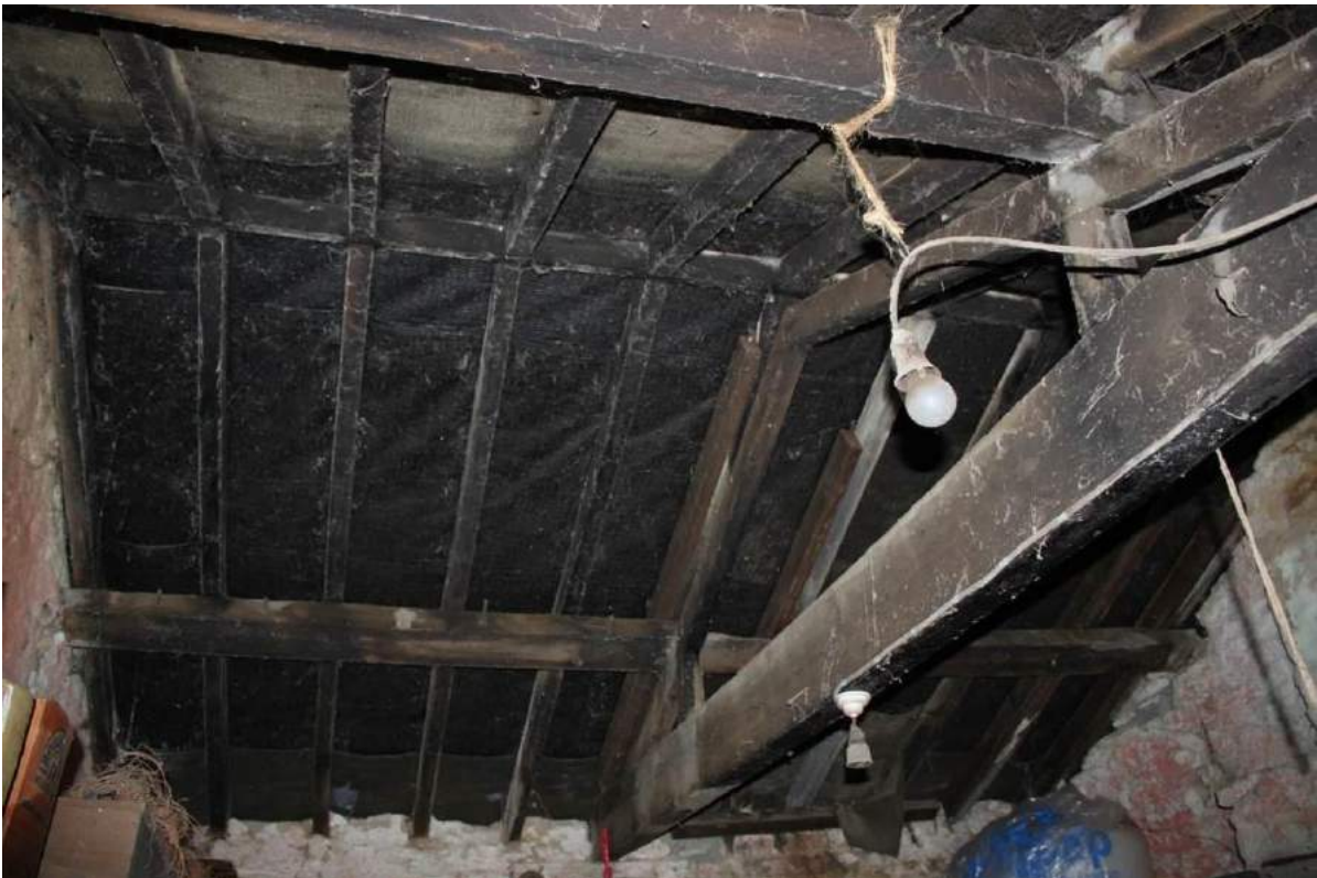
Plate 35: Roof structure of G8/Block 3