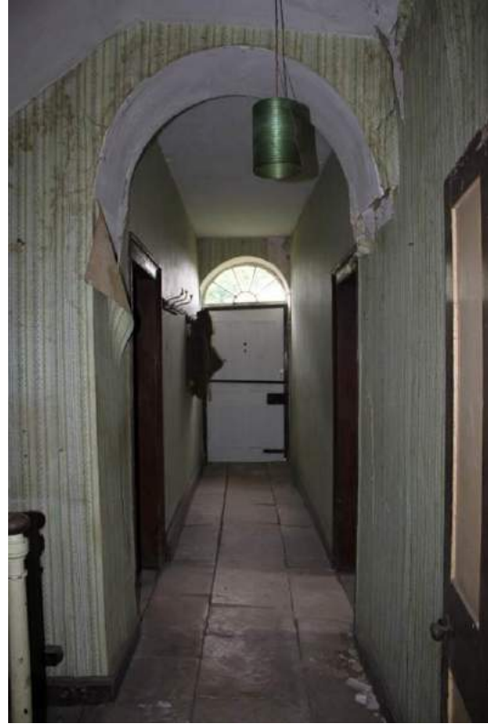
Plate 20: G1 (entrance hall), looking north to the rear (left) and south to the front (right)