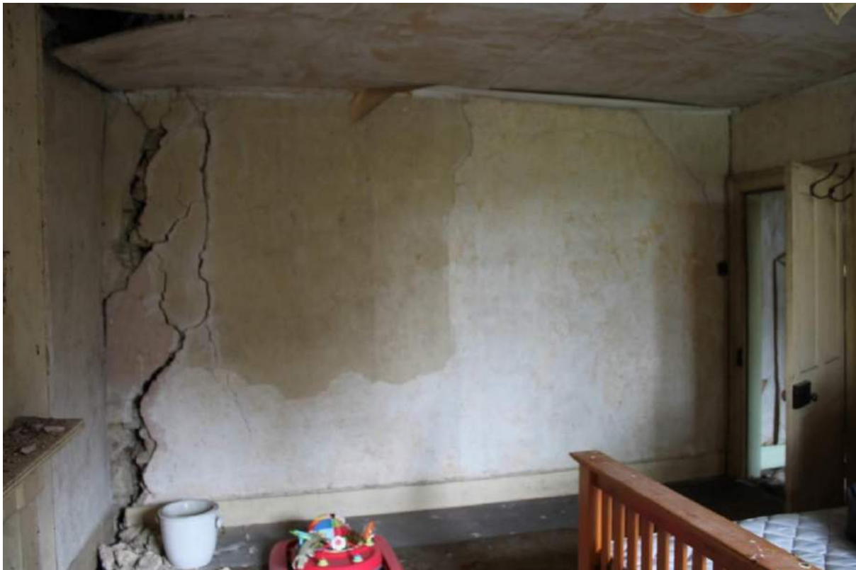
Plate 49: F3, looking north