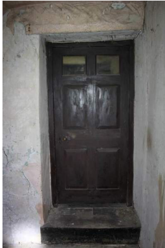
Plate 63: F6, looking east towards six-panelled door into F7