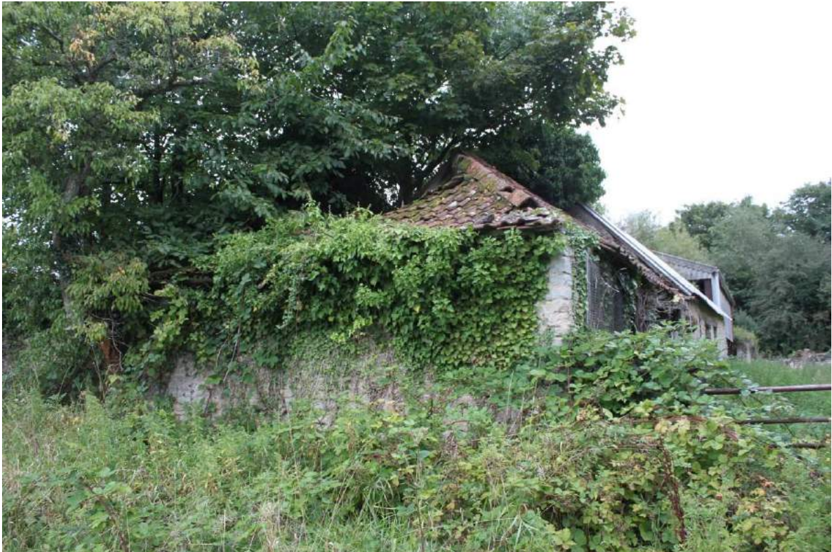
Plate 79: Outbuilding B1, west elevation