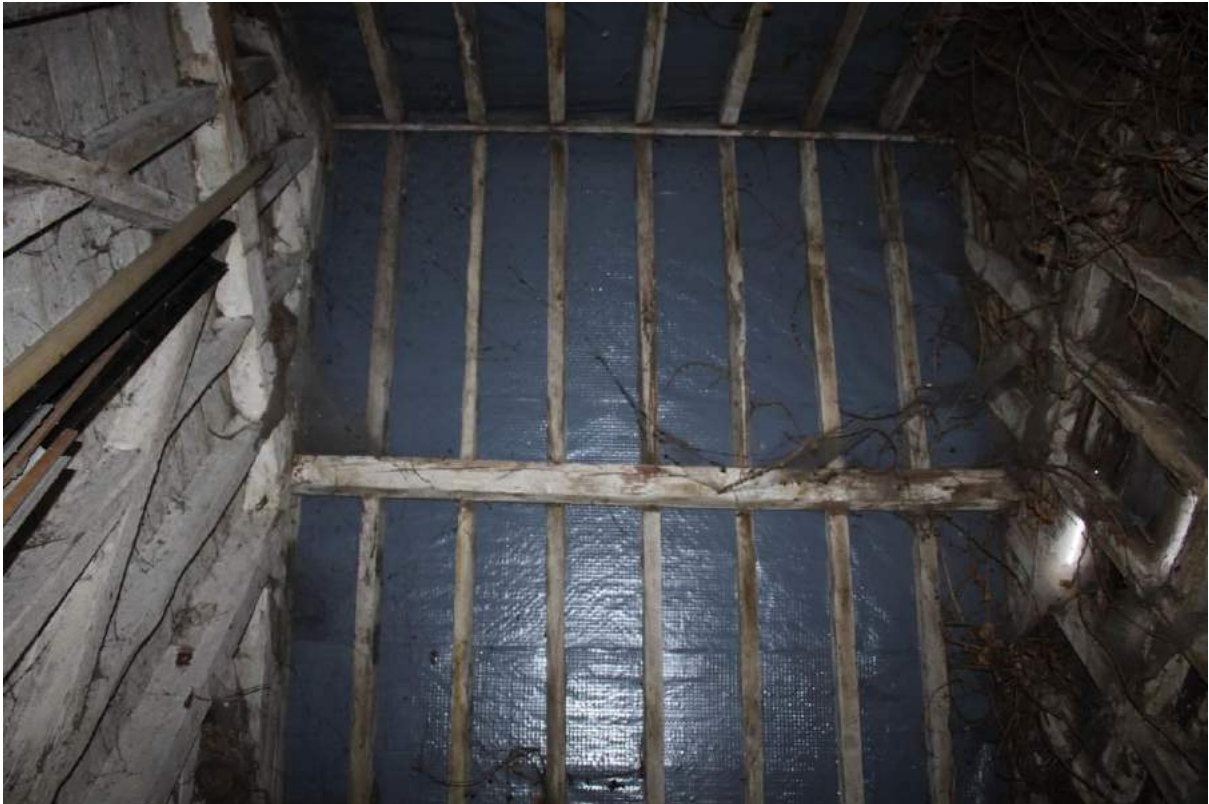
Plate 74: Eastern bay of Outbuilding A