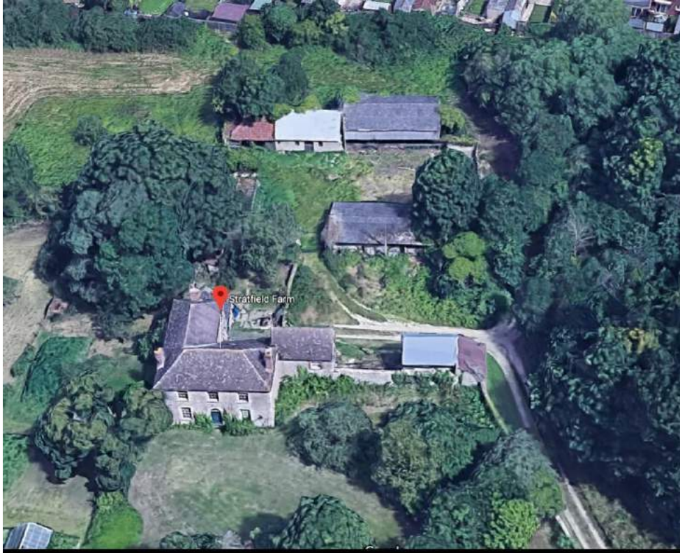
Plate 68: Google mapping aerial view of the farmhouse and outbuildings, looking north