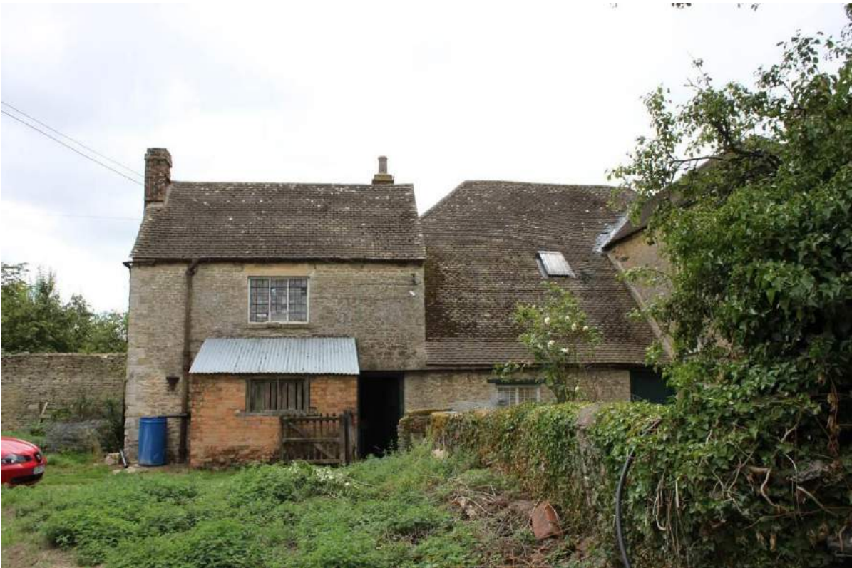
Plate 96: Looking south towards rear elevation of farmhouse, with dividing boundary wall to right