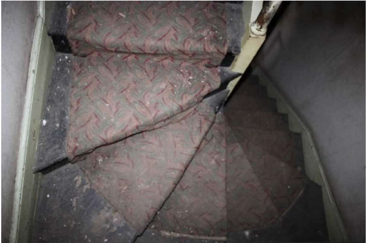
Plate 44: Looking down staircase from winders partway up