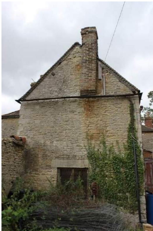
Plate 16 (left): East gable end of Block 2