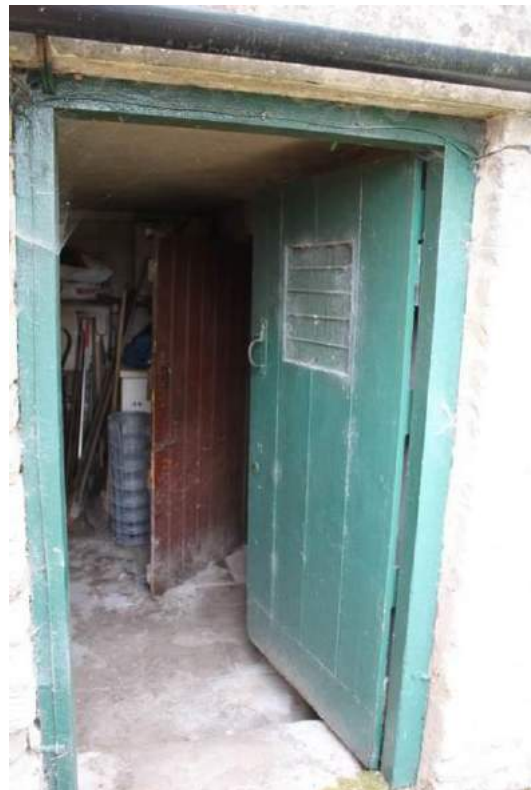
Plate 17 (right): Boarded door with vented panel to Block 2