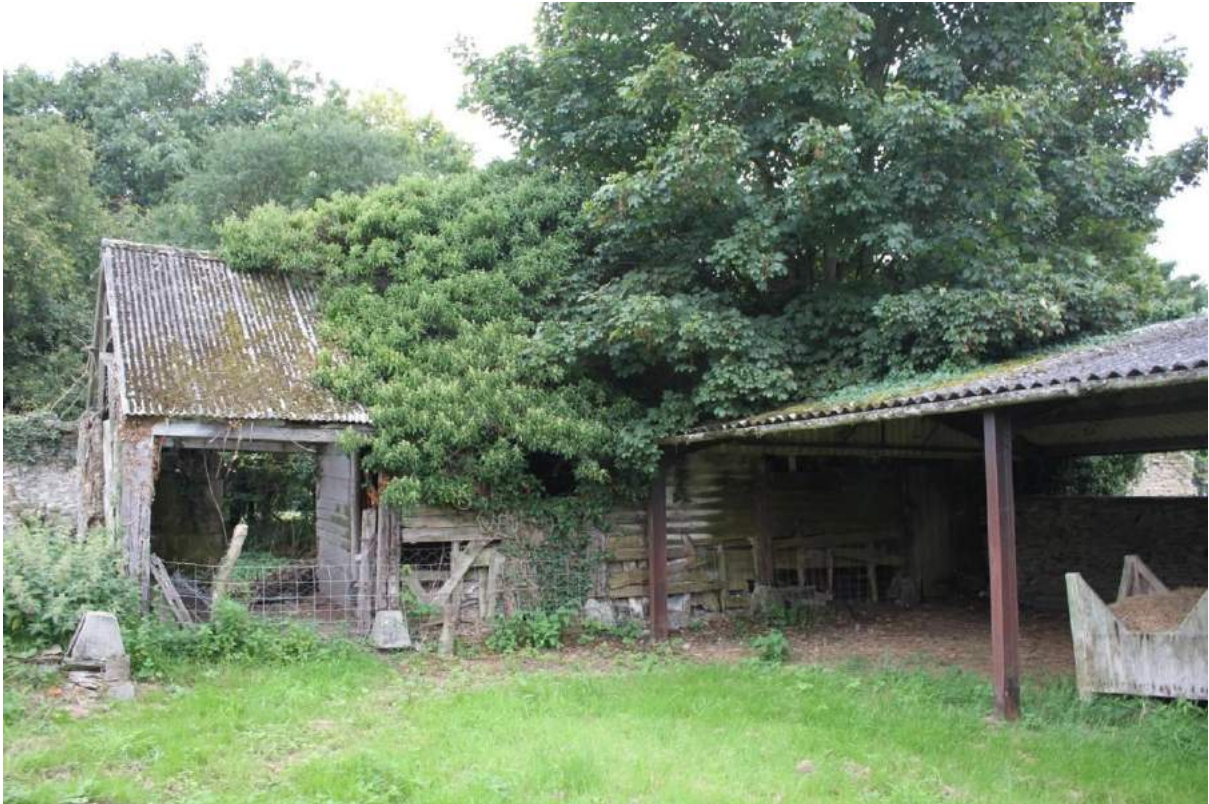
Plate 85: Outbuilding F, west elevation