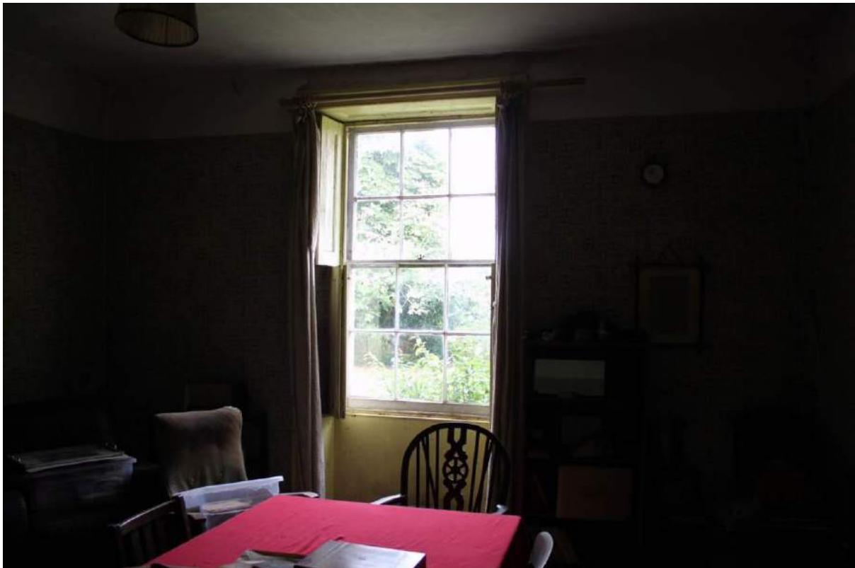
Plate 23: G2, looking south