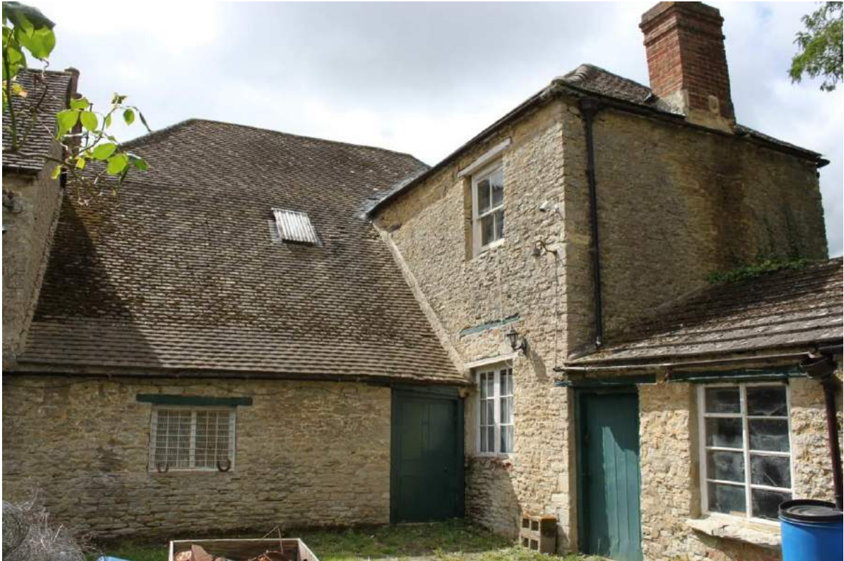
Plate 13: Rear elevation