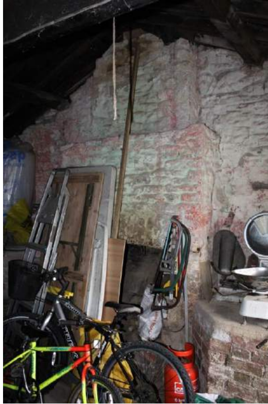
Plate 36: Chimneybreast and fireplace on north wall of G8, with coppers to either side