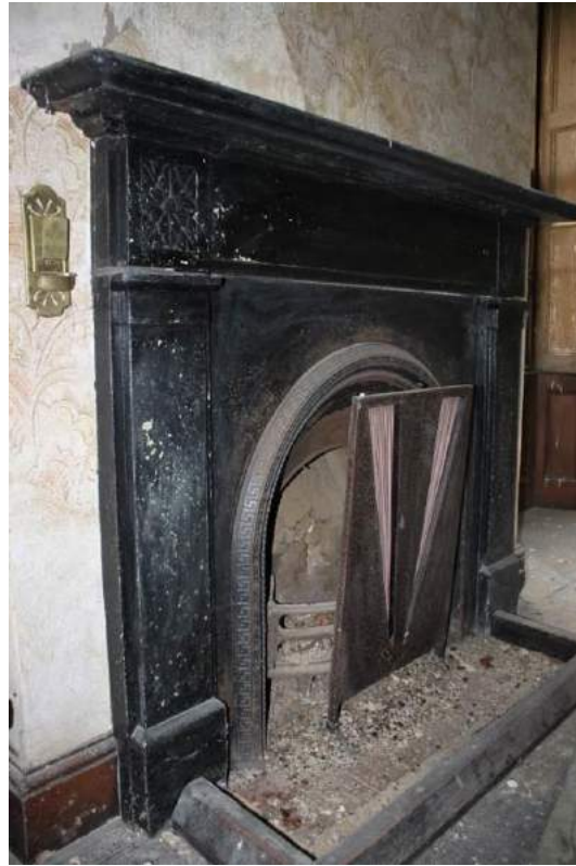
Plate 28: Detail of fireplace in G3