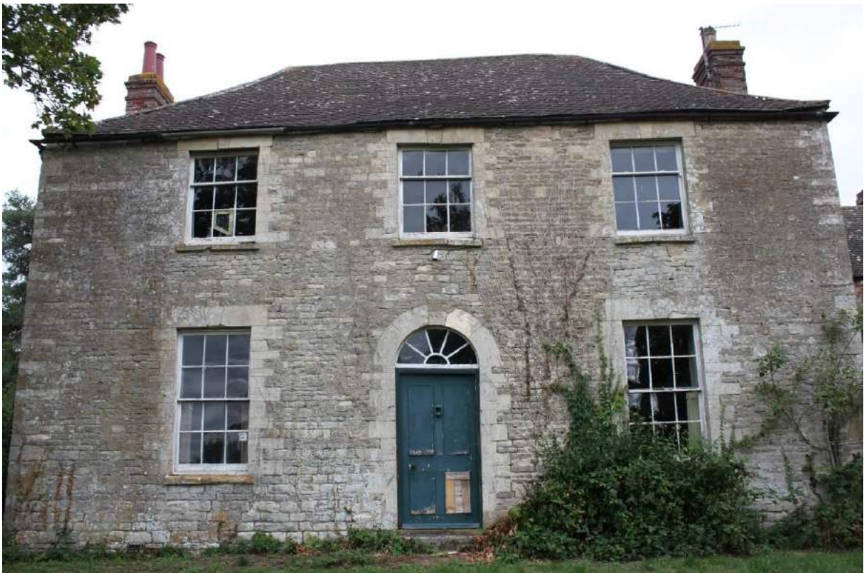
Plate 2: Front (south) elevation