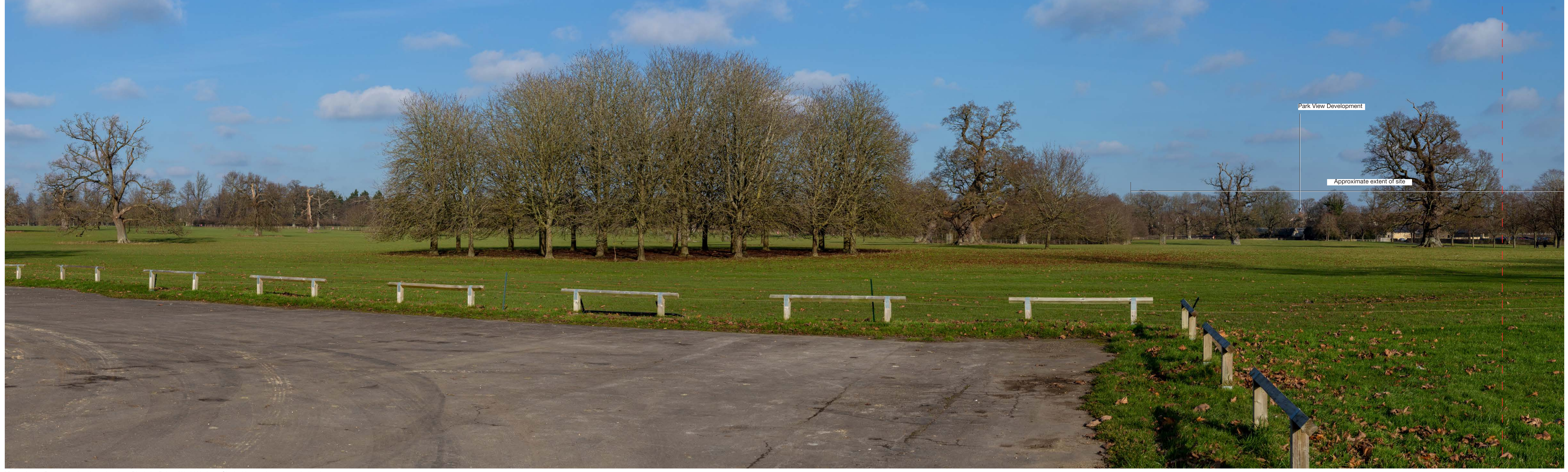
Viewpoint 9 - Representative view taken from Blenheim Palace World Heritage Site looking northeast towards the site Visualisation Type 1. To be viewed at a comfortable arm's length and printed at A1