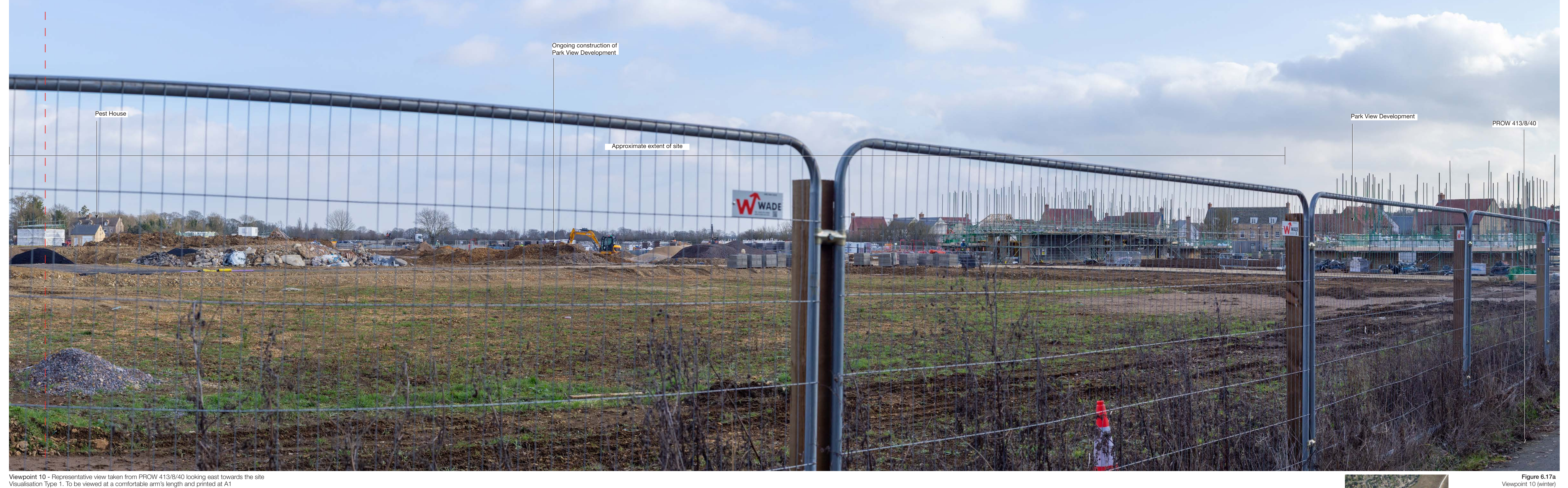
Viewpoint 10 - Representative view taken from PROW 413/8/40 looking east towards the site Visualisation Type 1. To be viewed at a comfortable arm's length and printed at A1