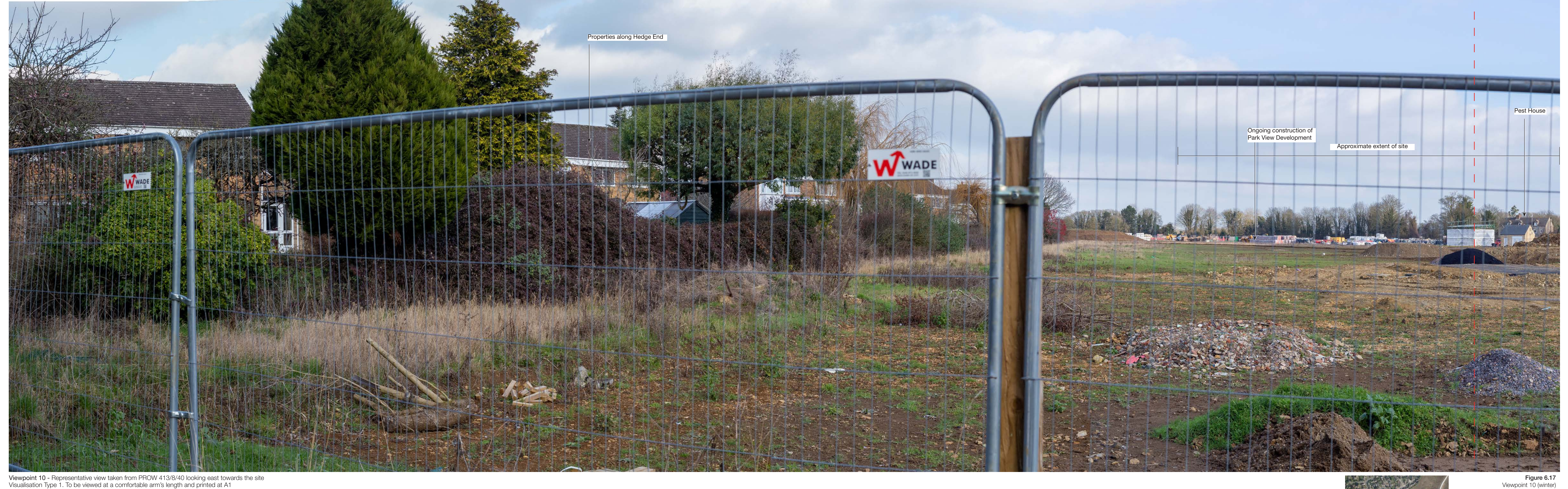
Viewpoint 10 - Representative view taken from PROW 413/8/40 looking east towards the site Visualisation Type 1. To be viewed at a comfortable arm's length and printed at A1