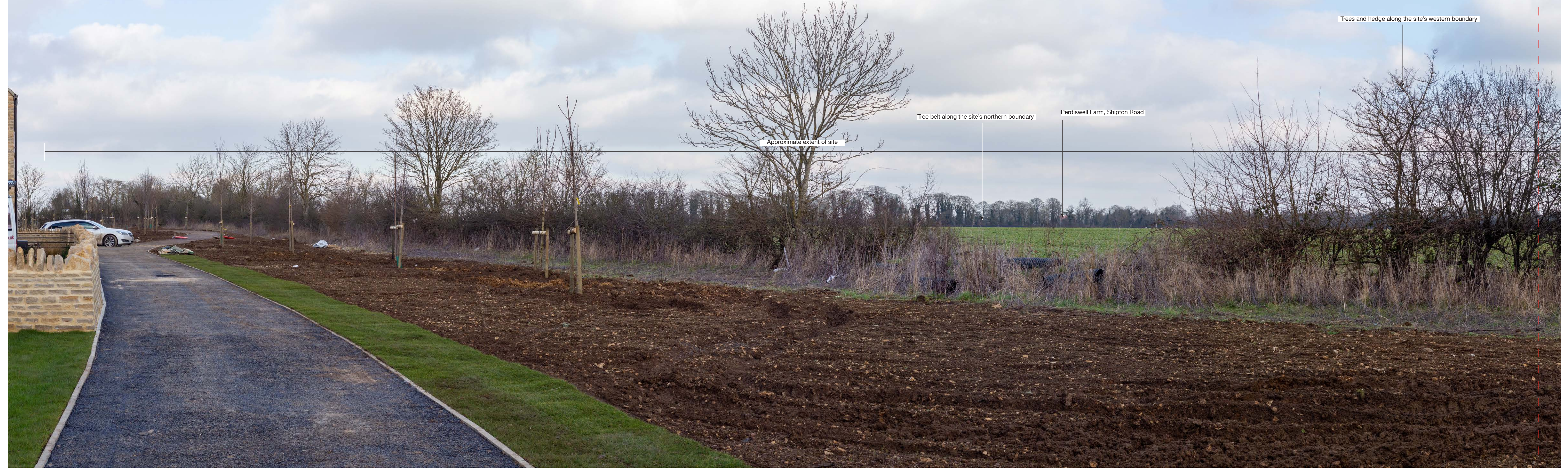
Viewpoint 11 - Representative view taken from Park View Development looking east towards the site Visualisation Type 1. To be viewed at a comfortable arm's length and printed at A1