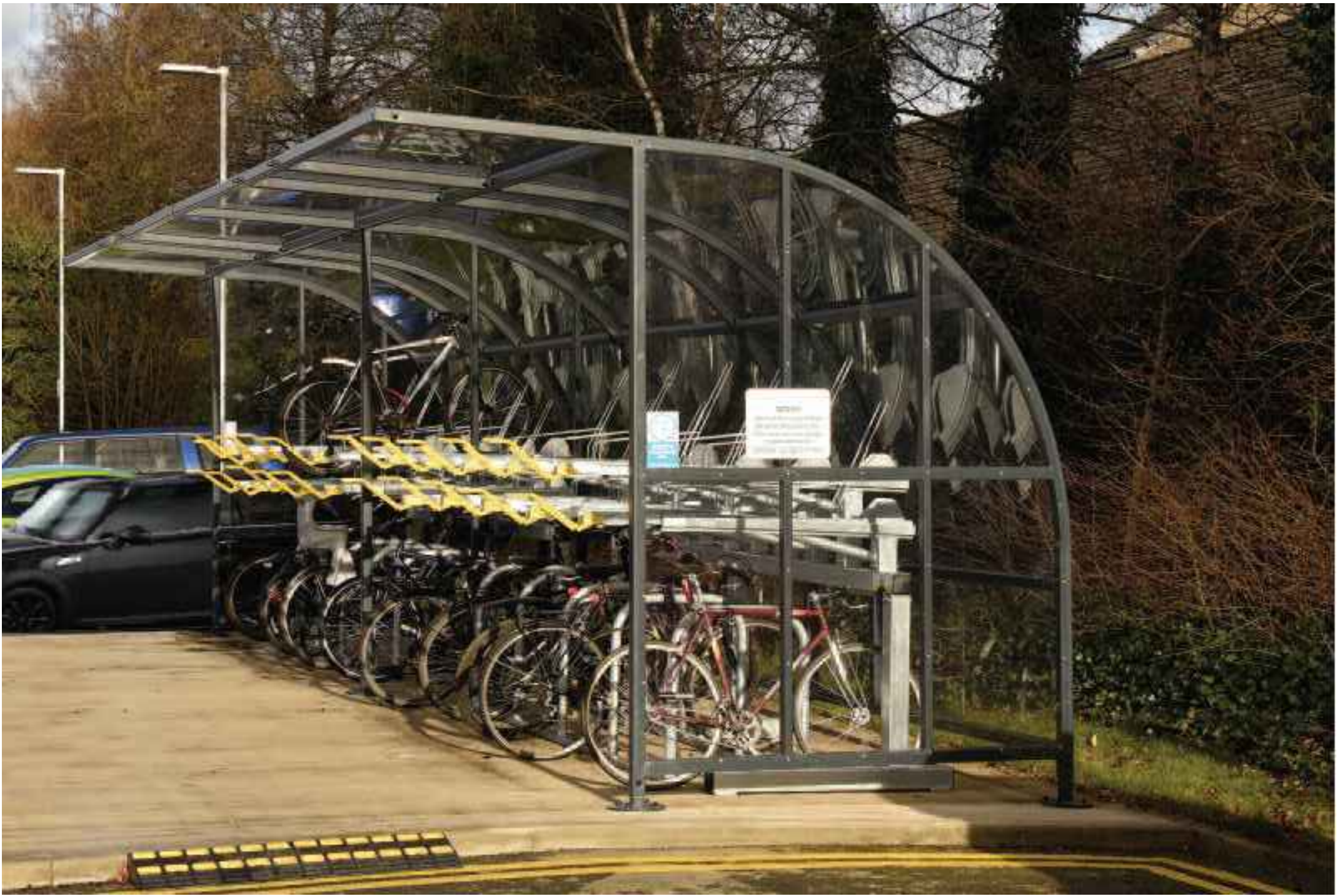
TYPICAL CYCLE SHELTER IMAGE