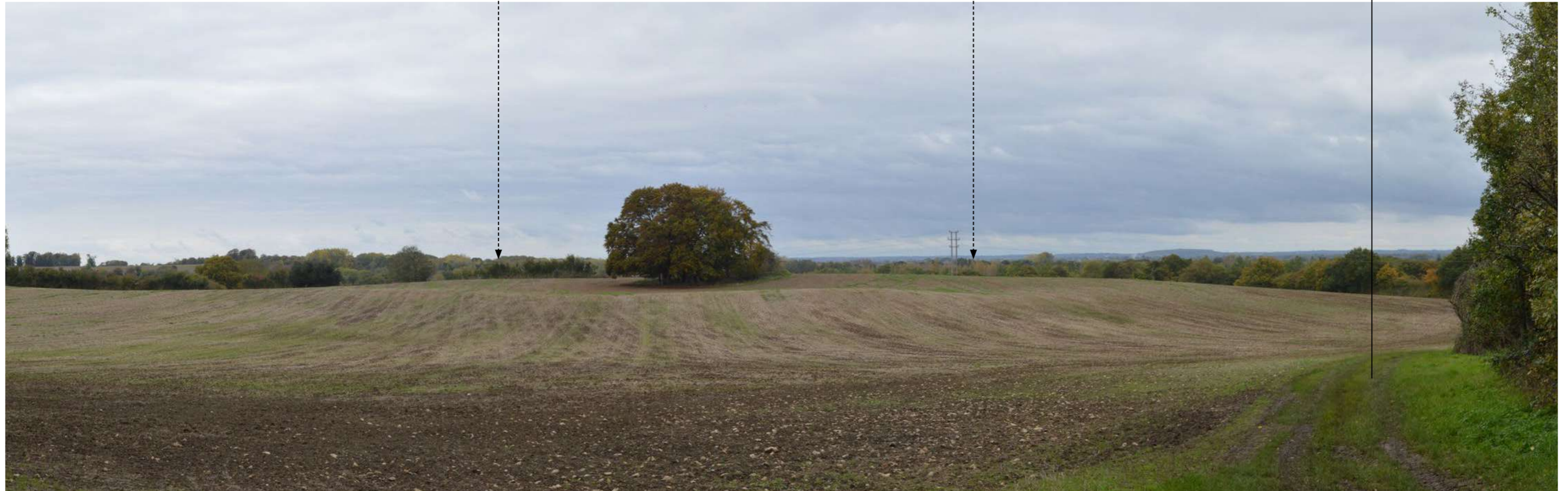
Viewpoint 16: View looking north from Oxford Greenbelt Way east of Wooddeaton Wood.

Baseline: From this location, there are no views towards the site due to the rising landform away from the viewpoint location before falling towards the site and intervening mature vegetation.