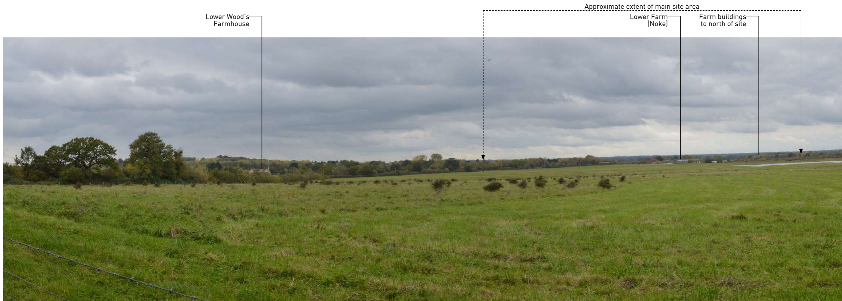
Viewpoint 14: View looking north-west from Oxfordshire Way north of Noke Wood.

Baseline: From this location, which is at a similar topographical level as the site, views towards the western part of the site are heavily screened by mature vegetation on the southern edge of Noke which is visible in the middle ground. Partial views are available towards the eastern part of the site, which are filtered somewhat by Lower Farm and intervening vegetation. The farm buildings to the north of the site are partially visible in the background. Lower Wood's Farmhouse is visible in the middle ground on the left hand side of the view.