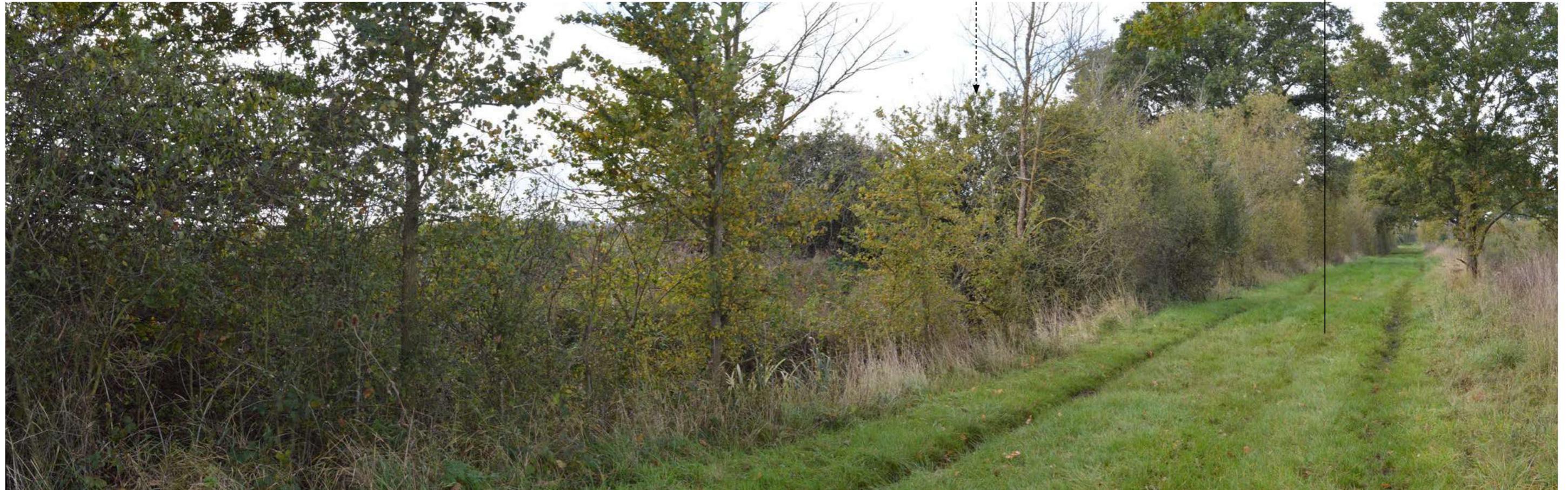
Viewpoint 12: View looking south-west from public bridleway east of Oddington.

Baseline: From this location, long-distance views towards the site are heavily screened by intervening mature vegetation. It should also be noted that this viewpoint is taken from a 'break' in the mature vegetation along this route.