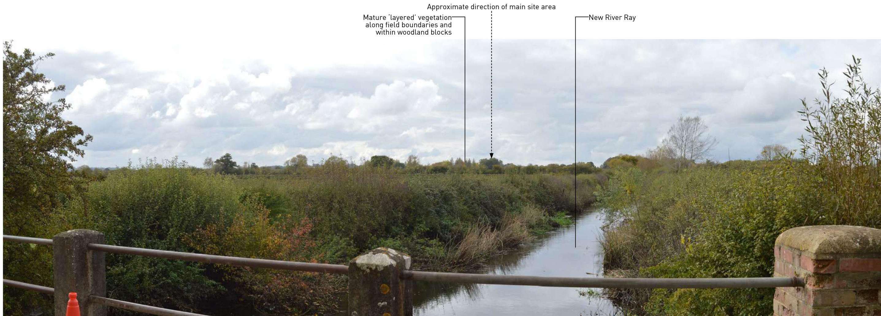
Viewpoint 11: View looking south-west from public bridlway on footbridge over New River Ray south of Charlton-on-Otmoor.