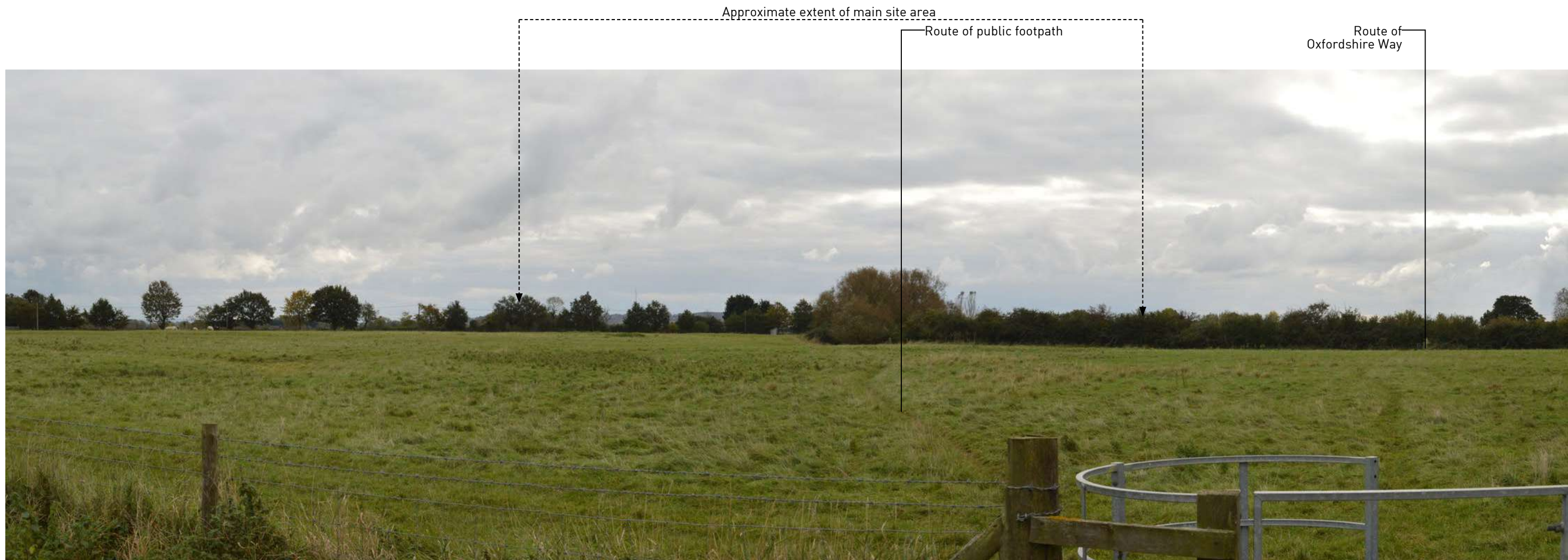
Viewpoint 10: View looking south from Oxfordshire Way near to Oddington Grange.

Baseline: From this location, long-distance views towards the site are heavily screened by intervening mature vegetation.