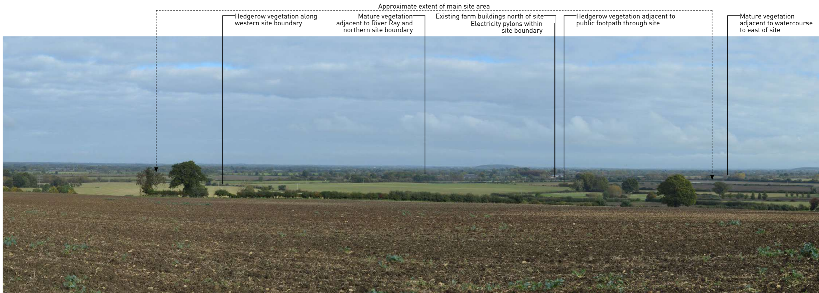
Viewpoint 5: View looking north-east from Oxfordshire Way west of Noke.

Baseline: From this elevated location, there are direct views of the western part of the site in the middle ground which slopes down towards the River Ray corridor along the northern site boundary. Views to the ground plane of the eastern part of the site are filtered somewhat by internal hedgerow vegetation, however many of which are fragmented and so allows direct views.