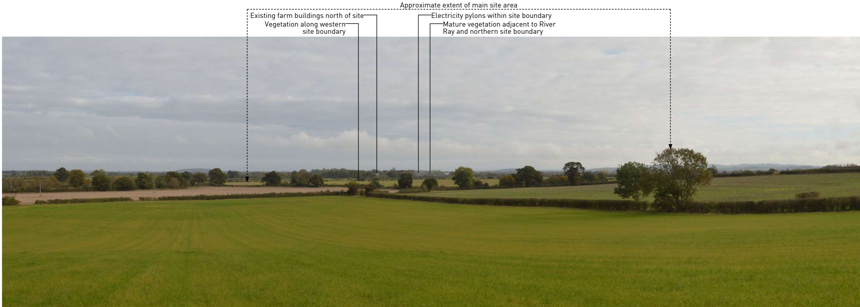
Viewpoint 6: View looking north-east from Oxfordshire Way east of Islip.

Baseline: From this location, there are views of the site in the middle ground and background which are somewhat filtered due to intervening vegetation. However, the majority of vegetation along the western site boundary is fragmented and so allows views to the ground plane of the site. This viewpoint is from a less elevated position than Viewpoint 5 located further east and so views of the site are screened more heavily by existing vegetation along intervening field boundaries.