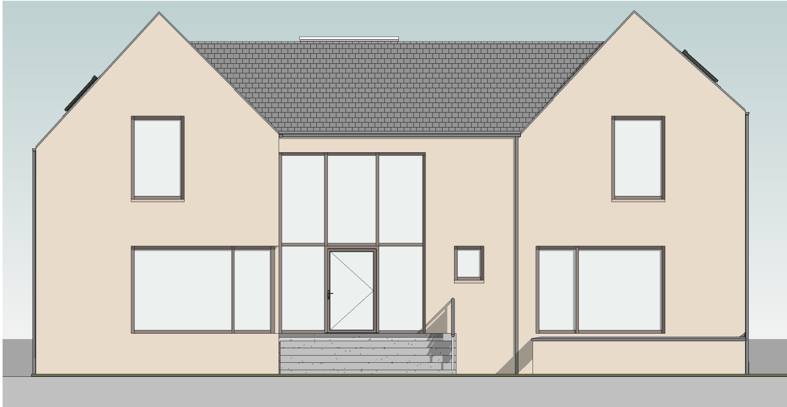
South Elevation BR

Stone to be 50/50 mix of ironstone and limestone. No Limewash