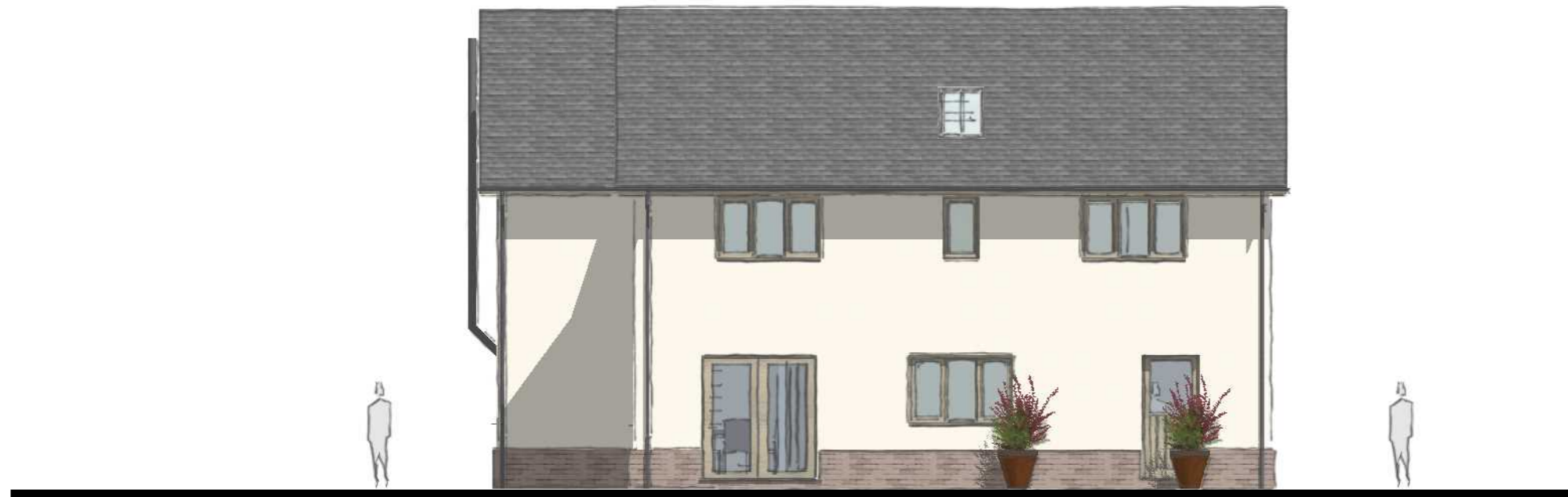
SIDE WEST ELEVATION Proposed Scale 1:100