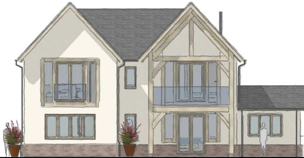
FRONT (SOUTH) ELEVATION Proposed Scale 1:100