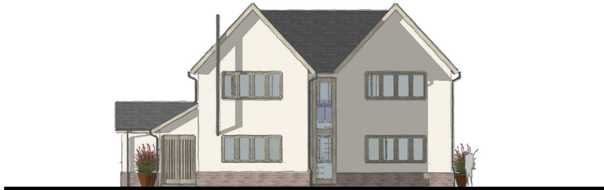
REAR NORTH ELEVATION Proposed Scale 1:100