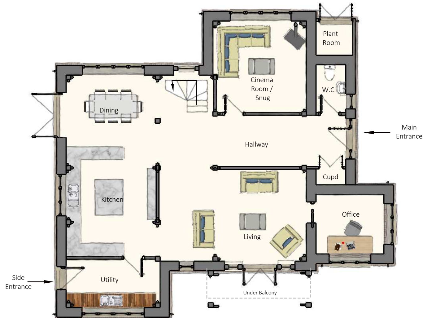
GROUND FLOOR PLAN Proposed Scale 1:100