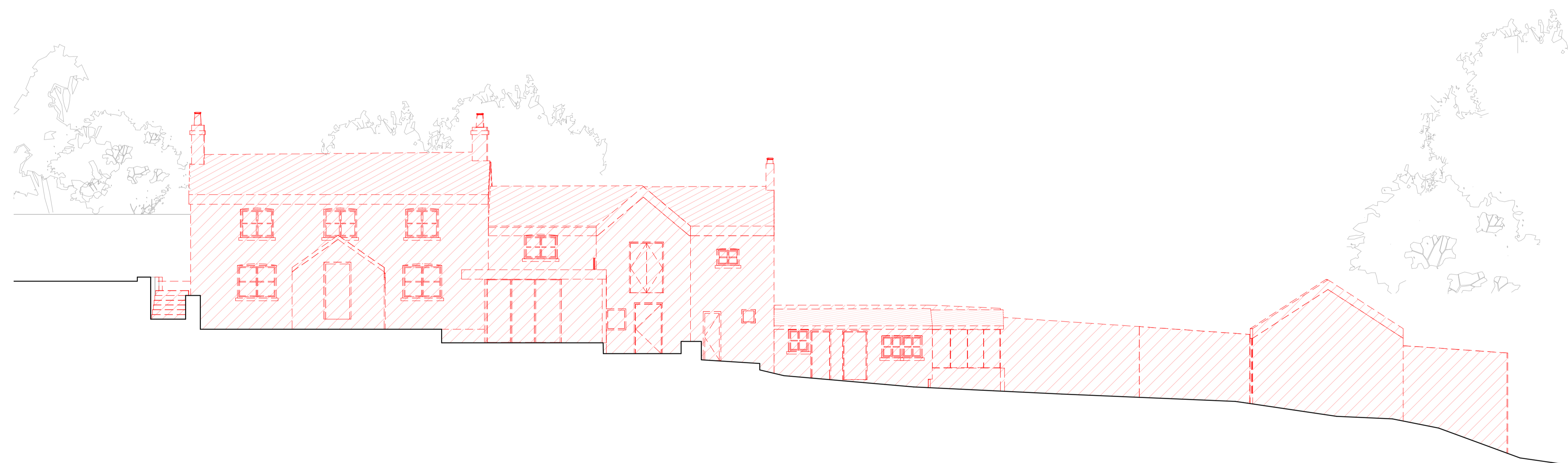
2 Demolition South Elevation 1 : 100