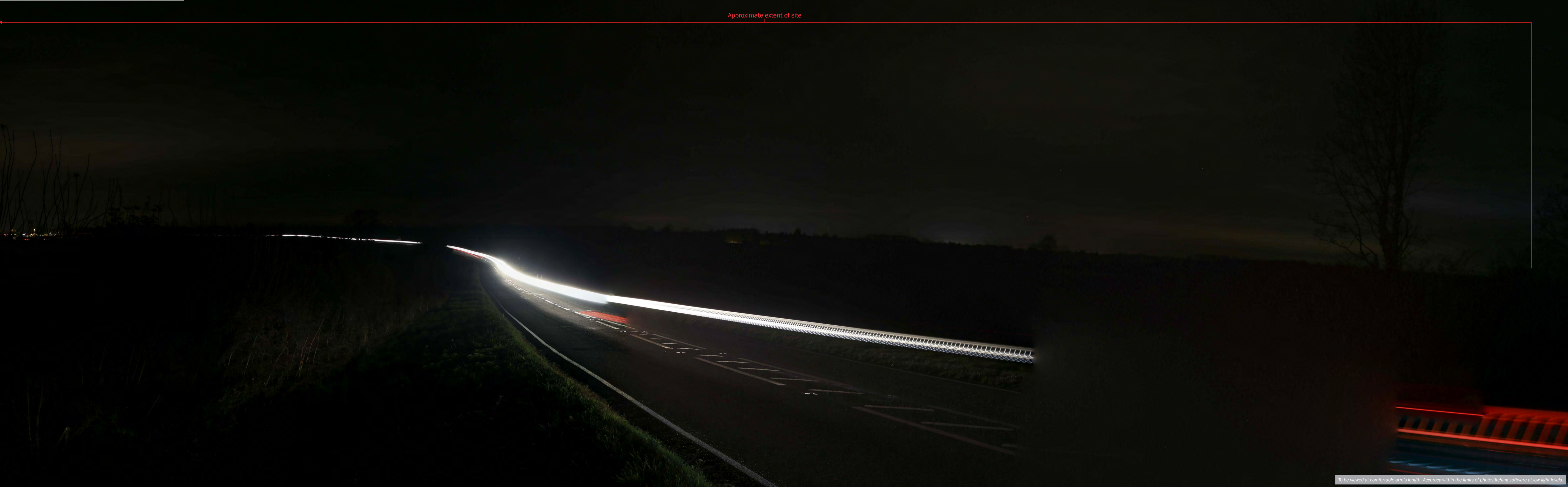
Photoviewpoint EDP 6: View from a minor road and its junction with the B4100

To be viewed at comfortable arm's length. Accuracy within the limits of photostitching software at low light levels.