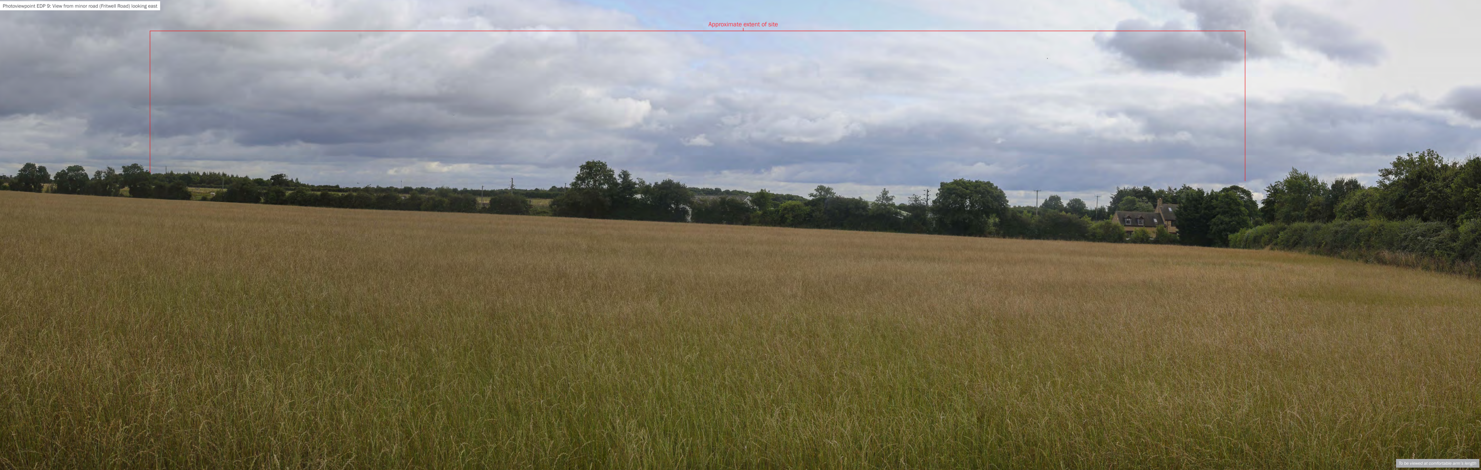
Photoviewpoint EDP 9: View from minor road (Fritwell Road) looking east

To be viewed at comfortable arm's length