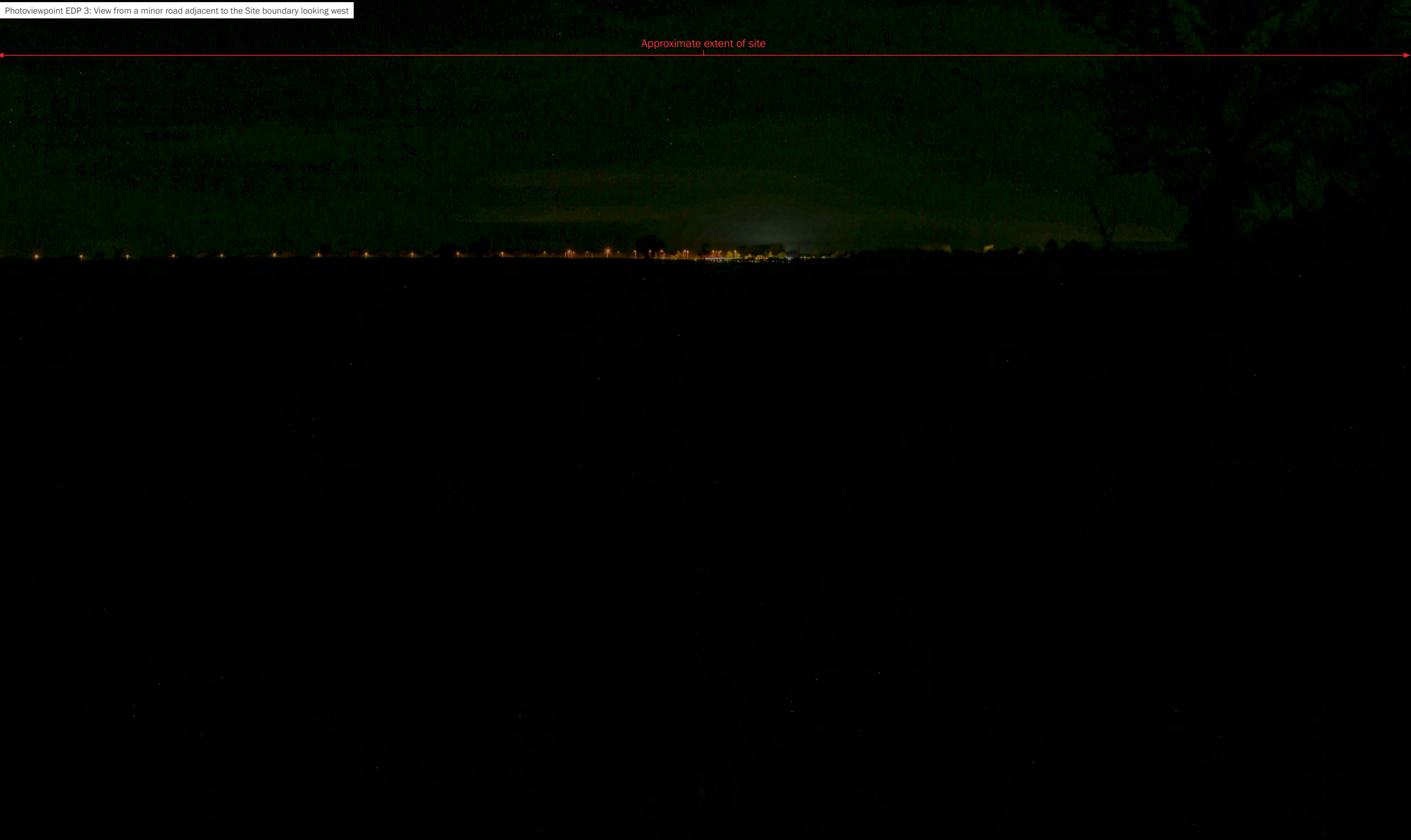
Photoviewpoint EDP 3: View from a minor road adjacent to the Site boundary looking west.

To be viewed at comfortable arm's length. Accuracy within the limits of photostitching software at low light levels.