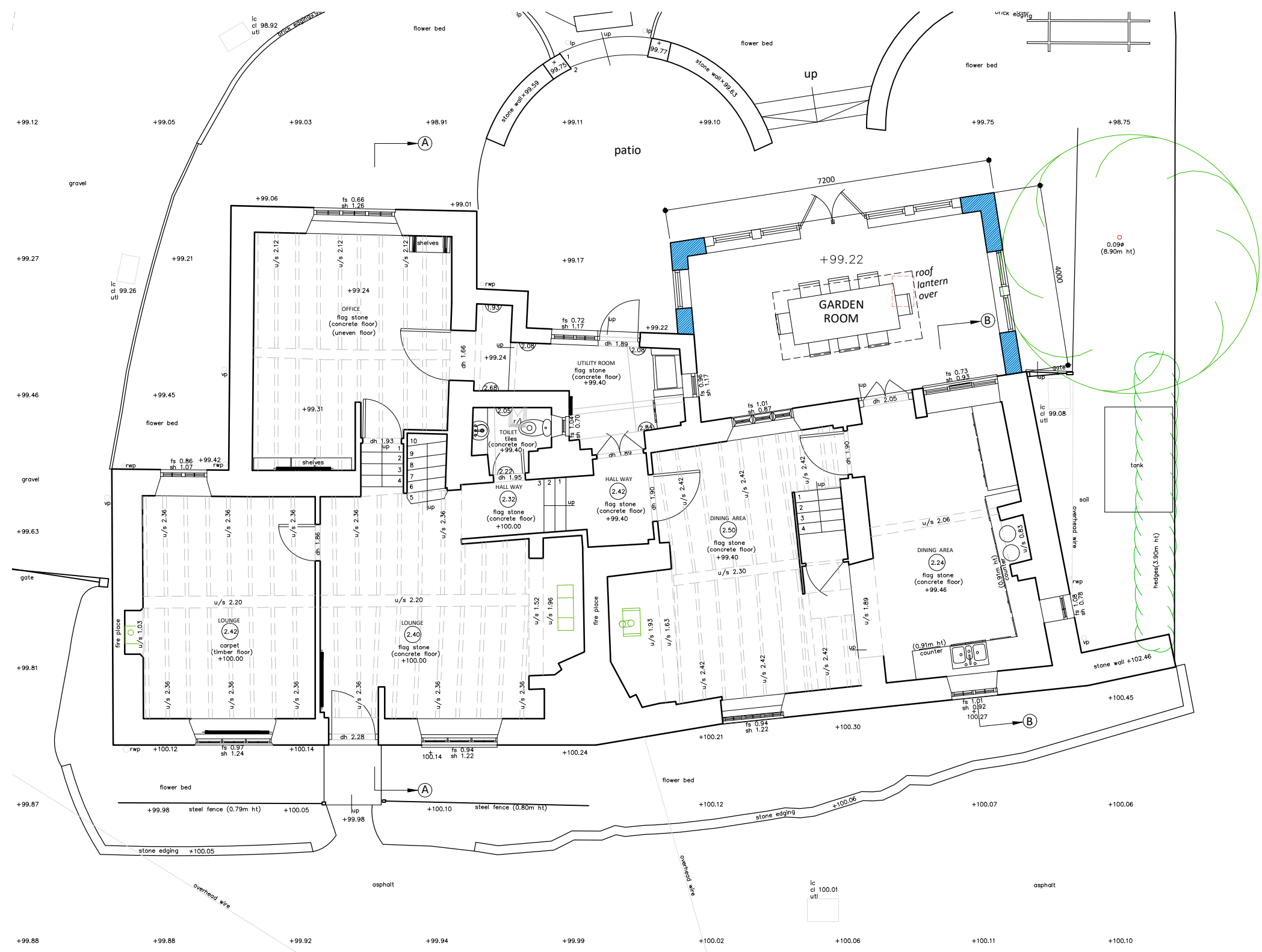
00 GROUND FLOOR PLAN 1:100