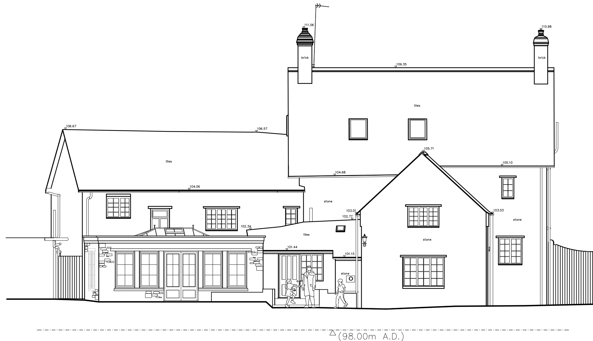
01 NORTH WEST ELEVATION 1:100