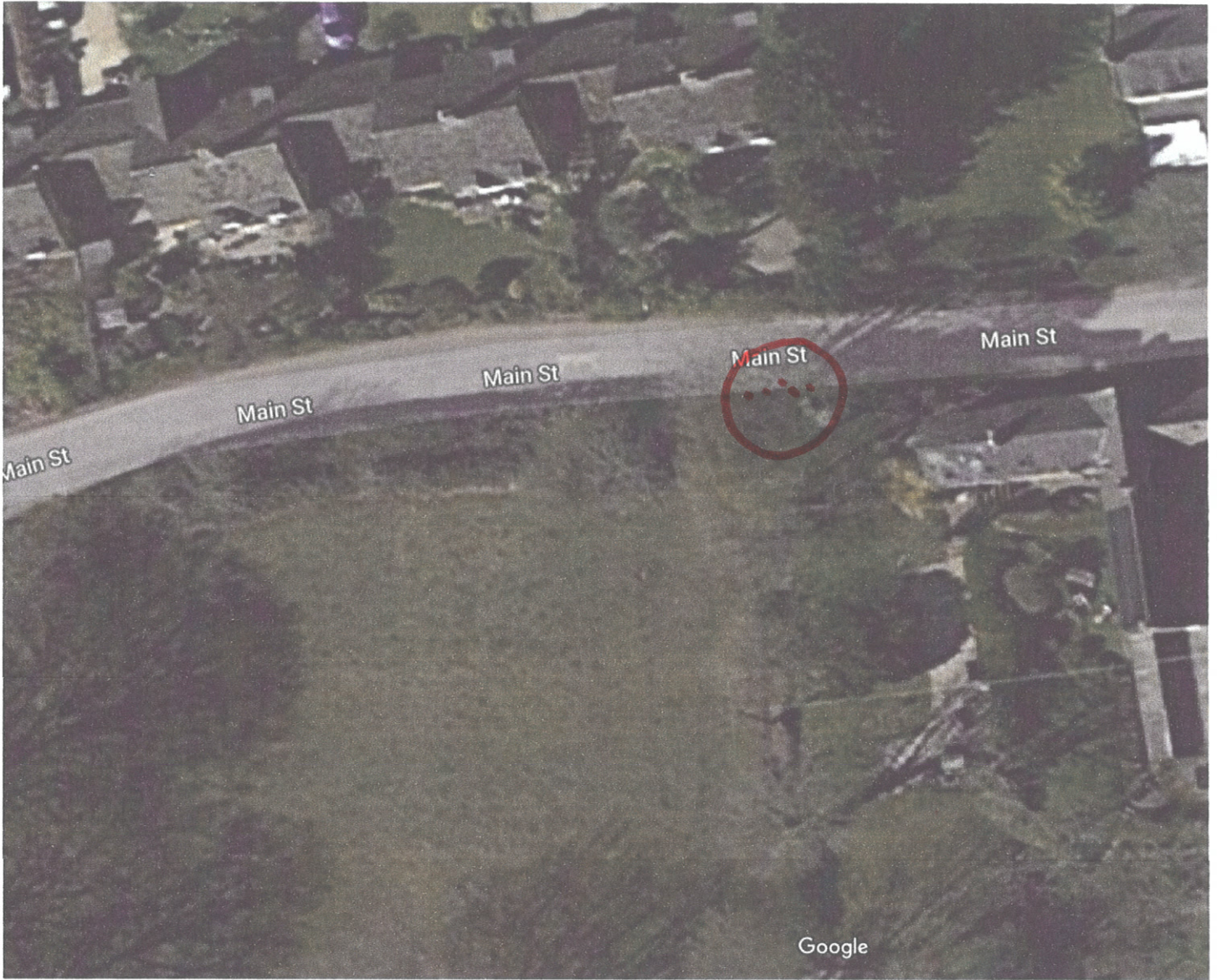
Imagery ©2022 Infoterra Ltd & Bluesky, Map data ©2022 5 m