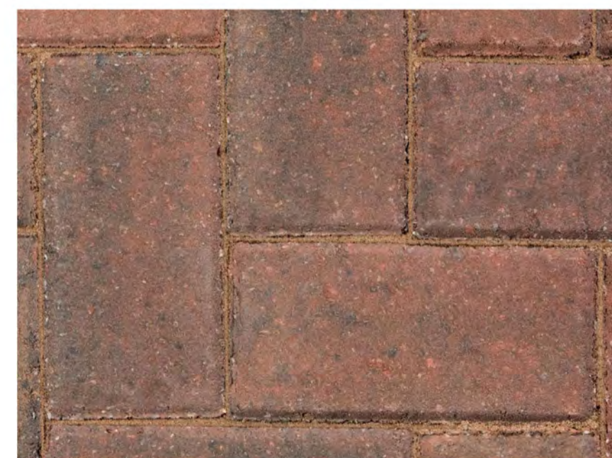
05 BLOCK PAVING TO PATHS 211 brindle