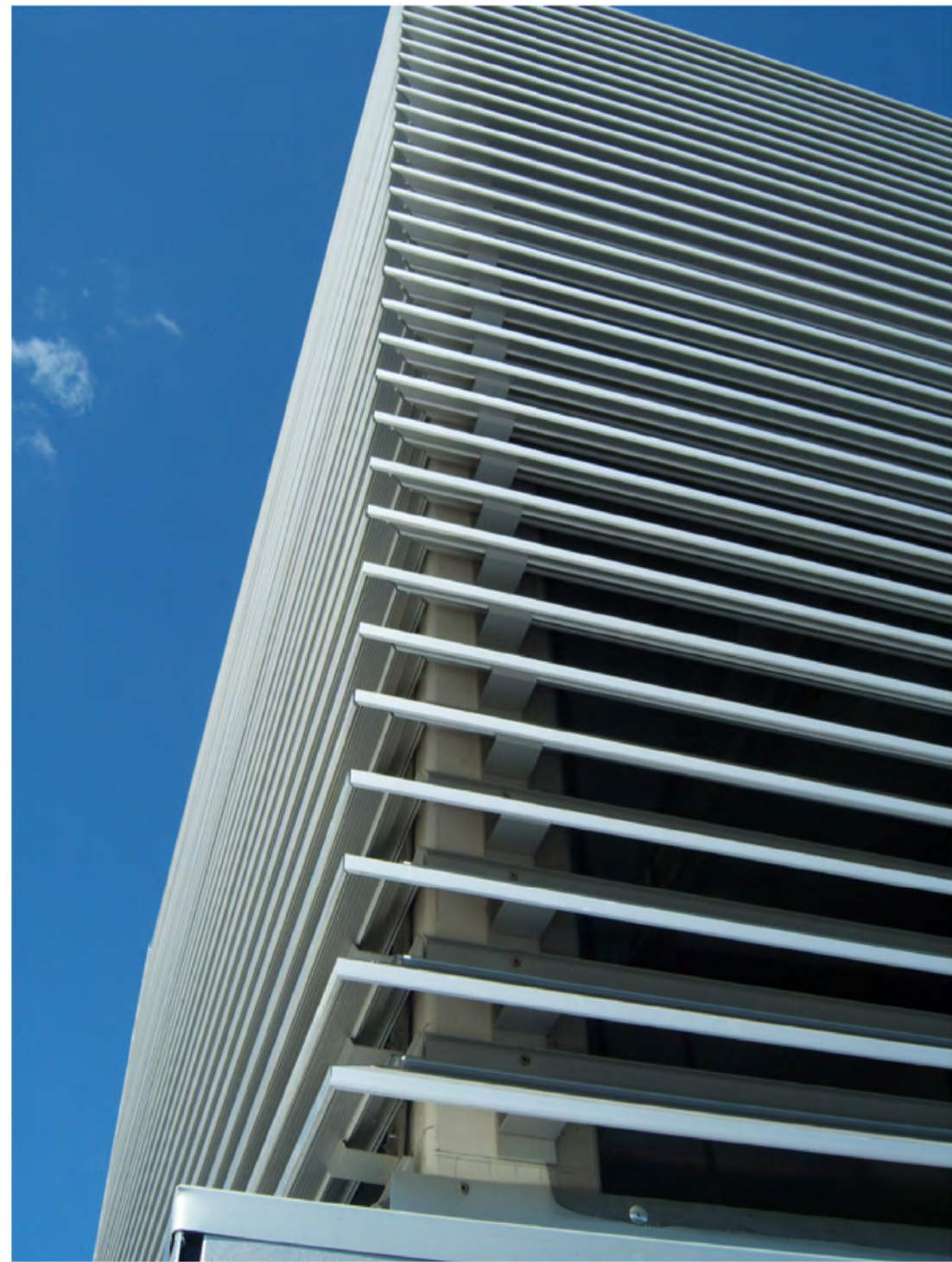
02 PPC plant screen - louvres 211 colour: Sirius RAL9006