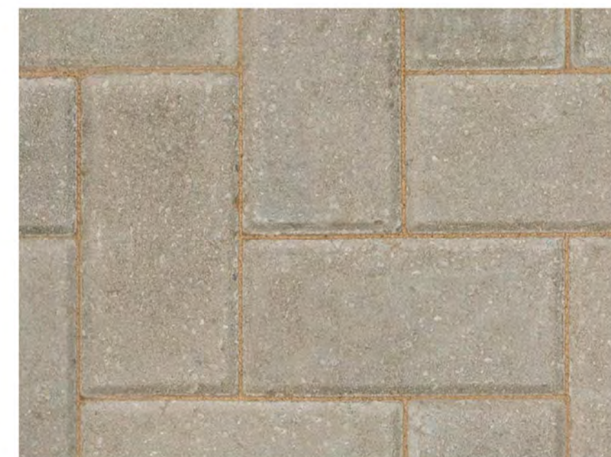
06 BLOCK PAVING TO CAR PARK CIRCULATION 211 natural