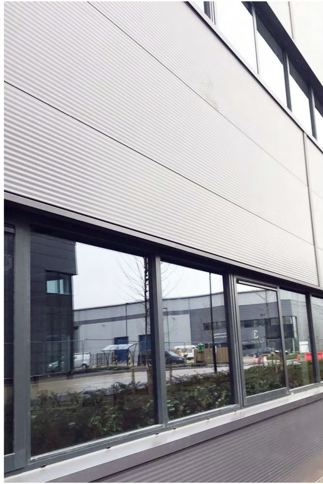
01 Aluminum Windows 211 Frame colour: Ral 7016