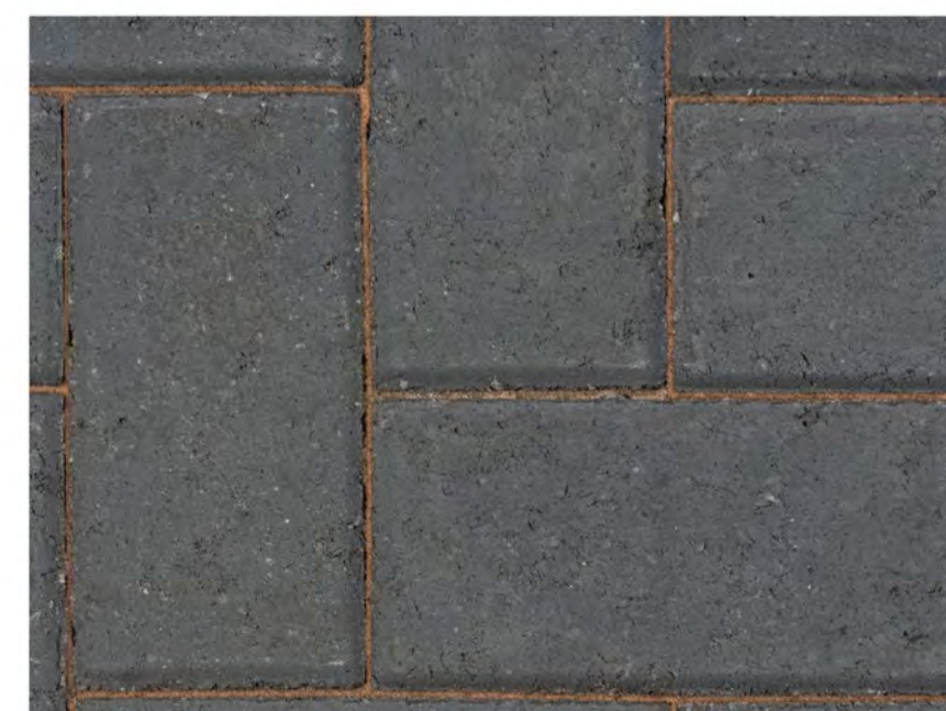
07 BLOCK PAVING TO PARKING BAYS 211 charcoal