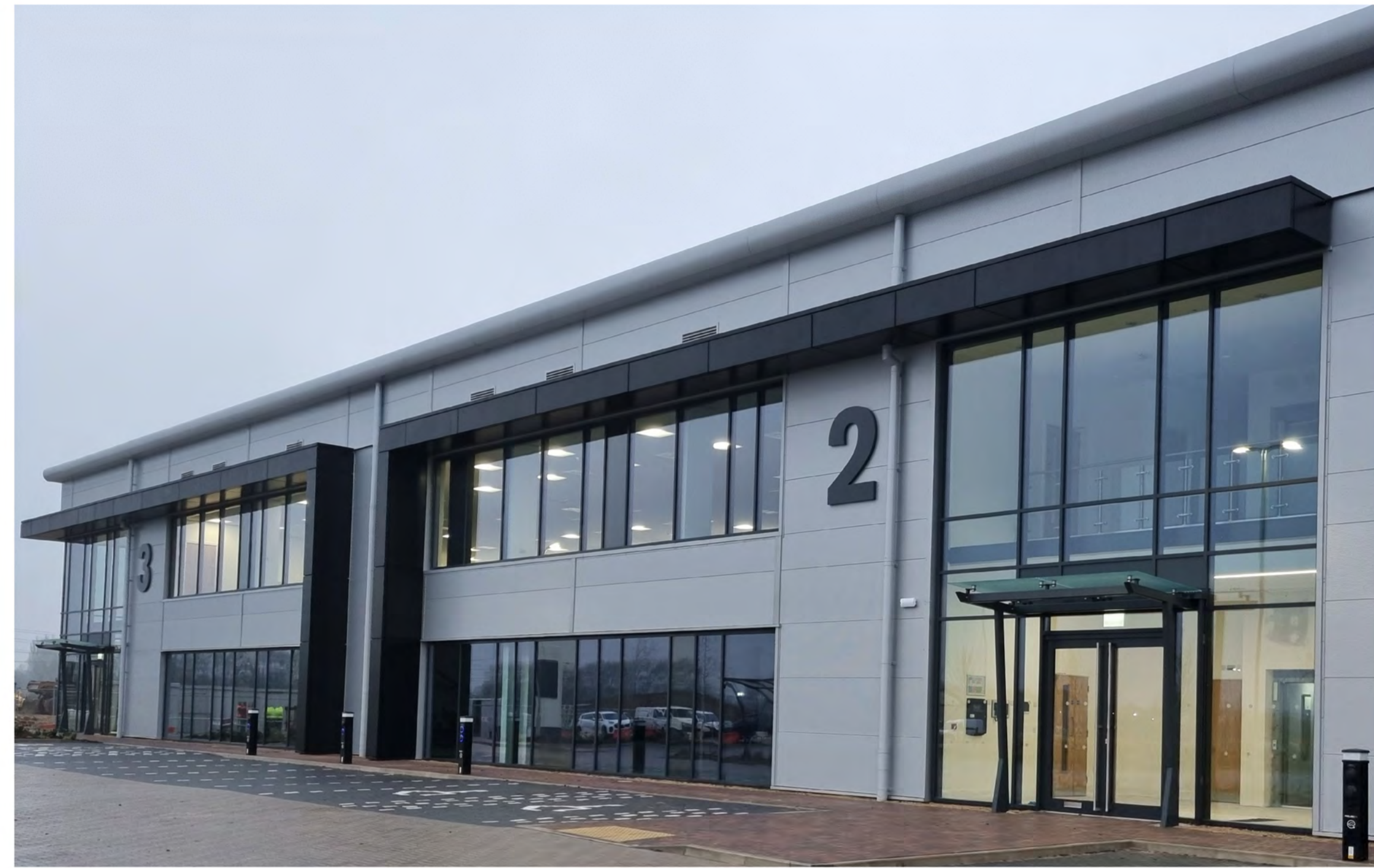
03 TRIMOTERM FACADE AND CURTIAN WALLING 211 building facade example