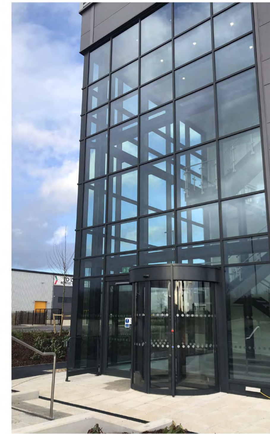
08 CURTIAN WALLING ENTRANCE 211 building facade example