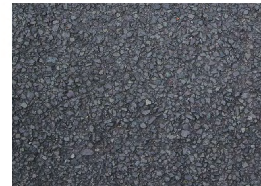
10 TARMAC CIRCULATION 211