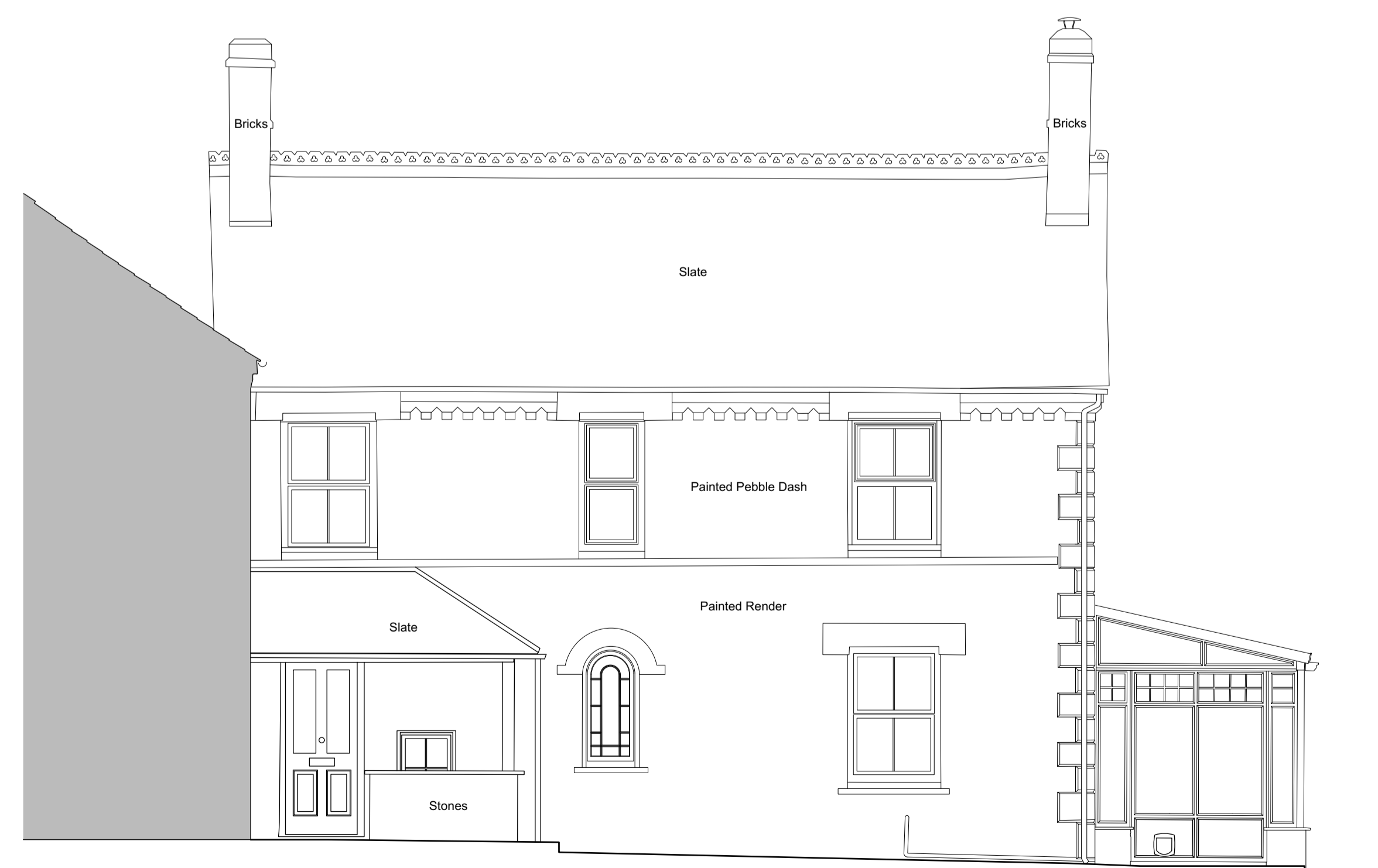
Proposed West Elevation (Main House) - No Change