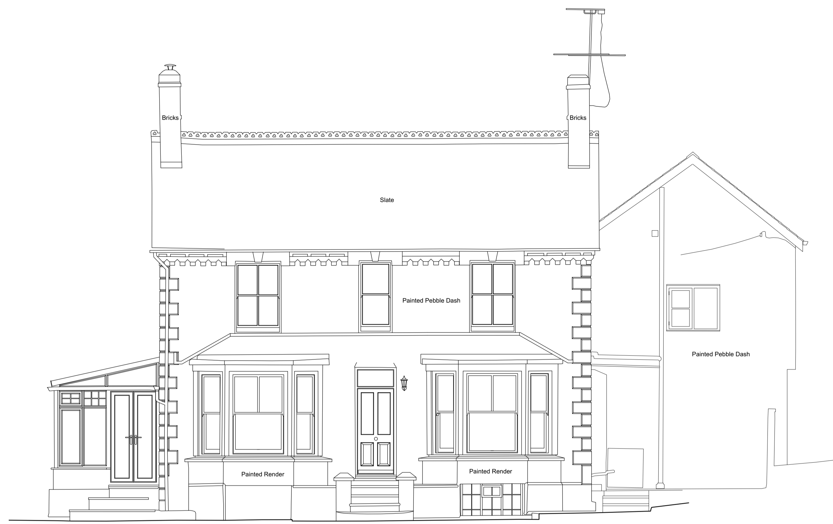
Existing East Elevation - No Change

NOTES 1. © This drawing is copyright to Manifest Design Workshop Ltd. 2. This drawing has been prepared solely for the purpose of obtaining planning permission and/or listed building consent.