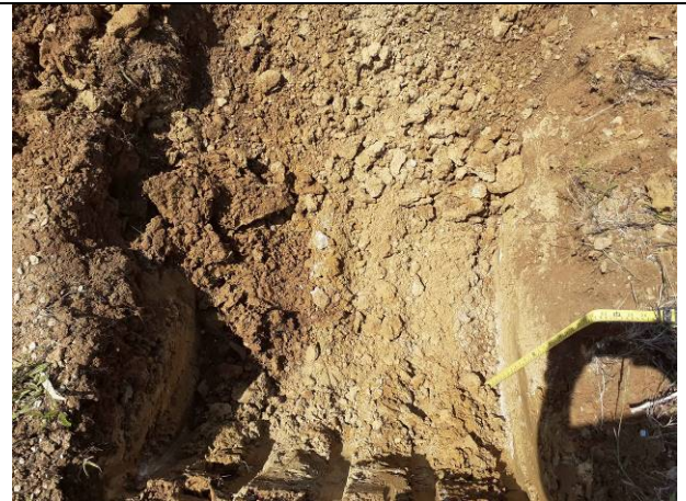
24.06.20 – TP7