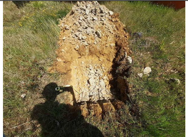
24.06.20 – TP2