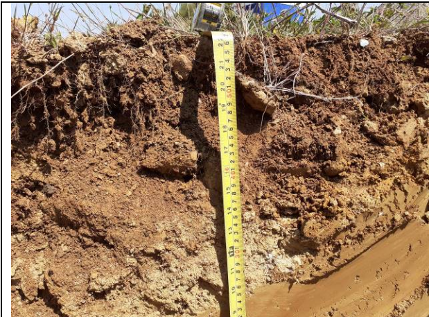
24.06.20 – TP7