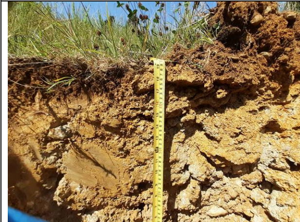
24.06.20 – TP2