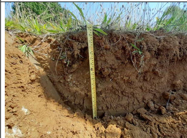
24.06.20 – TP3