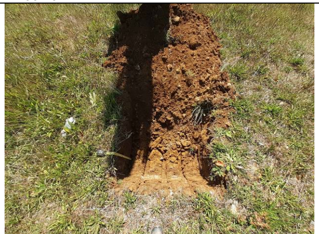
24.06.20 – TP3