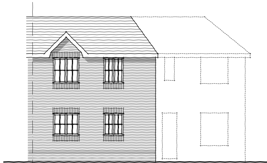
LH FRONT ELEVATION