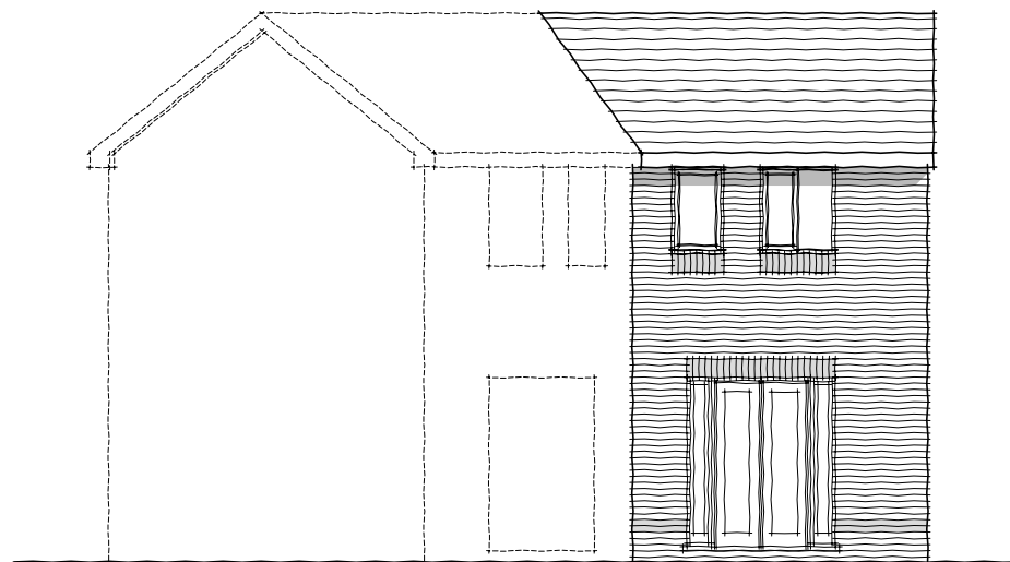
LH FRONT ELEVATION