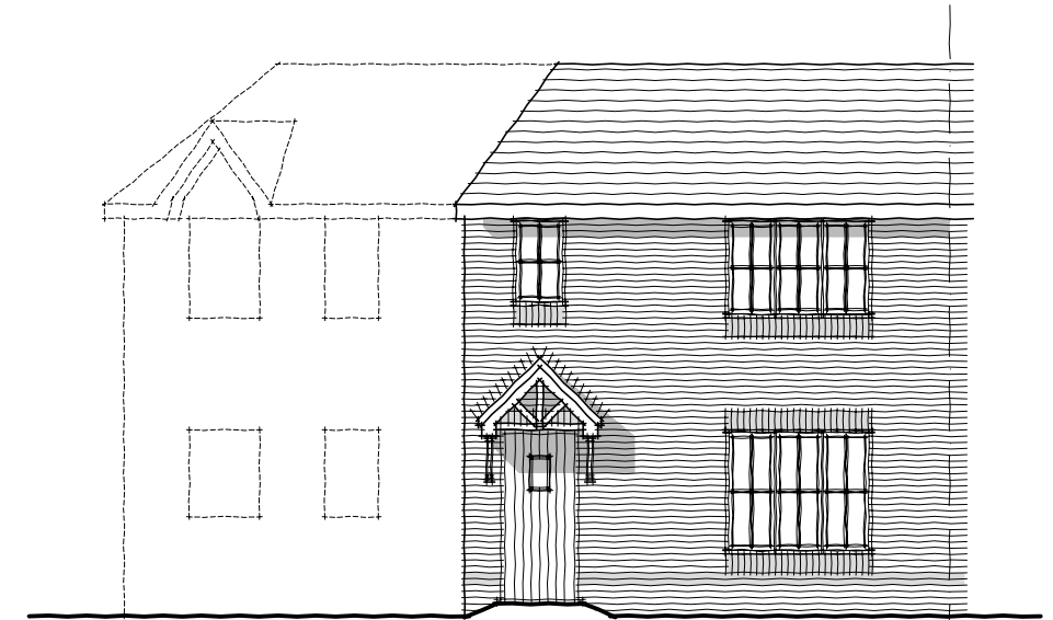
RH FRONT ELEVATION