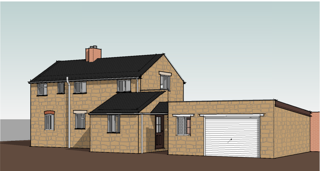
3D View 4