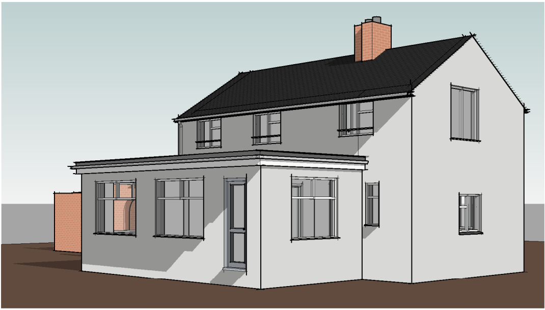
3D View 3