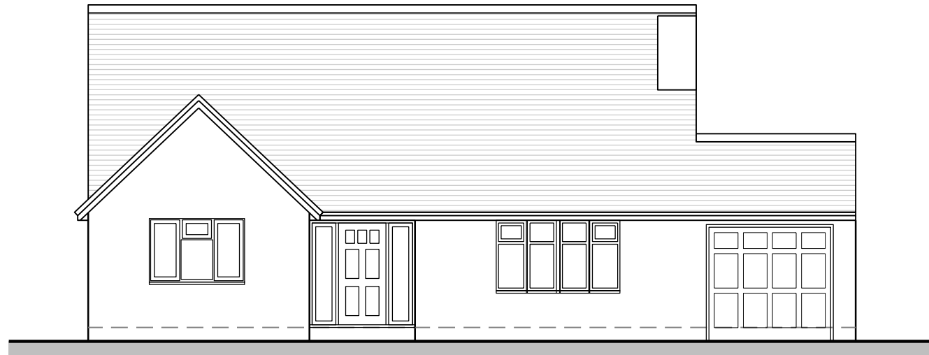
Existing West (Front) Elevation Scale. 1:100

Walls: Coursed Bradstone (Buff) Roof: Concrete Plain Tiles. Corrugated Sheeting to single storey Windows: UPVC (White) Doors: UPVC (White)