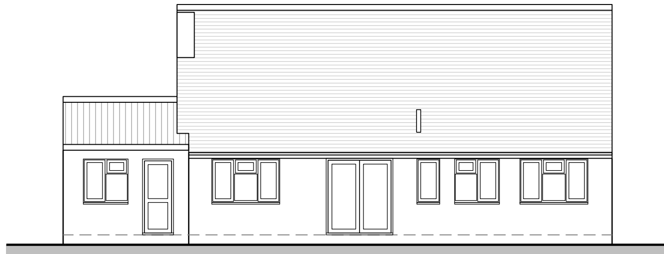
Existing East Elevation Scale. 1:100