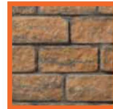
Reconstituted Rubble Ironstone