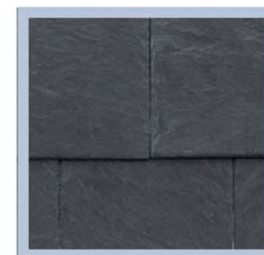
High Quality, Blue/Black, Natural Slate