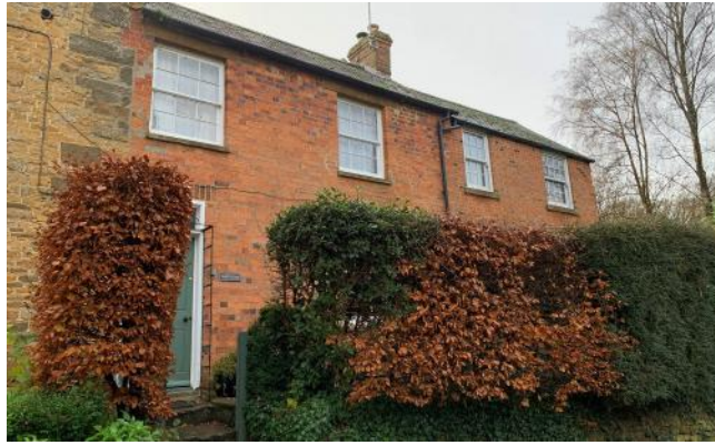
View along Main Street looking south showing vernacular orange brick