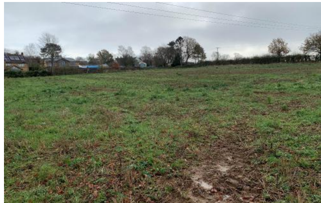
View over southern boundary from north west corner