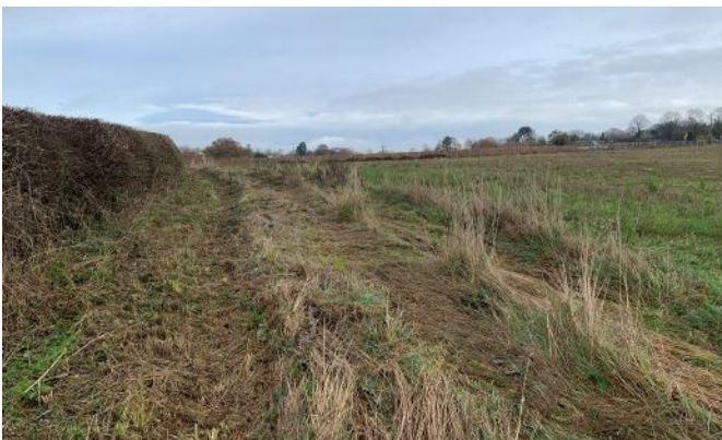
View from neighbouring development site looking north