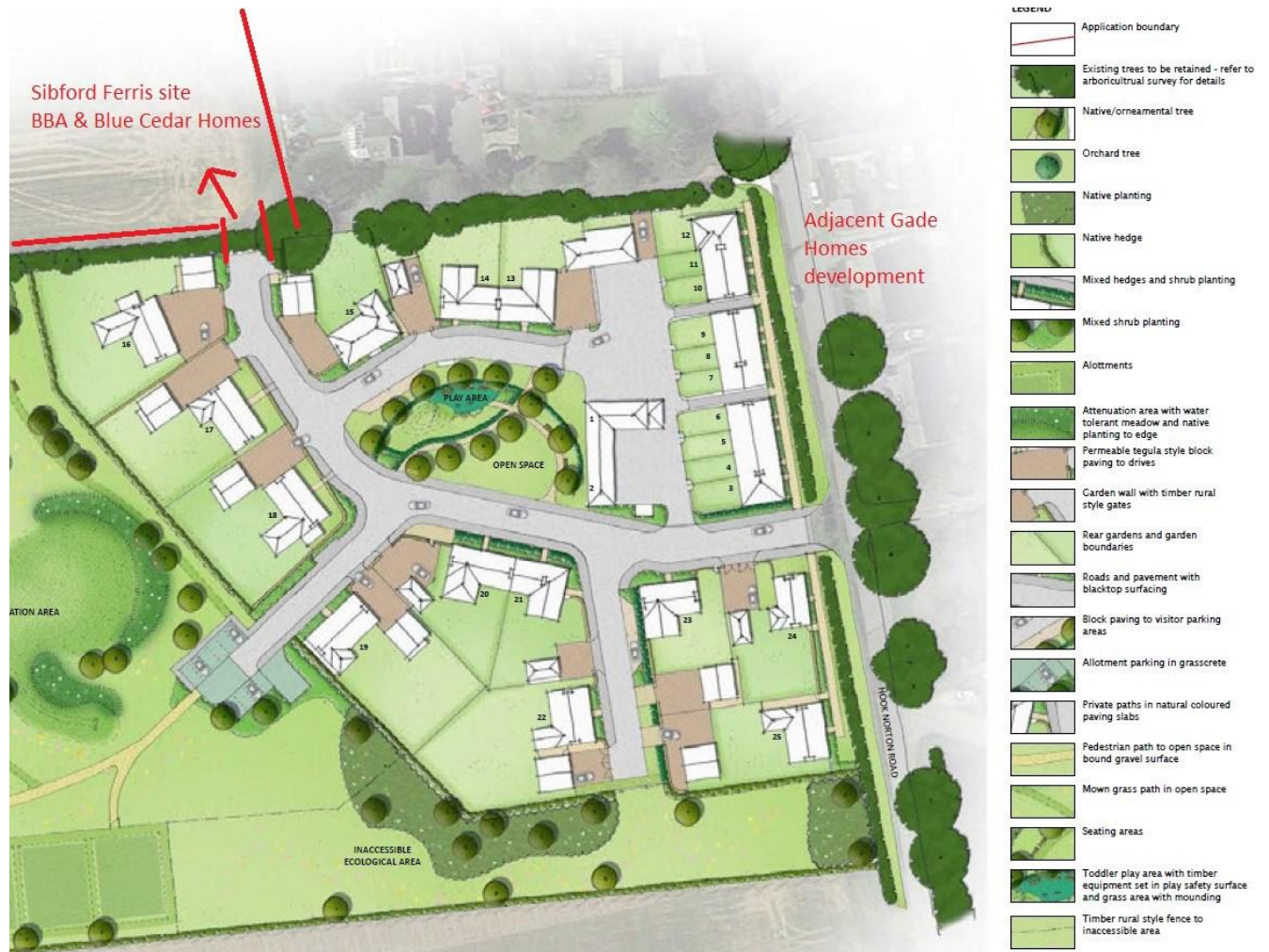
Reserved Matters Site Plan of adjacent proposed development

The application site is assessed for development in the Council's 2014 SHLAA (SF005).