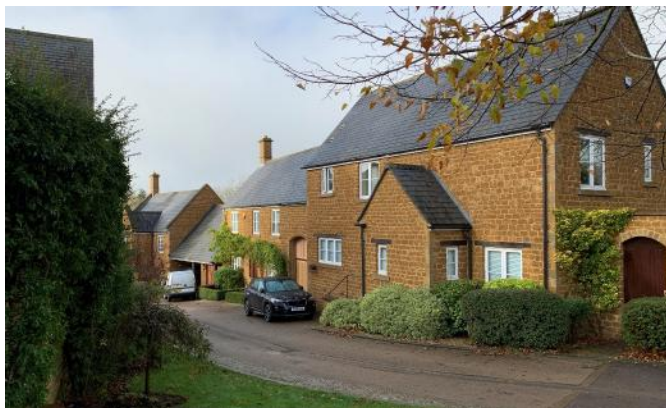
View down Walford Road housing scheme