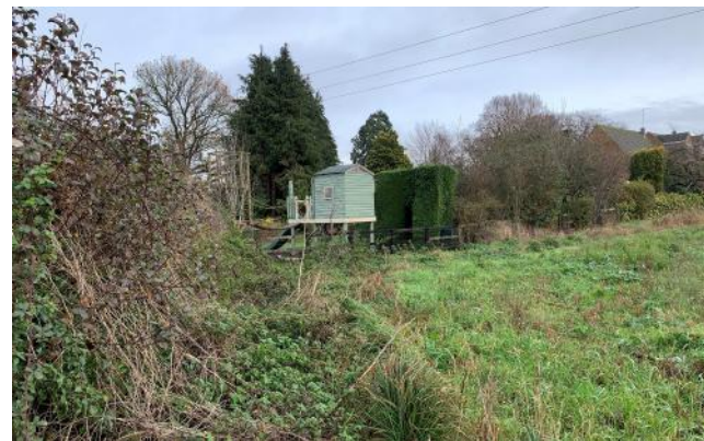
North east corner boundary partially open