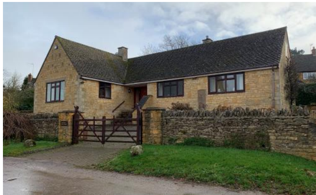
Bungalow at Junction of Woodway Road/Hook Norton Rd