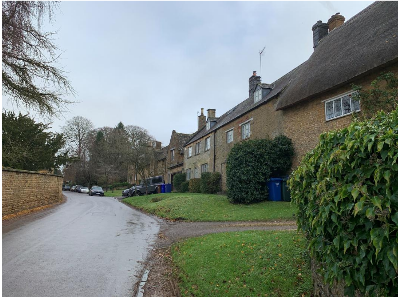
View up Main Street overlooking heritage buildings to the south (The Old House—with thatched roof, The Old Backhouse, and Home Close all Grade 2 listed buildings)

Much of Sibford Ferris (around Main Street, and not including the application site) is designated as a Conservation Area and is attached to the Conservation Area which covers Sibford Gower and Burdrop.