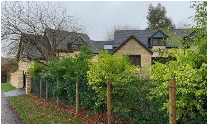
Newly extended dwelling on east site of Hook Norton Rd