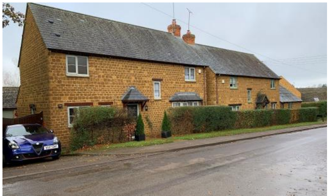
View west along Hook Norton Road/Stewarts Court