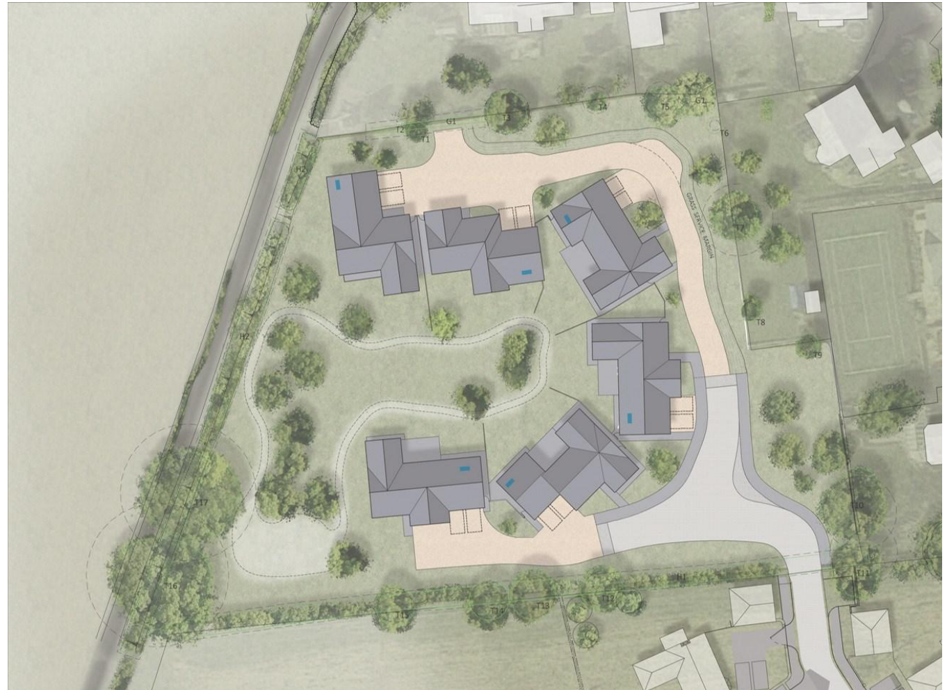
Cycle Storage Plan

Within the development there are 6 proposed single storey dwellings. There is also additional reinforcement provided within the roof structure to allow for the provision of hoists if needed. Level access is to be provided throughout the site.