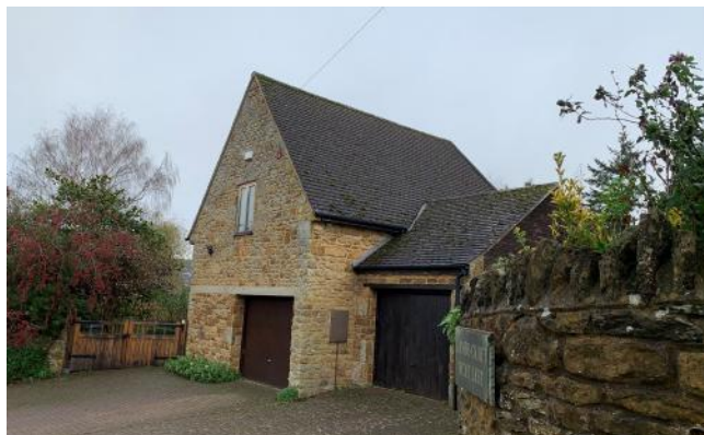
Gable frontage building overlooking Hook Norton Road