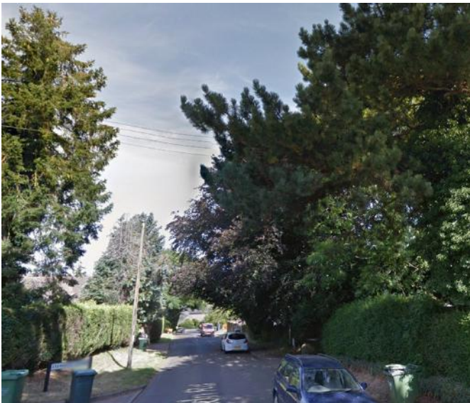
Hook Norton Road (image from Google Maps)

There is a lot of soft landscaping within the Streetscene of Sibford Ferris and mature Trees and large hedgerows form a key feature.