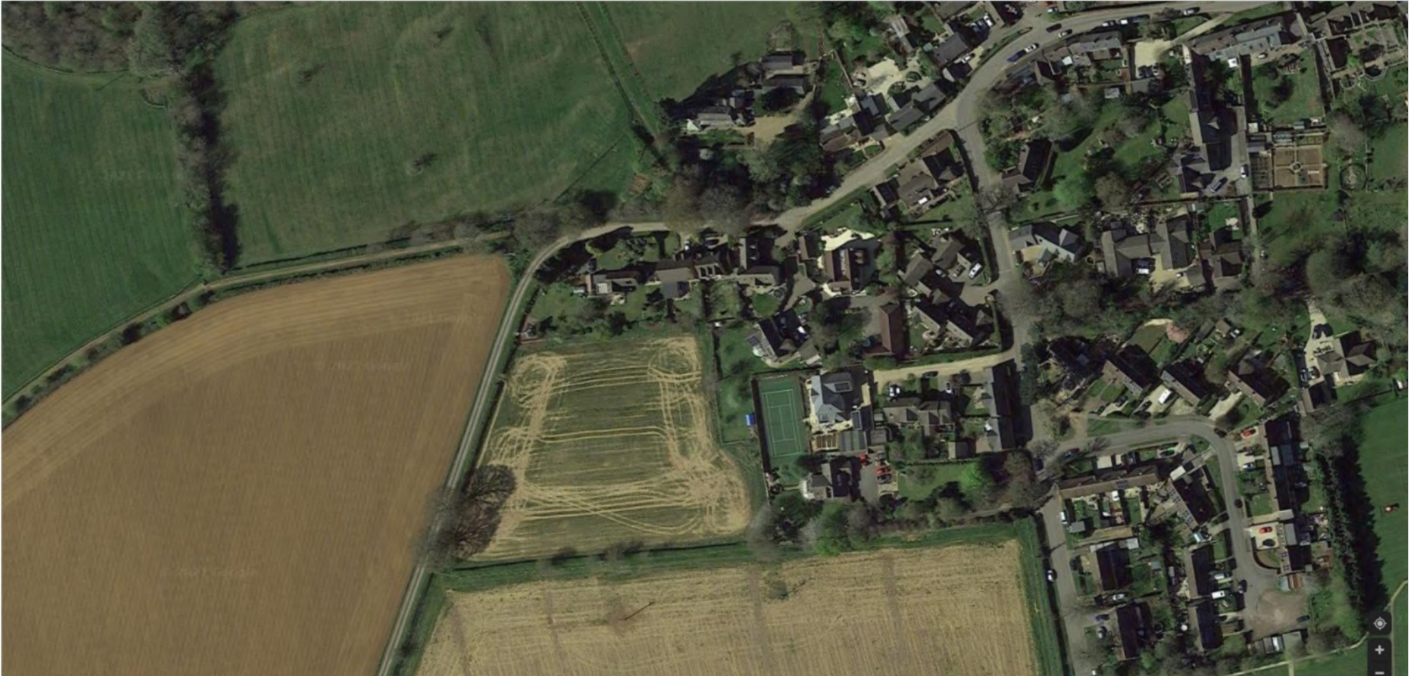
Aerial image of site