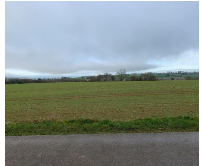
View from Woodway Road looking west from the application site

Close public views of the site are limited to Woodway Road which forms the western boundary of the site. The site is on the western edge of the village and therefore longer range views across the valley, both to and from the site need to be considered. This has been considered by an inspector as part of the appeal for the development to the south