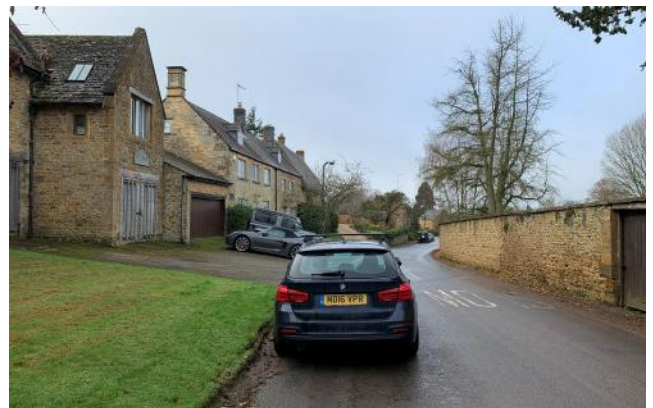
Mix of Gables, garages, driveways, houses front gardens, main elevations, landscaping & vehicles facing the road