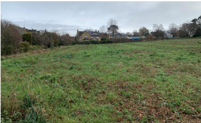
View east from north west corner of site