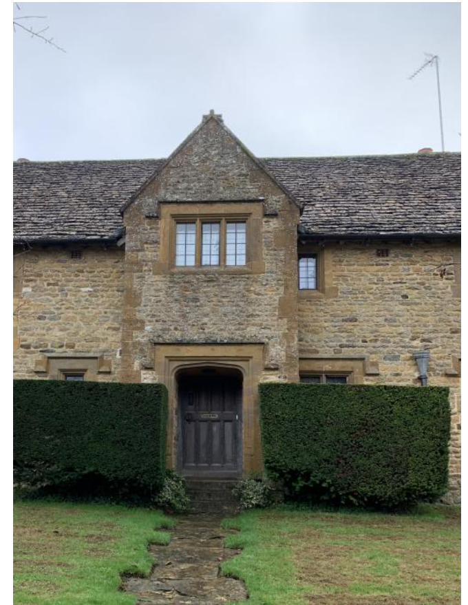
Heritage Setting of listed buildings