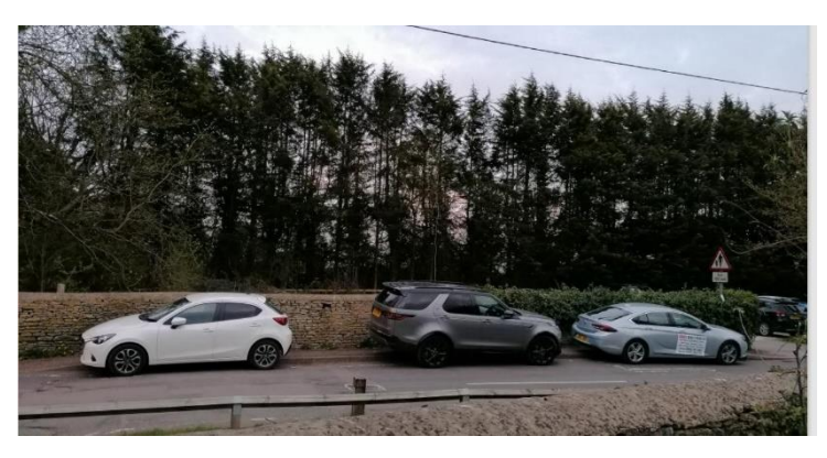
M40 Congestion – current event most days and cars cut through the village to avoid it