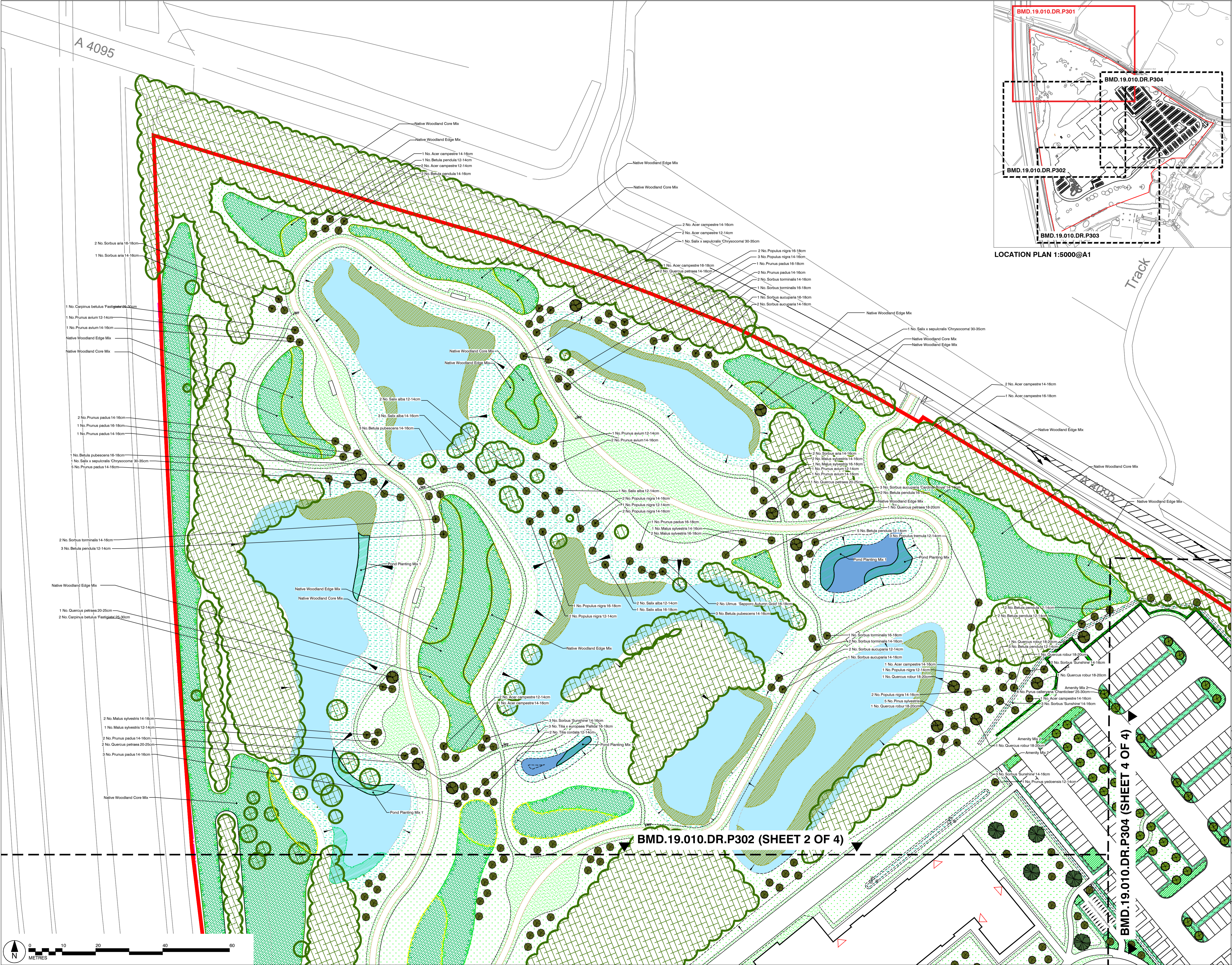
BMD.19.010.DR.P302 (SHEET 2 OF 4)