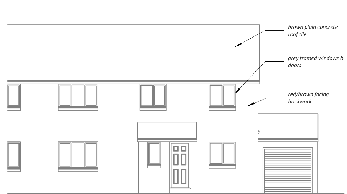
4 P06 SSW elevation - proposed 1 : 100