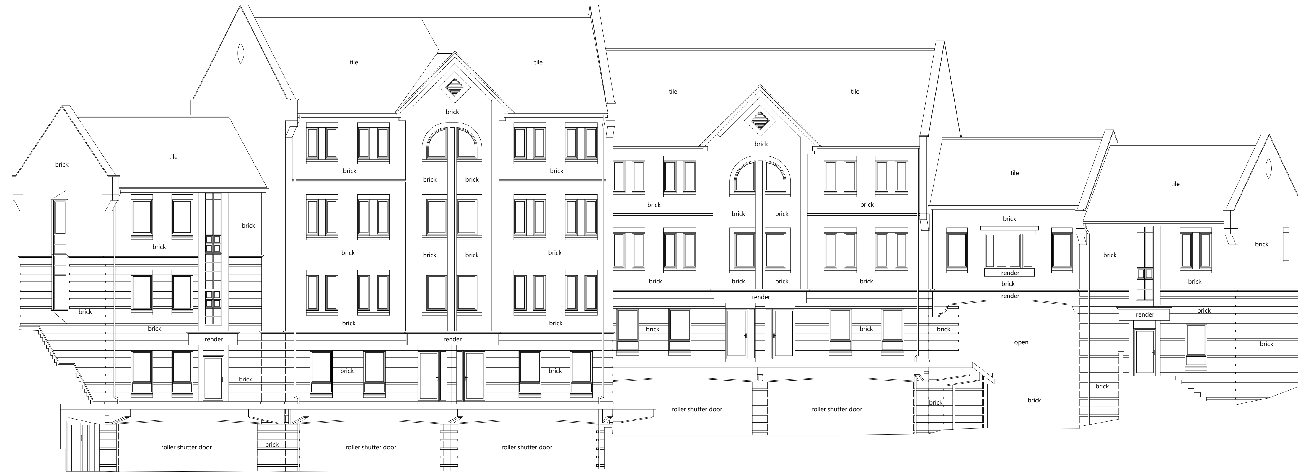
EXISTING FRONT ELEVATION (E2) - SCALE 1:100 @ A0