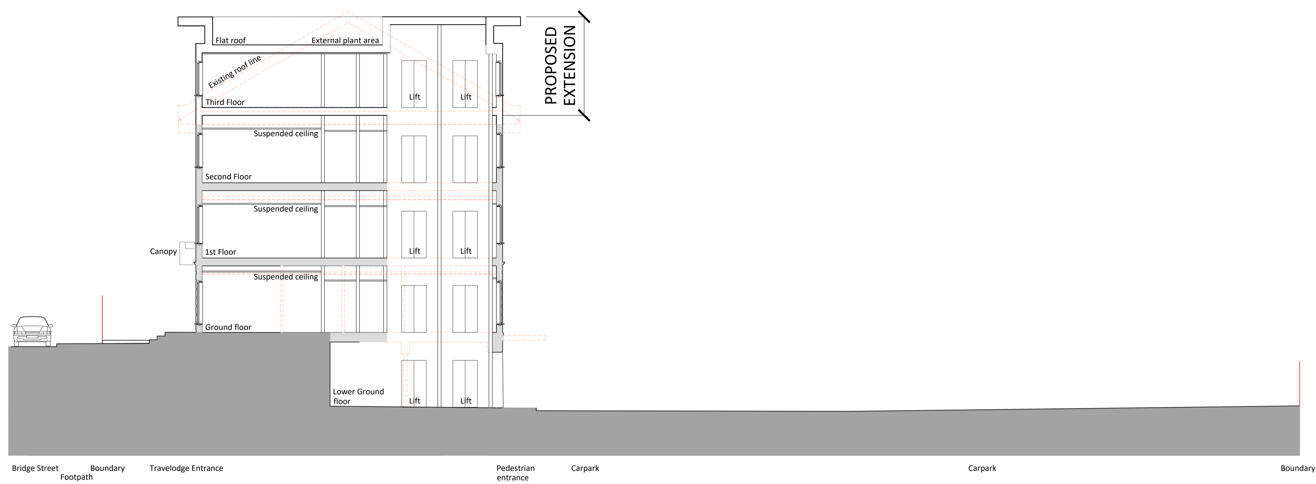
B 23 Section BB 1:100@A1