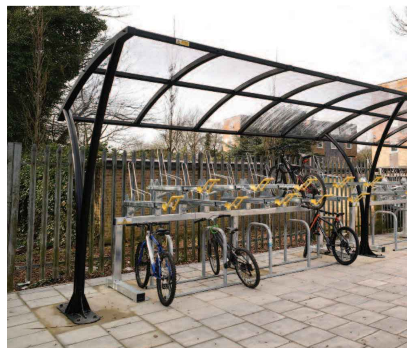
TYPICAL CYCLE SHELTER IMAGE