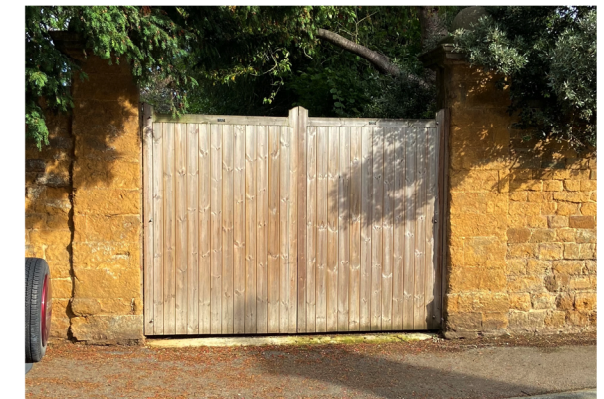
Similar gates and context on the High Street